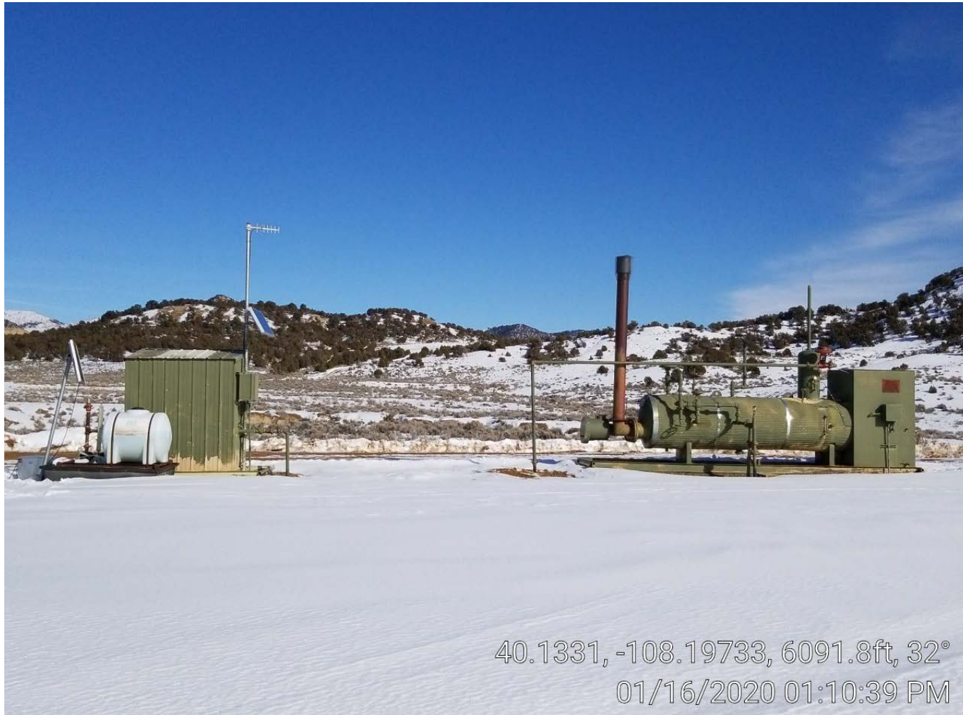
Photo 3. Separator & meter building.

WRD DOW 20-11 API: 05-103-10132 Inspection: 679707003