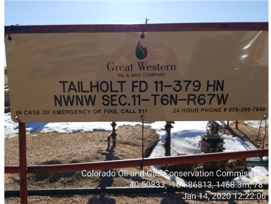
Colorado Oil and Gas Conservation Commission 40.50833, -104.86813, 1468.3m, 78° Jan 14, 2020 12:22:06