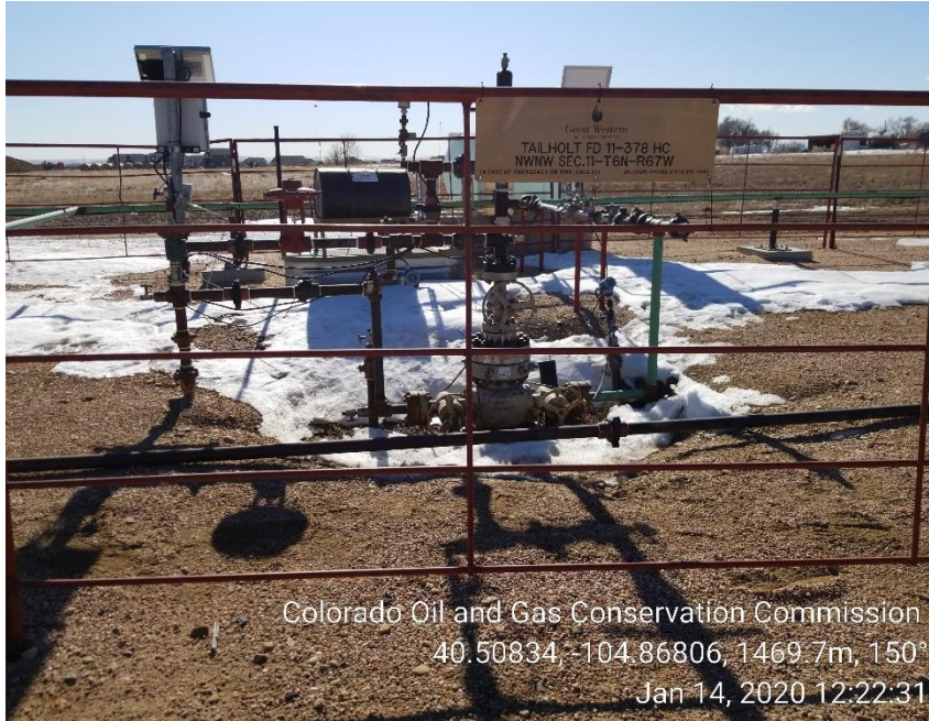
Colorado Oil and Gas Conservation Commission 40.50834, -104.86806, 1469.7m, 150° Jan 14, 2020 12:22:31