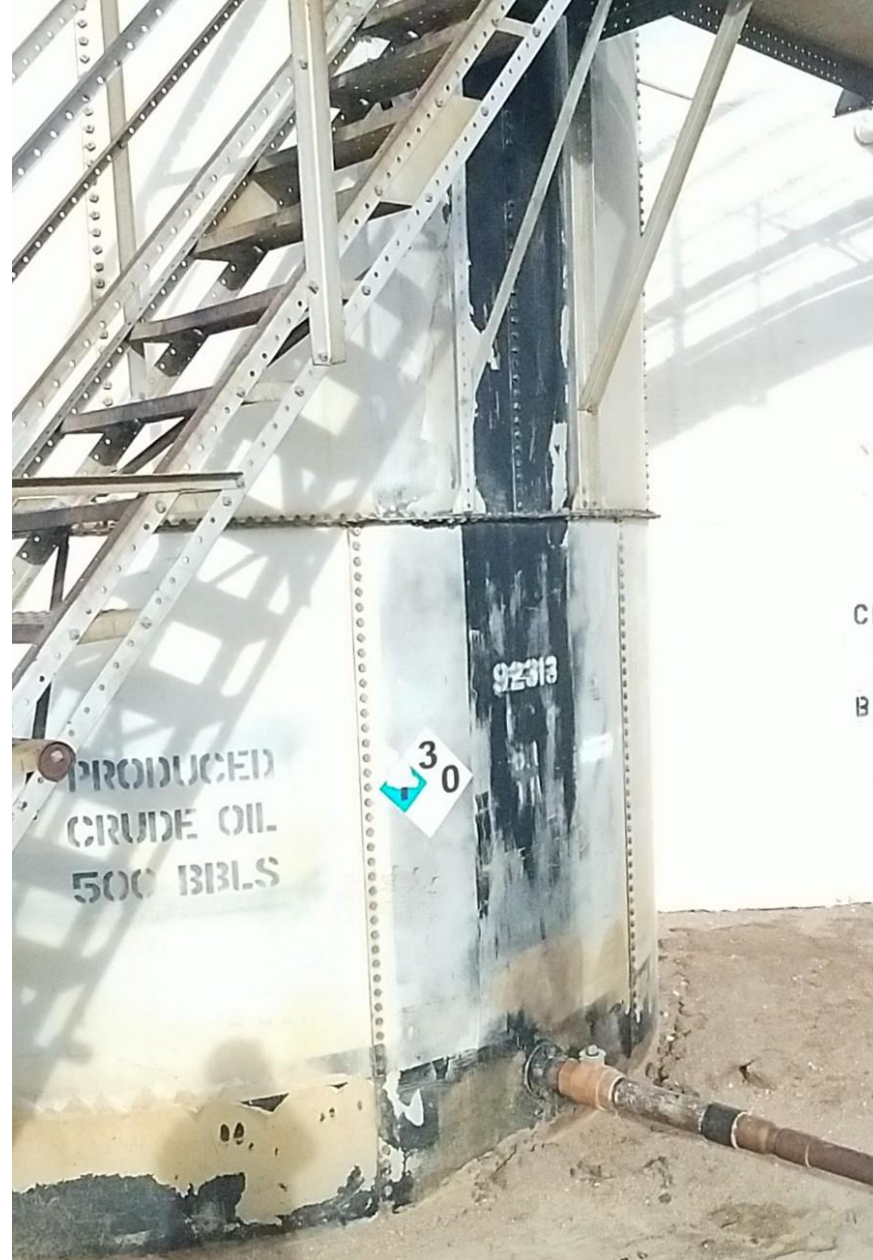
Colorado Oil and Gas Conservation Commission 39.78503, -103.20435, 4760.5ft, 21° 01/08/2020 02:19:36 PM