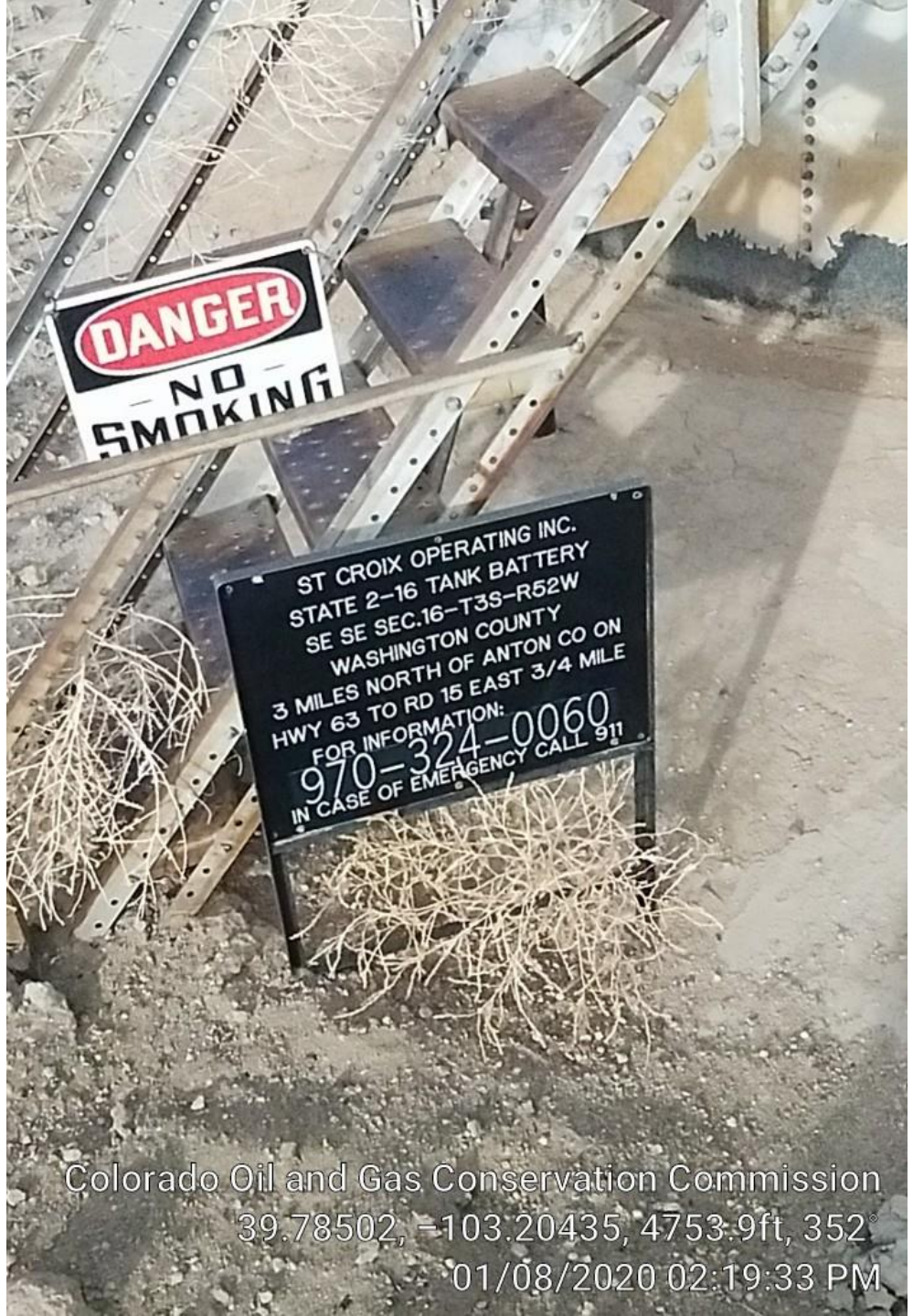
Colorado Oil and Gas Conservation Commission 39.78502, -103.20435, 4753.9ft, 352° 01/08/2020 02:19:33 PM