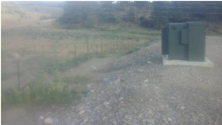
Completed work description Completed work description of corrective action 4 Summary of all work completed

treated noxious weeds treated noxious weeds in reclamation area treated noxious weeds in reclamation area