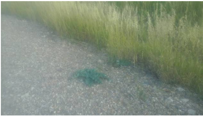
Completed work description of corrective action 3 Photo of fourth corrective action completed