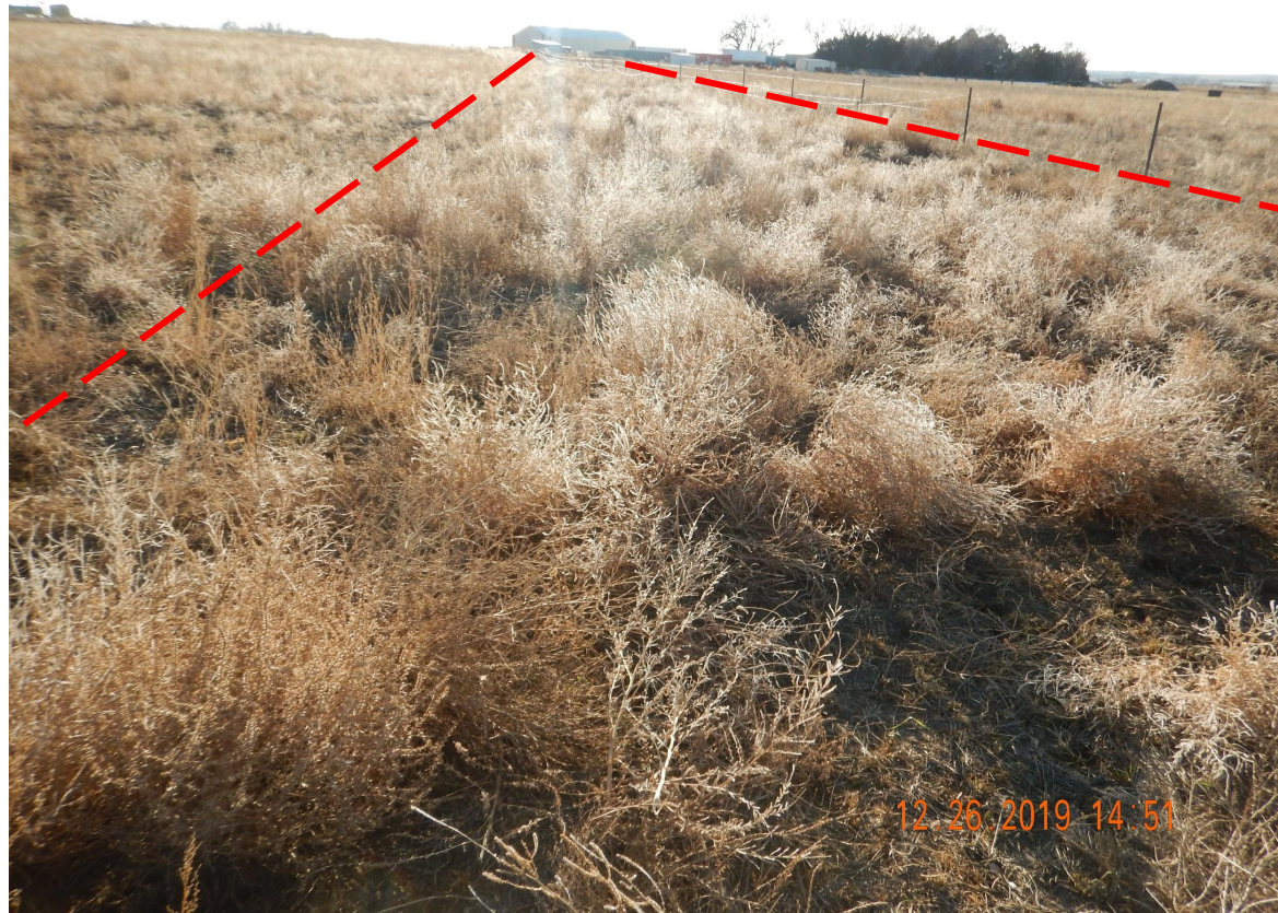
Photo 4. Photo taken from the northern access road, facing South. See comments under Photo 3.