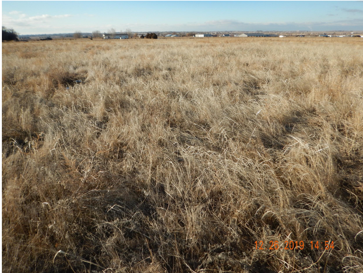
Photo 7. Reference photo taken south of the well location, facing West. Photo illustrates mostly sand dropseed, crested wheatgrass, and cheatgrass.