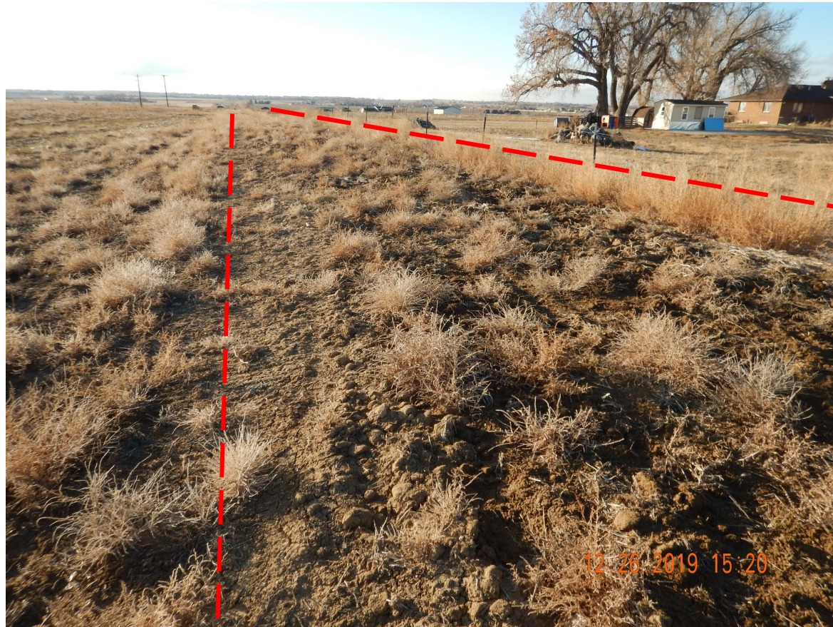
Photo 2. Photo taken from a portion of the access road just west of the tank battery, facing West. Photo illustrates Operator has failed to properly contour all of the access road west of the tank battery- refer to Photo 1.