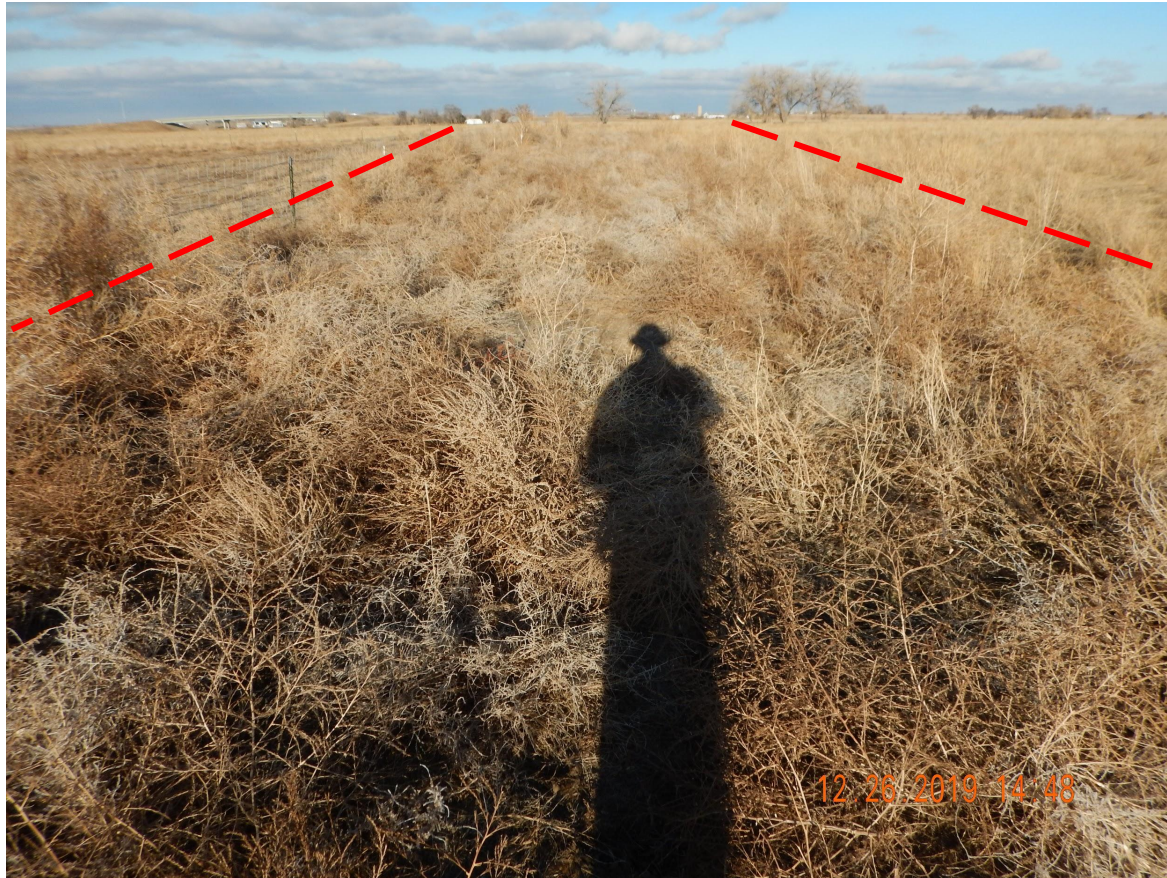
Photo 3. Photo taken from the western tank battery location/access road, facing North. Photo illustrates a high density of Russian thistle and Kochia, not reflective of reference areas. There was some germination of desirable species; however, appears much of the germination has been grazed.