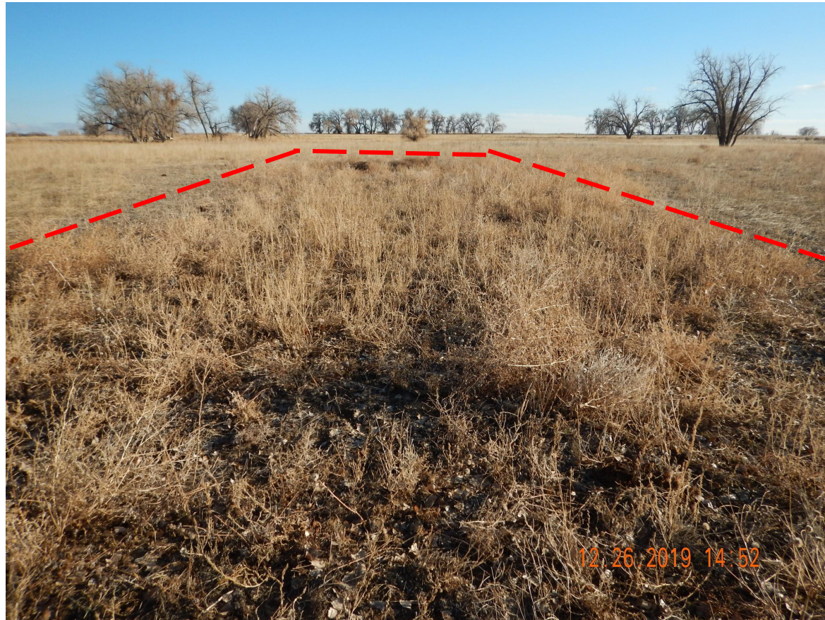
Photo 5. Photo taken from the northern access road, facing East. See comments under Photo 3.