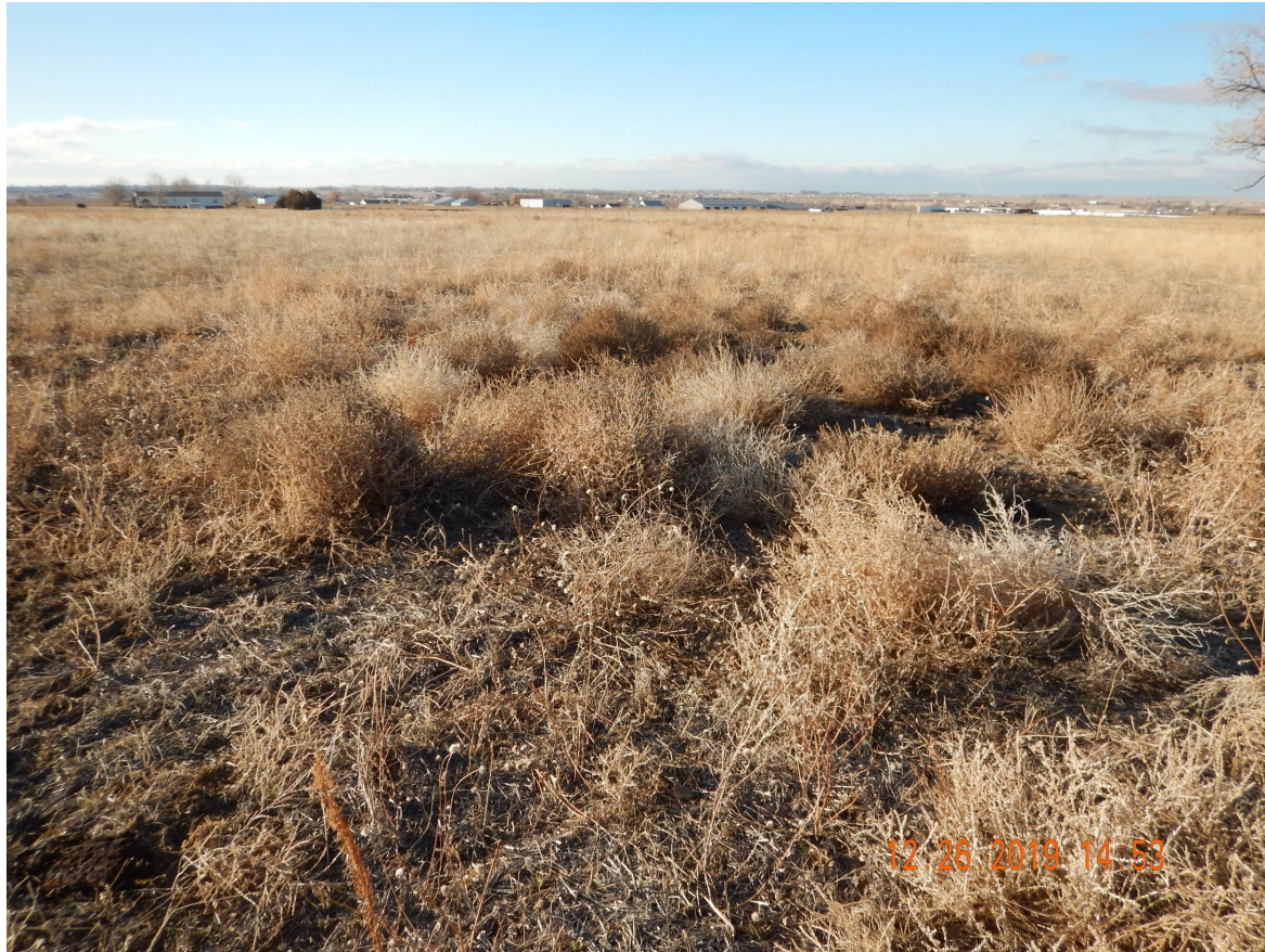
Photo 6. Photo taken from the well location, facing West. See comments under Photo 3.