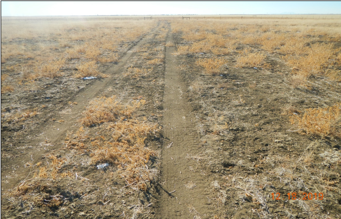
Photo 9. Facing southwest along the reclaimed portion of the road. It appears vehicles have been driving at this area. There are numerous Buffaloburs growing in the reclaimed area.