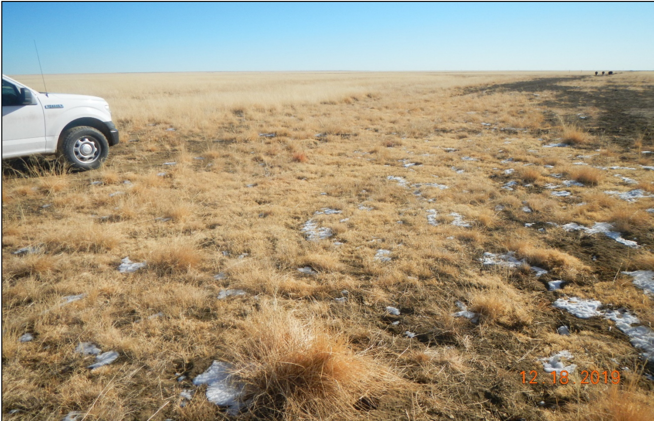
Photo 6. There is an ephemeral stream crossing at this point along the two track road. This area appears to be stabilized.