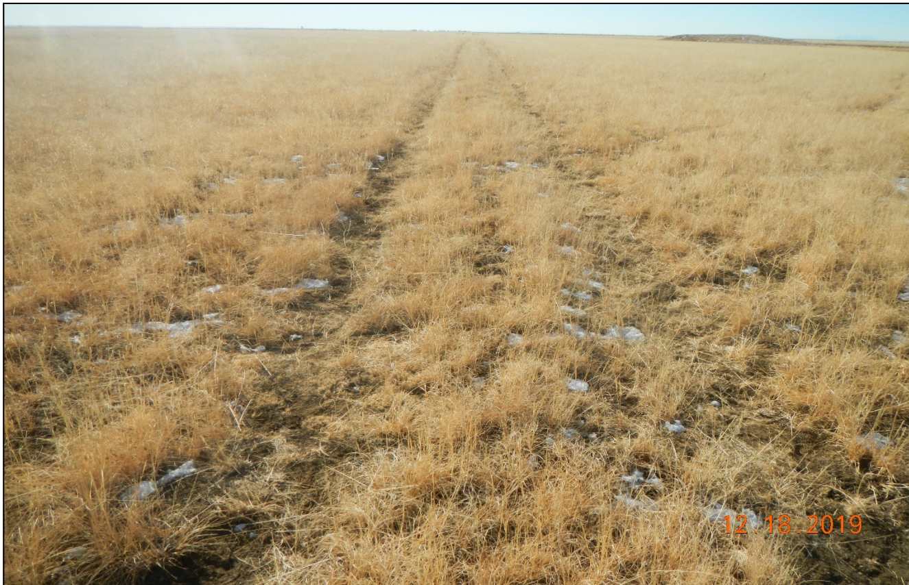
Photo 1. Facing southwest along the two track road.