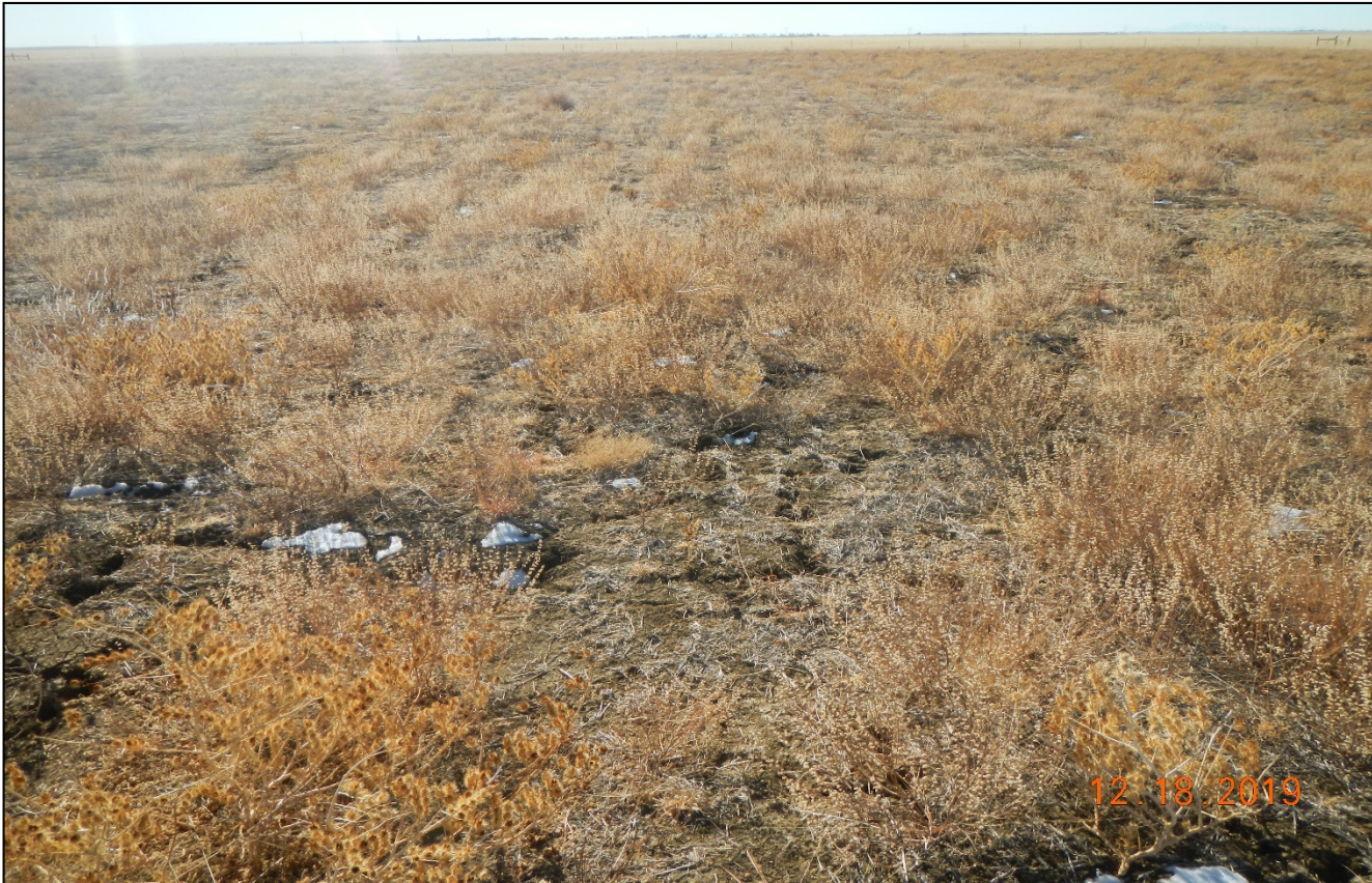
Photo 18. Facing southwest toward the location. There is predominately undesirable species growing at the location.