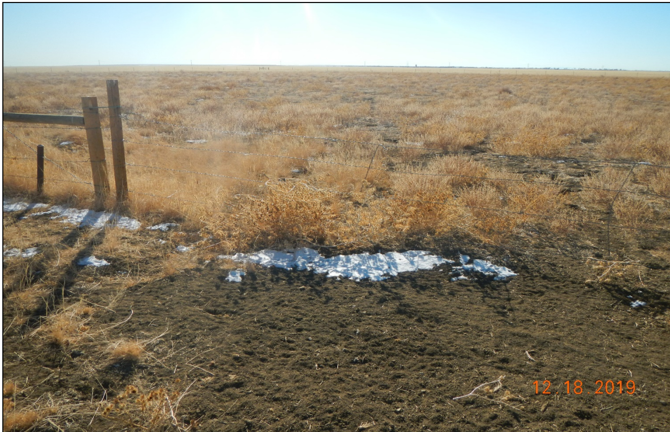
Photo 10. Facing south toward the location. There is a perimeter fence around the location.