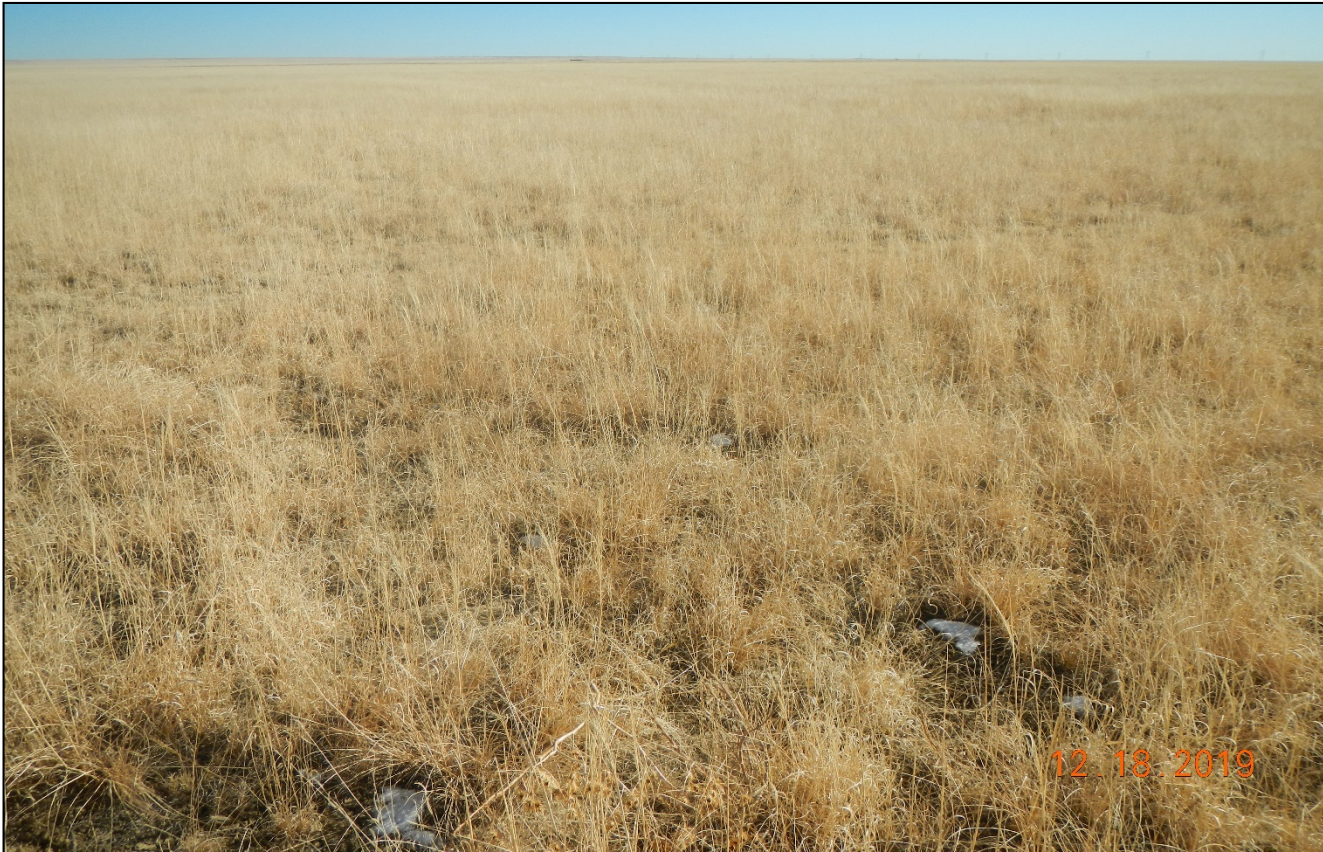
Photo 19. Facing east toward the surrounding reference area which consists of predominately Blue grama and Sand dropseed.