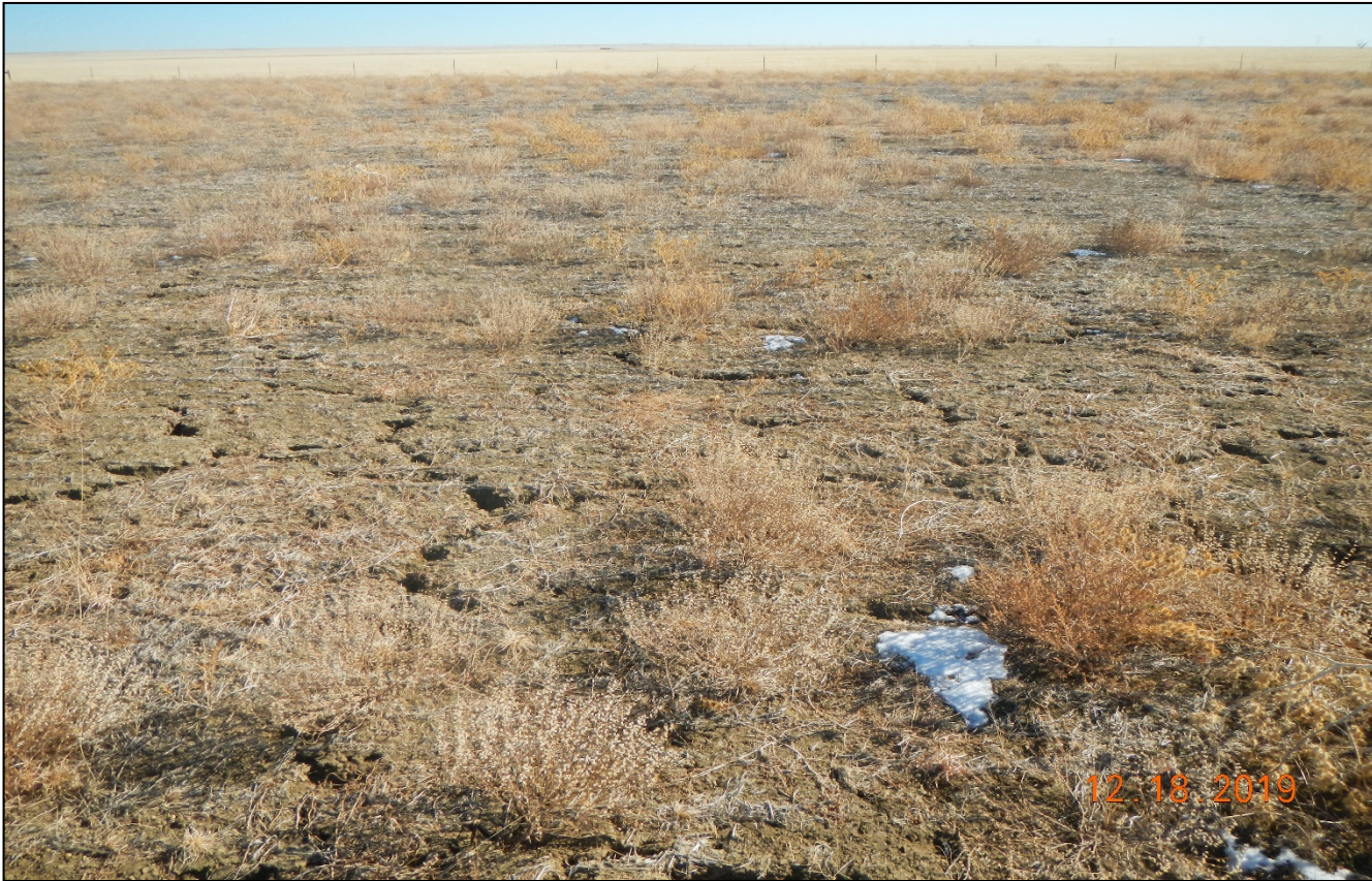
Photo 14. Facing southeast at the center of the location.