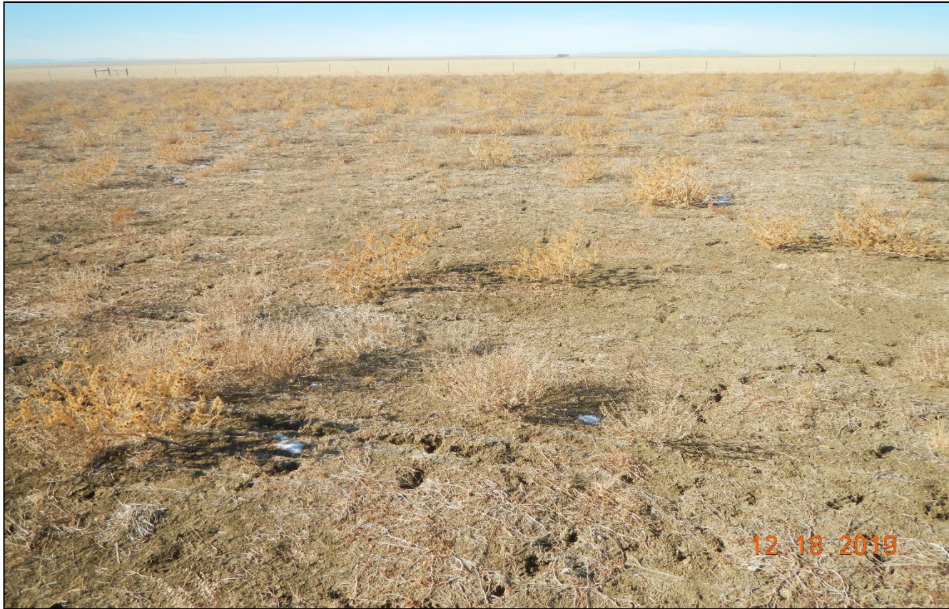
Photo 12. Facing northwest at the center of the location.