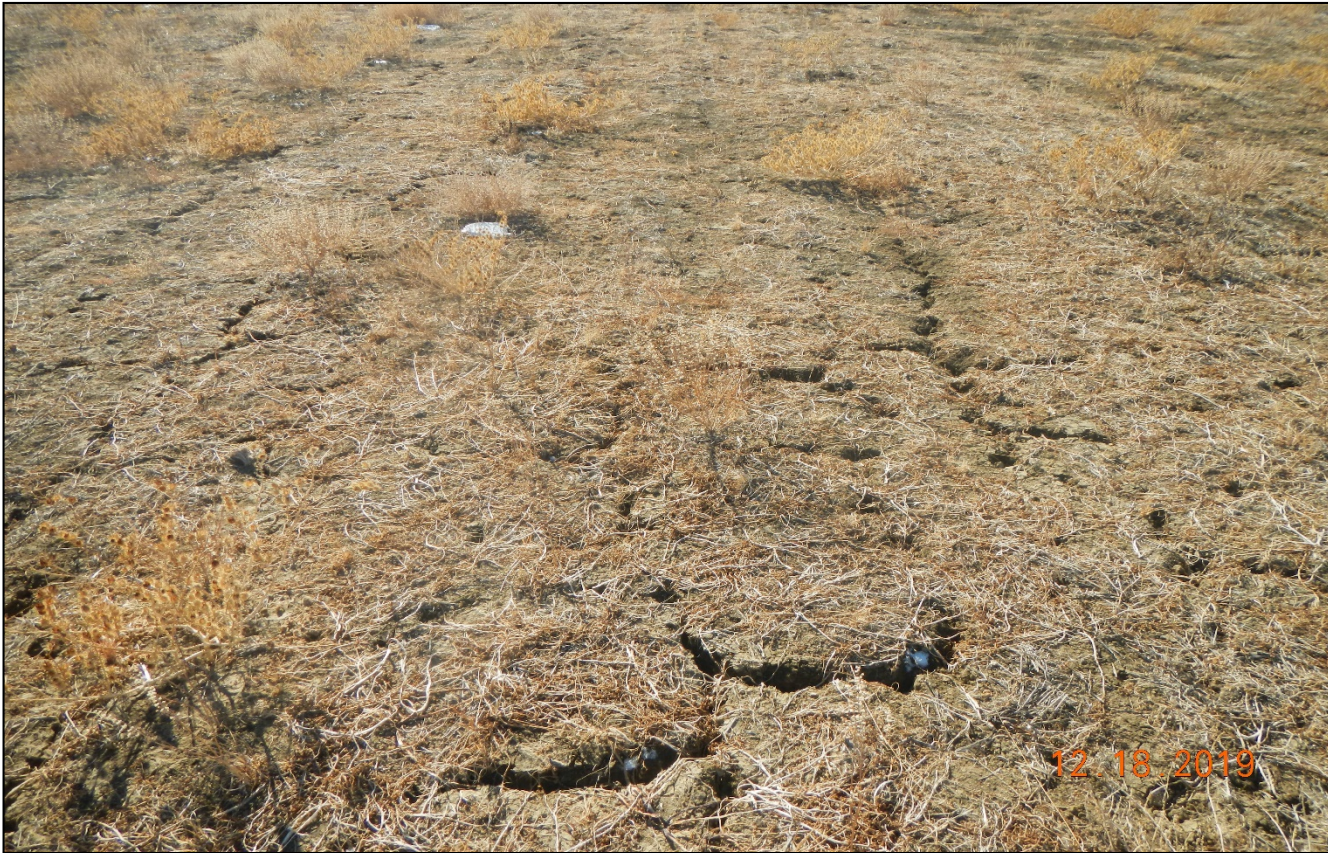
Photo 15. View of groundcover. There is cracks along the ground.