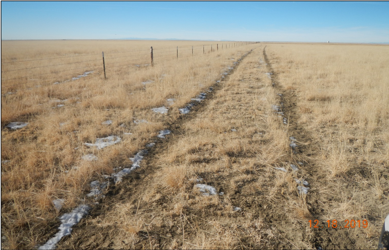
Photo 4. Facing west along the two track access road.