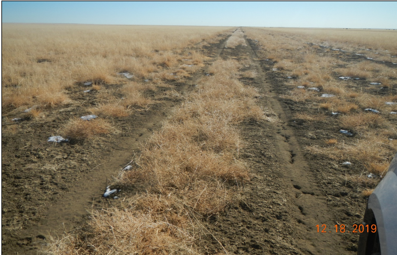
Photo 5. Facing southeast along the two track road.