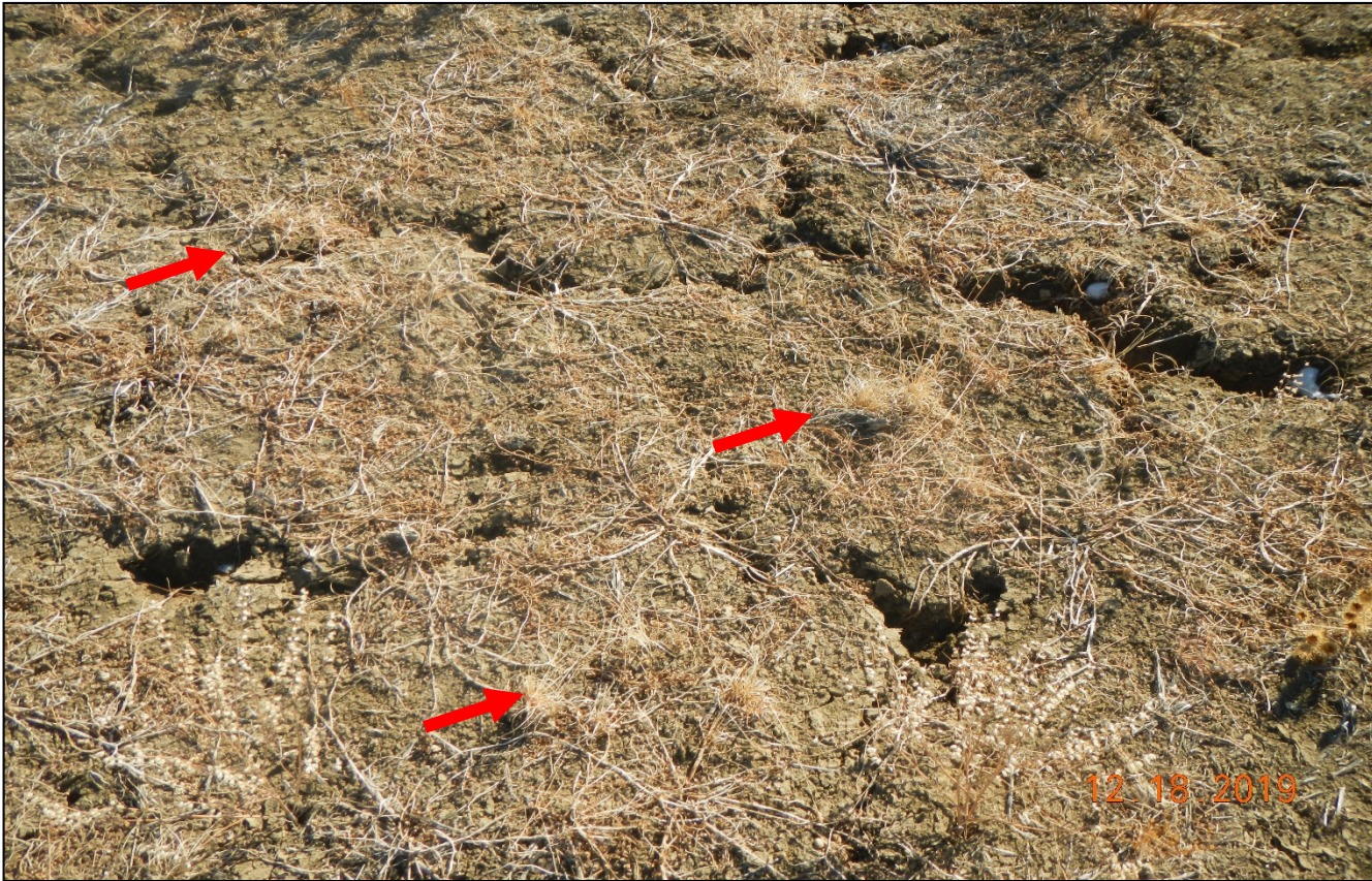
Photo 16. There is some vegetation establishing in areas. Vegetation noticed was Sideoats grama, Blue grama, and Sand dropseed.