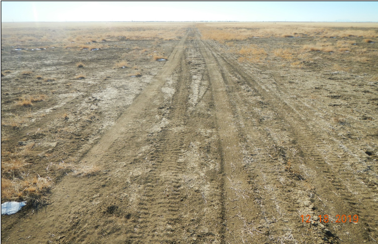
Photo 8. Facing southwest along the reclaimed portion of the road. It appears vehicles have been driving at this area. Vegetation does not appear to be establishing.