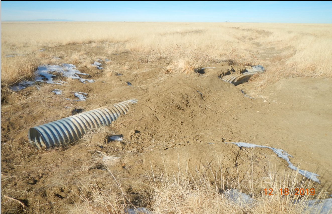
Photo 3. The culvert further west along the road has washed out. Erosion has occurred around the culvert.