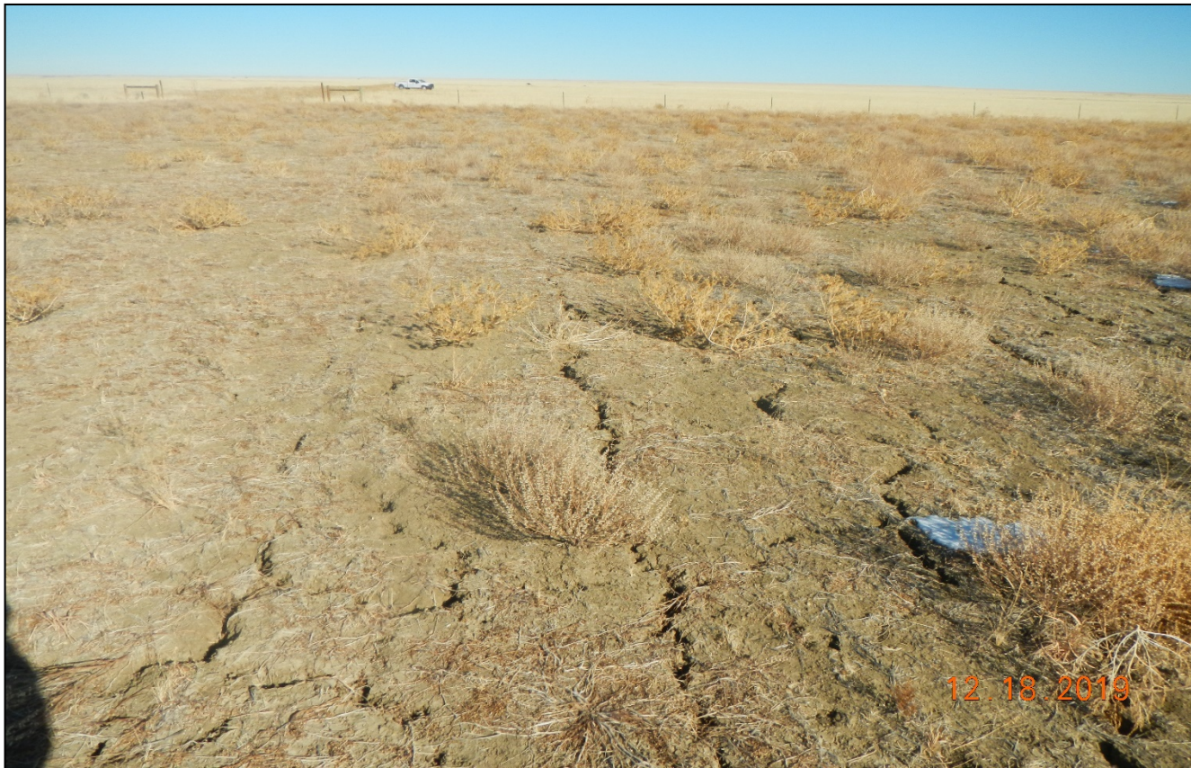
Photo 11. Facing northeast at the center of the location.