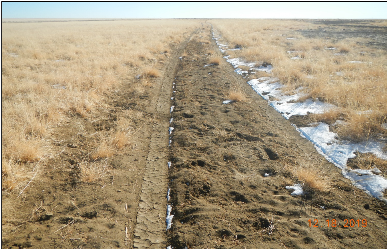
Photo 7. Facing southeast along the two track road.