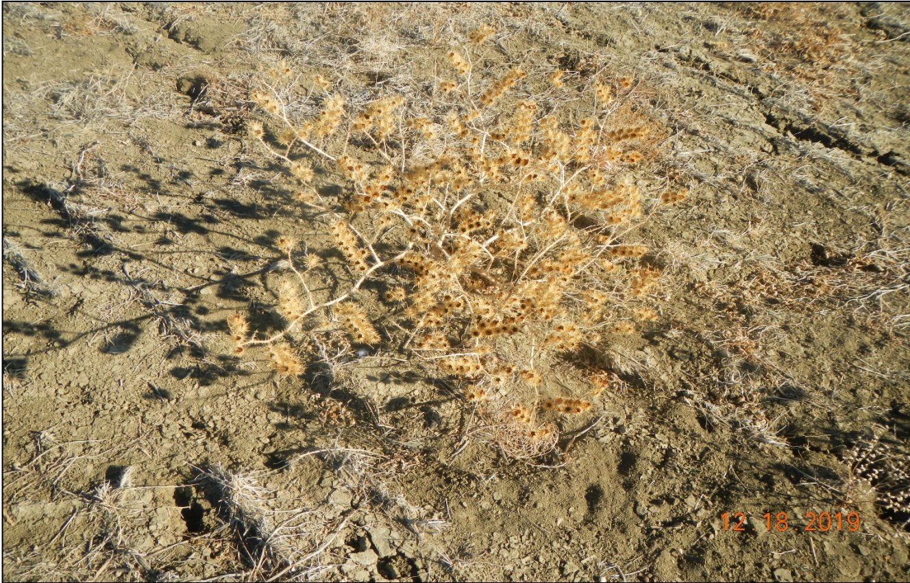
Photo 17. There is numerous Buffalobur throughout the location, which is a native annual specie.