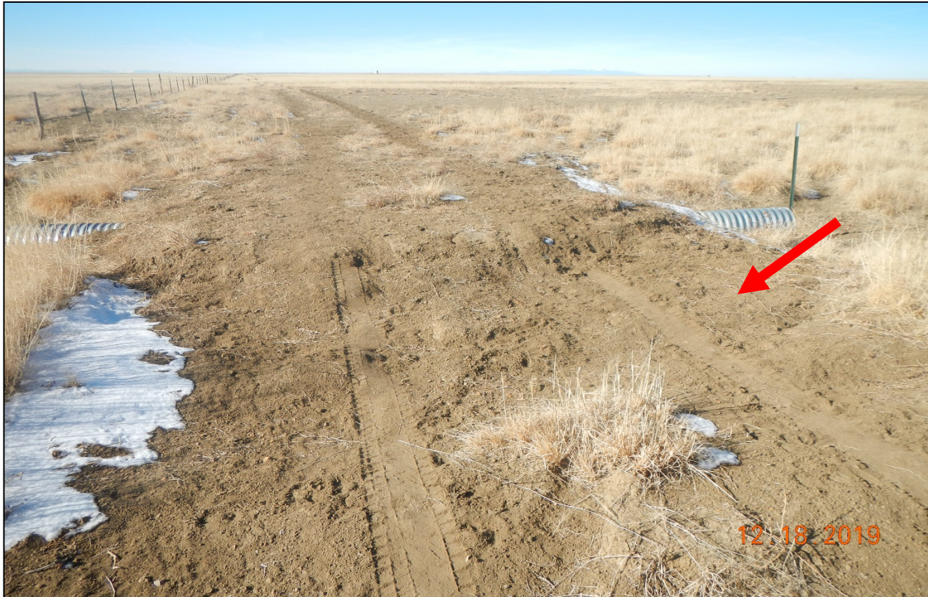
Photo 2. There are signs stormwater has flowed at the low point of the road crossing, shown in area of red arrow.