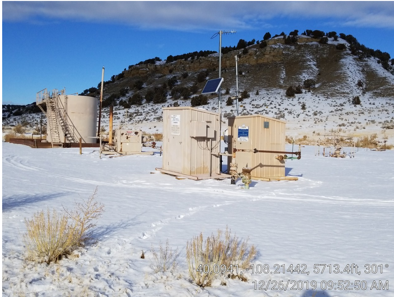
Photo 1. Location.