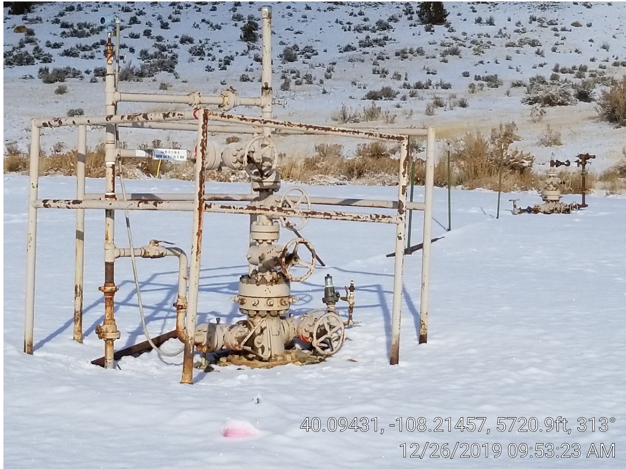
Photo 2. Well head.