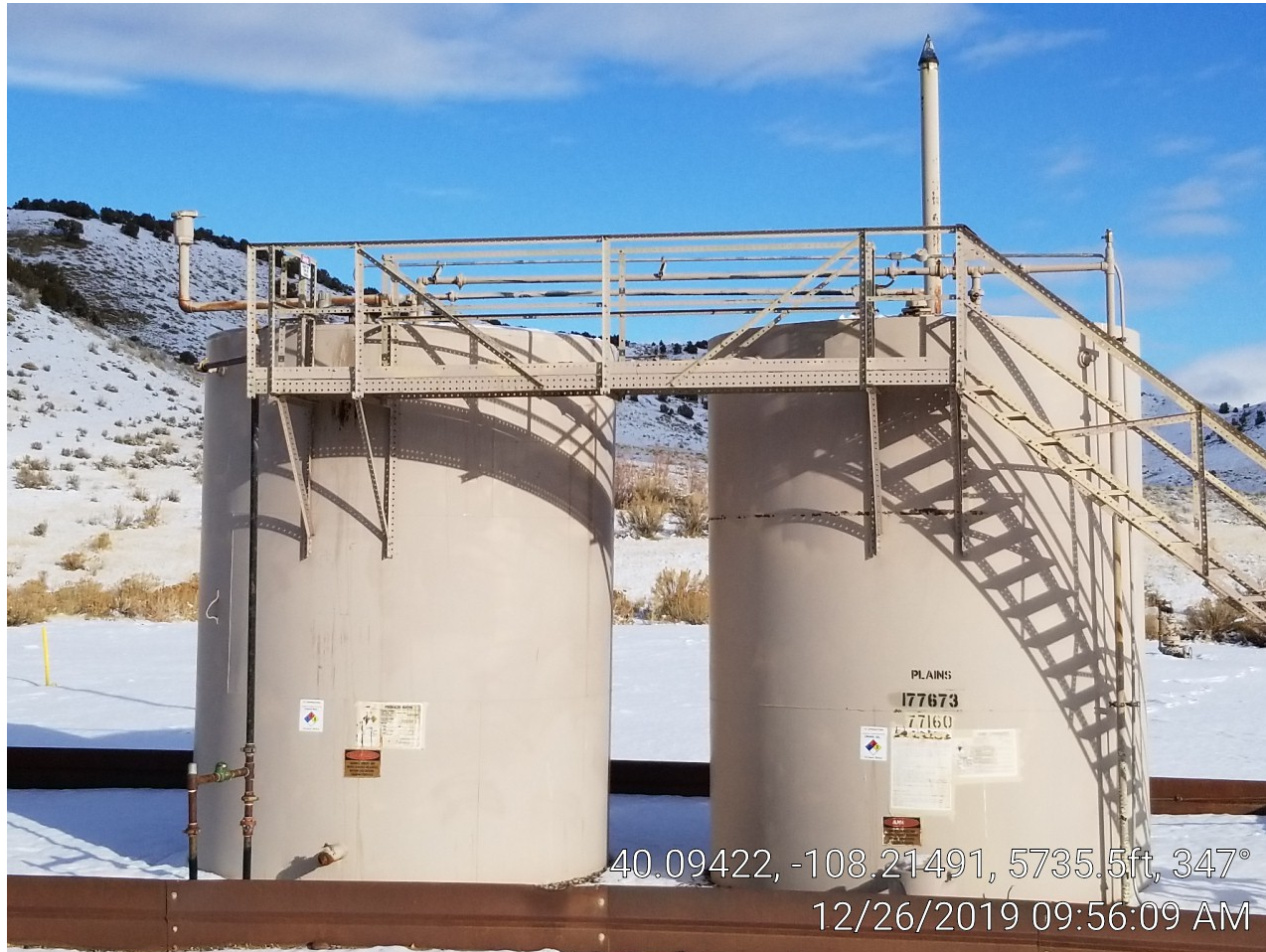
Photo 3. Tank battery.