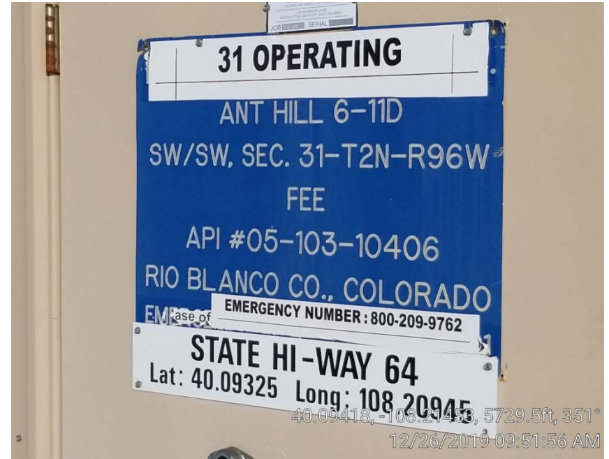
Photo 5. Battery sign.