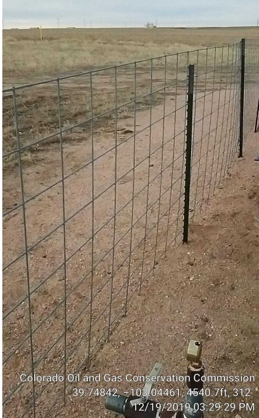
Flowline GPS at wellhead.

Colorado Oil and Gas Conservation Commission 39.74842, -103.04461, 4540.7ft, 312° 12/19/2019 03:29:29 PM