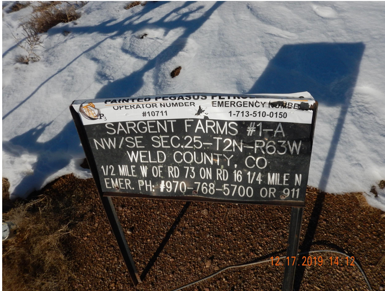
Photo 2. Close up photo taken of the Operator sign.

Operator sign needs to be updated to read: Sargent Farms "A" 2-A, SESE section 25