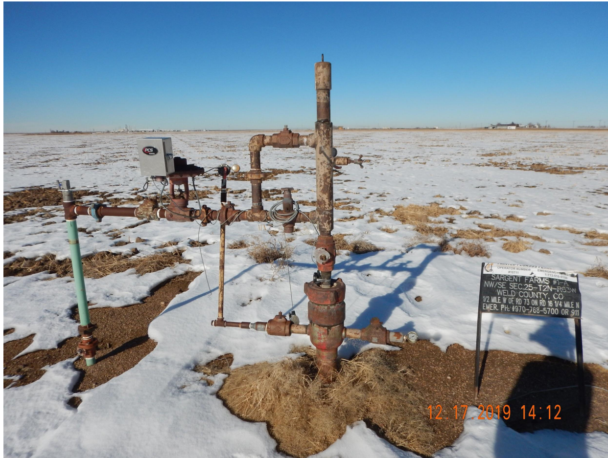
Photo 1. Photo taken from the well location, facing North. Photo illustrates the wellhead and Operator sign.

This well is currently located in the SESE section of 25, not NWSE.