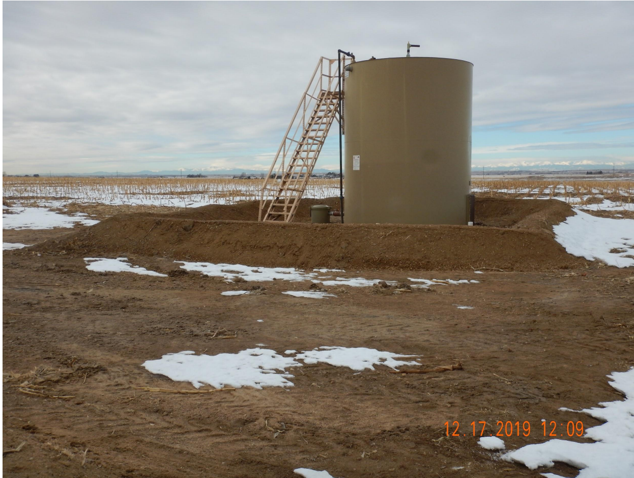
Photo 3. Photo taken from the northwestern location, facing West. See comments under Photo 1.