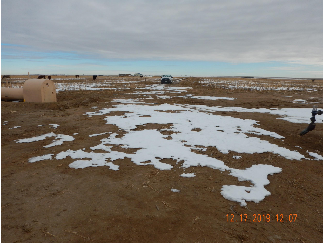
Photo 2. Photo taken from the central location, facing East. See comments under Photo 1.