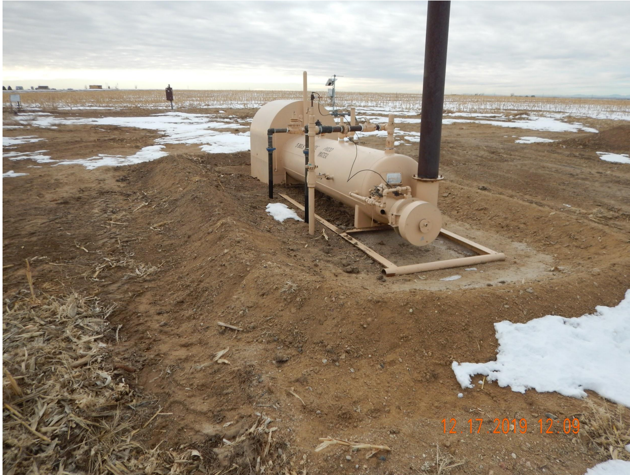
Photo 4. Photo taken from the northeastern location, facing South. See comments under Photo 1.