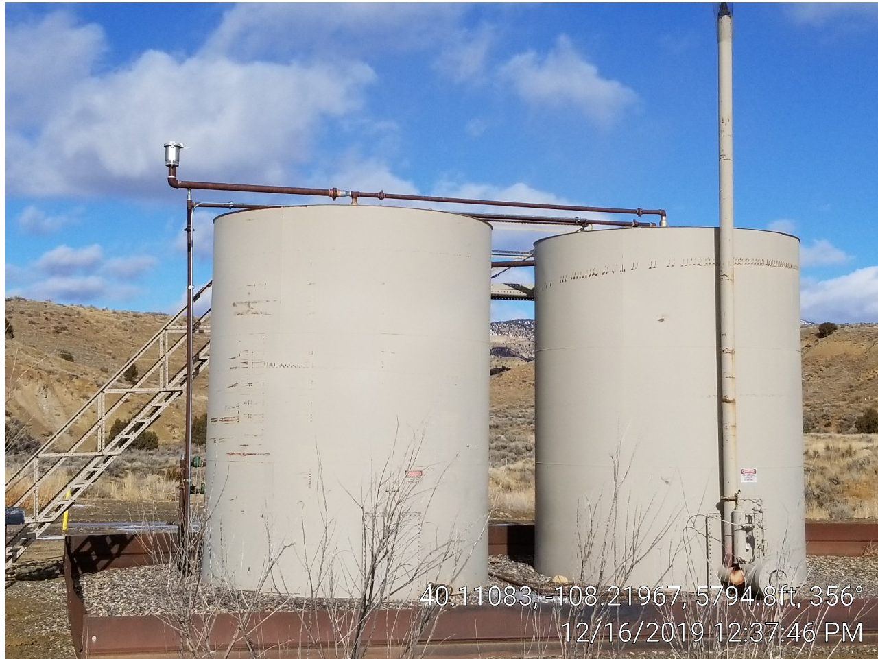
Photo 4. Tank battery.