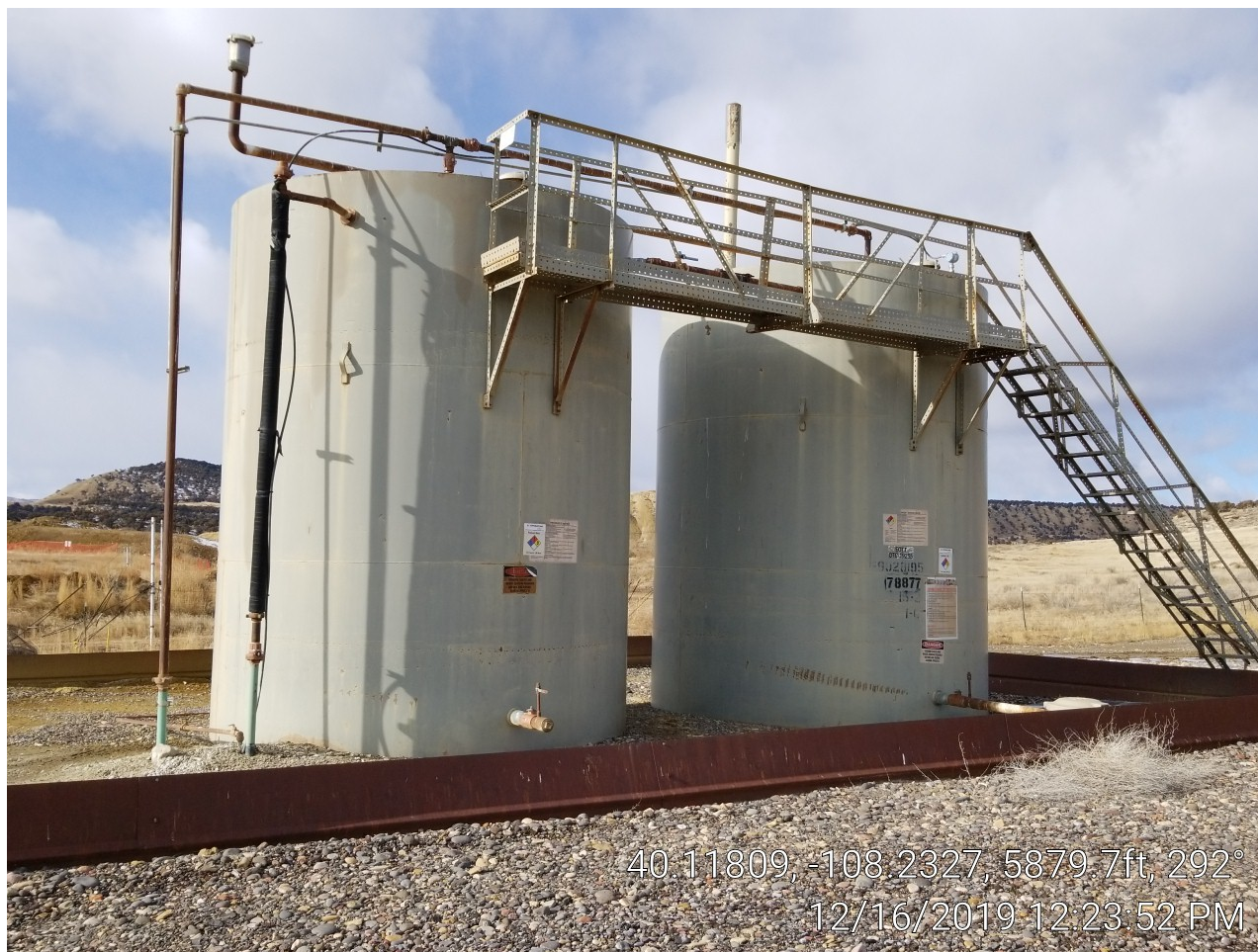
Photo 3. Tank battery.

WRD County 25-11 API: 05-103-10123 Inspection: 679706611