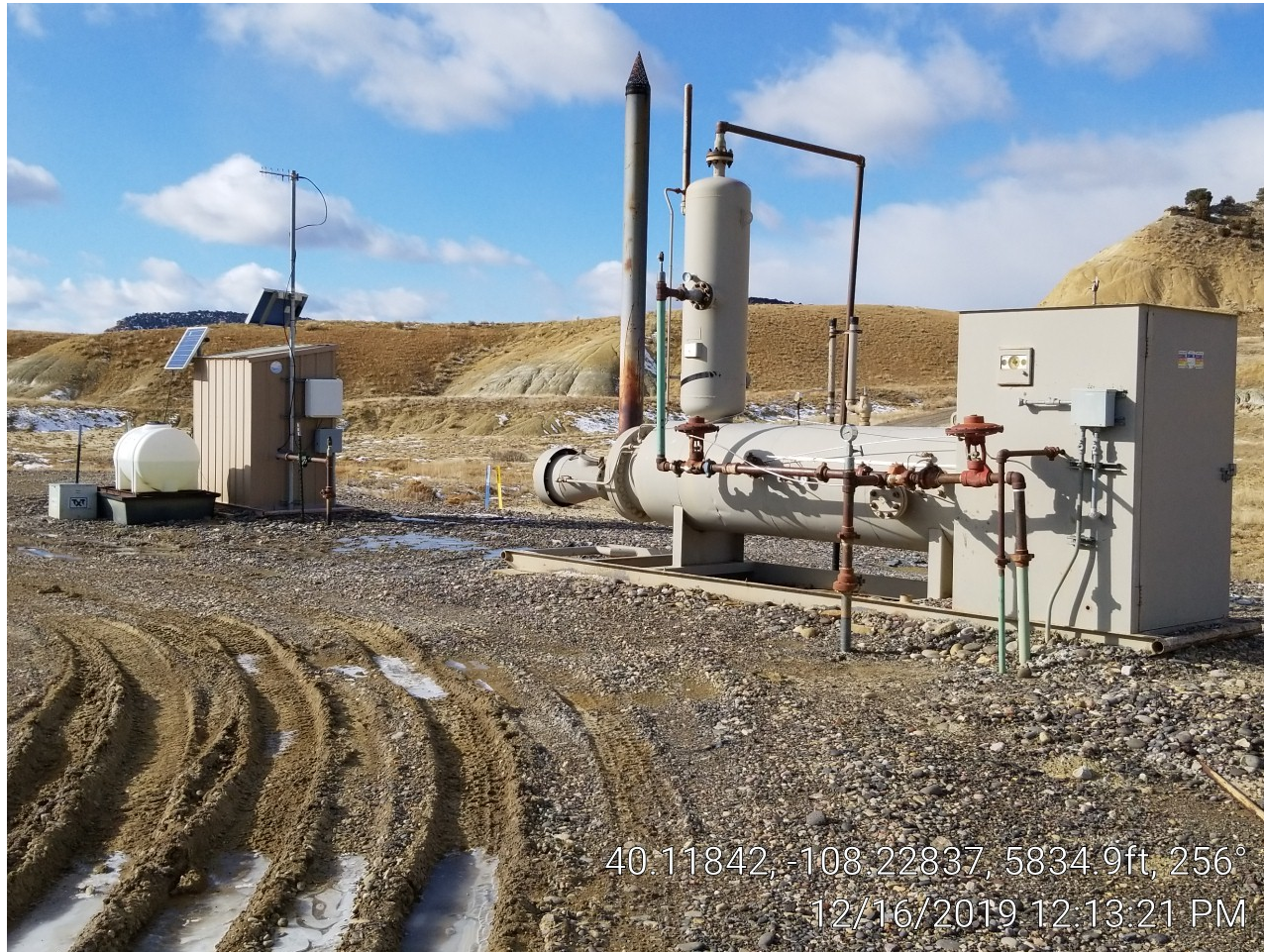
Photo 3. Meter building & separator.