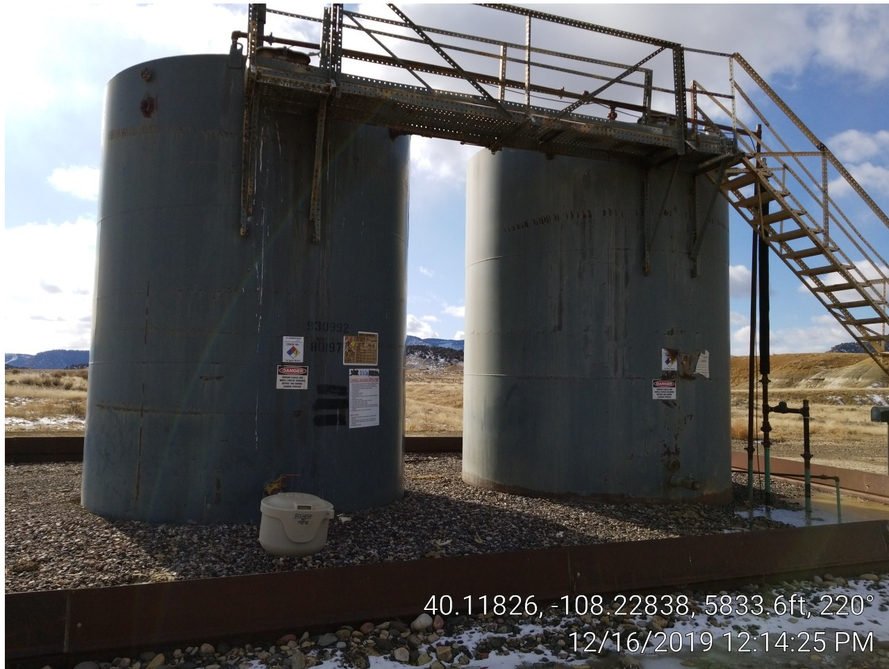
Photo 4. Tank battery.