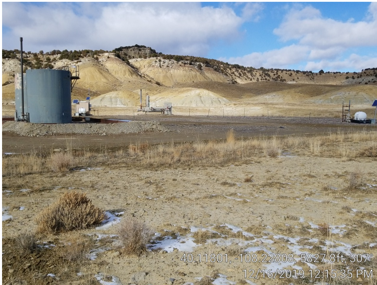
Photo 1. Location.