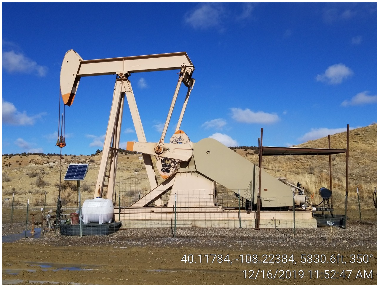
Photo 2. Pump jack.

Federal B-25-2-97-N API: 05-103-09487 Inspection: 679706604