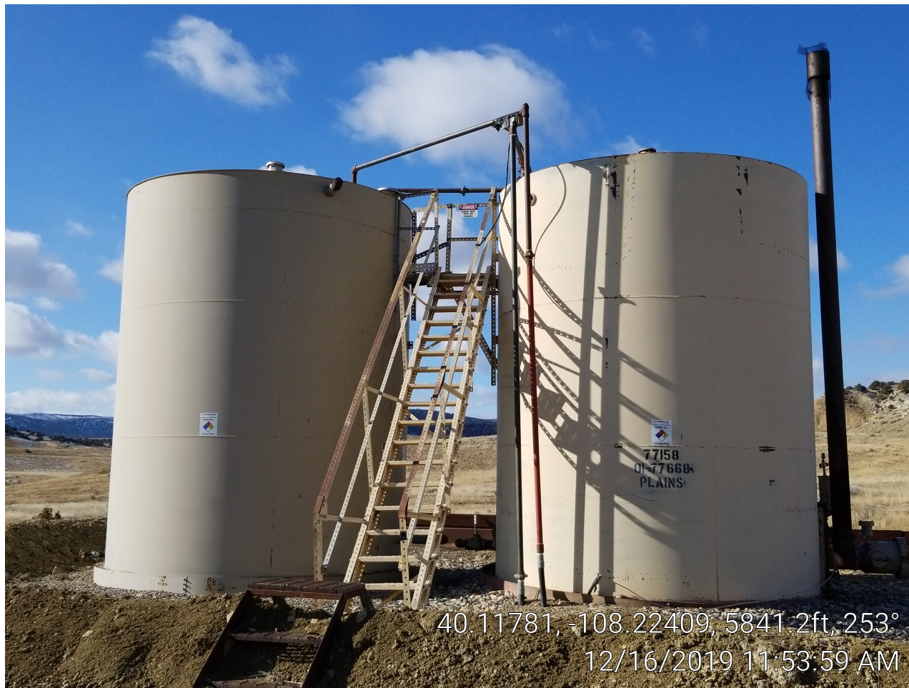
Photo 5. Tank battery.

Federal B-25-2-97-N API: 05-103-09487 Inspection: 679706604