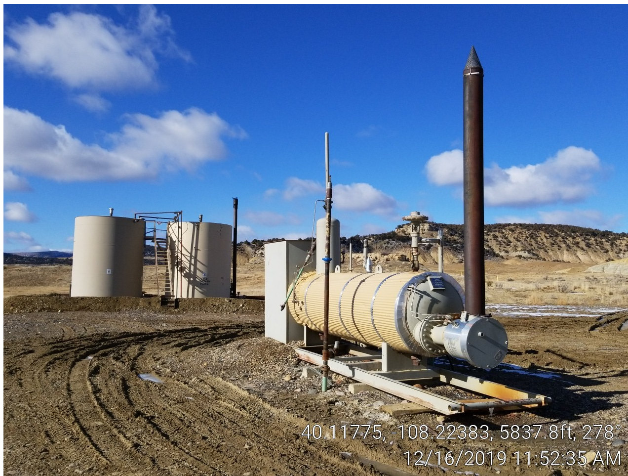
Photo 3. Separator.

Federal B-25-2-97-N API: 05-103-09487 Inspection: 679706604