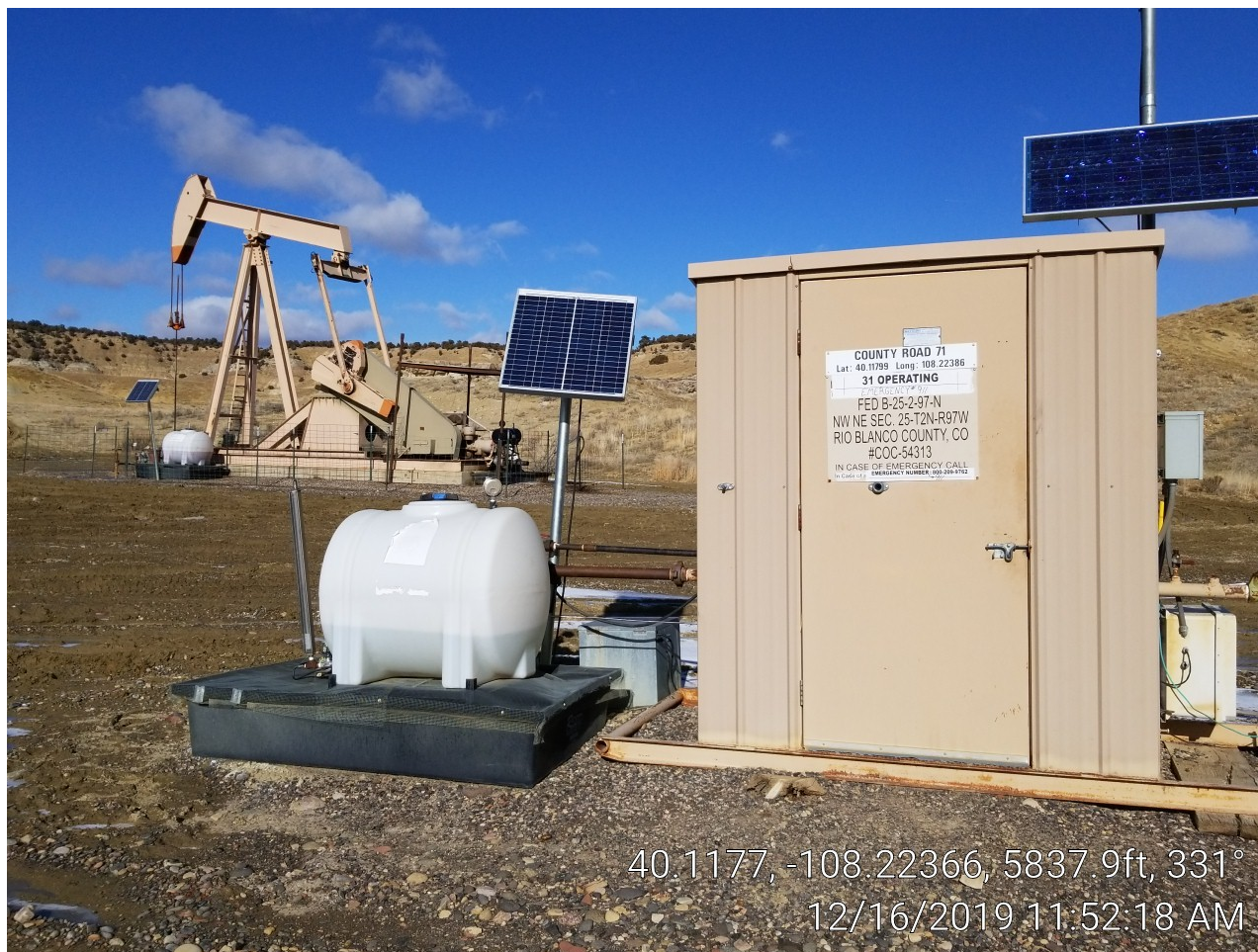
Photo 4. Meter building.

Federal B-25-2-97-N API: 05-103-09487 Inspection: 679706604