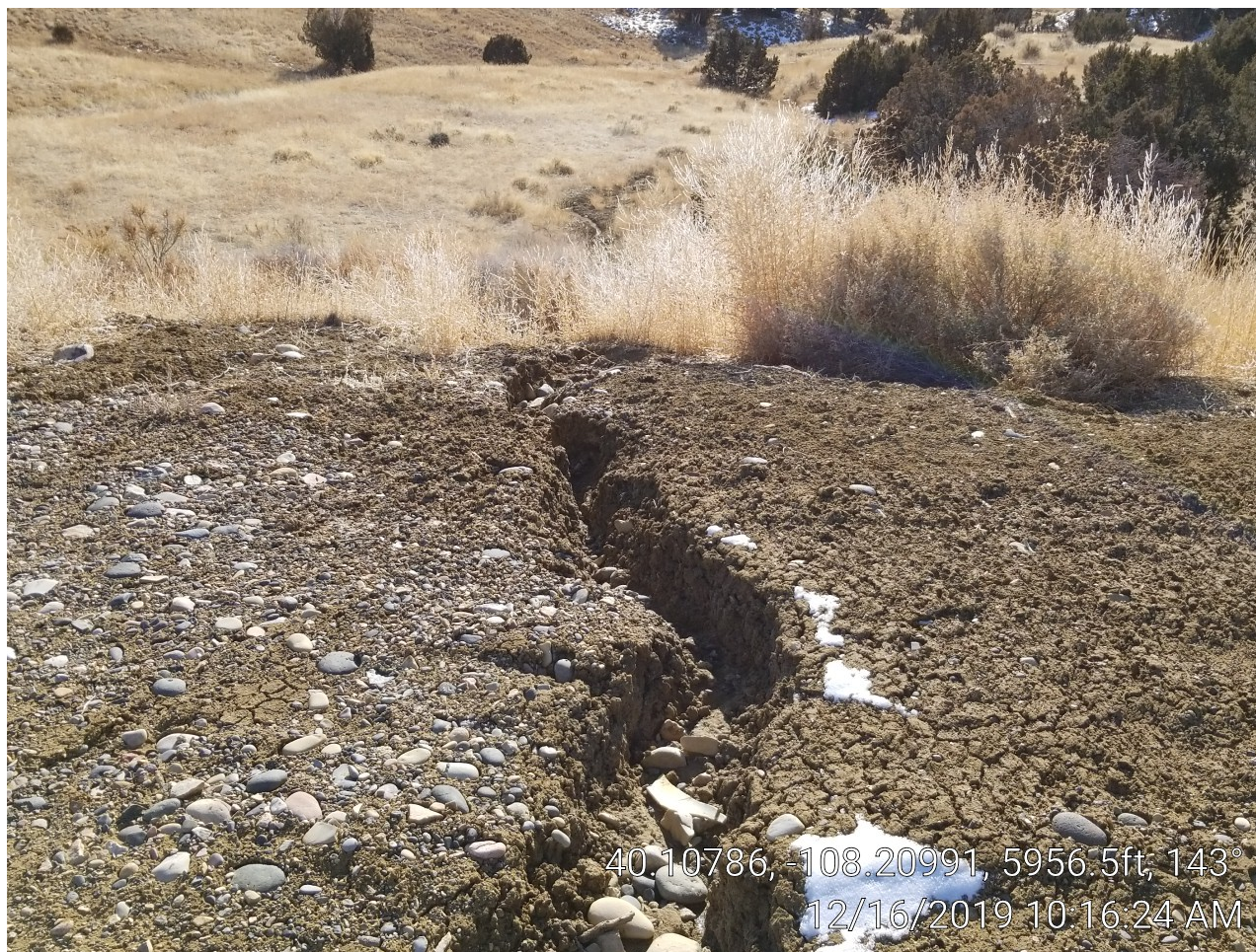
Photo 3. Stormwater channel at edge of location.

WRD Federal 30-42 API: 05-103-09919 Inspection: 679706590