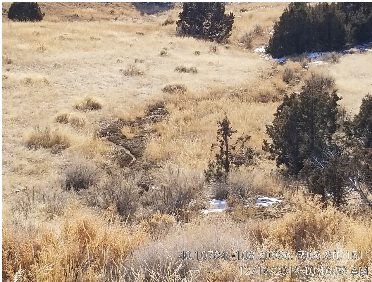
Photo 4. Stormwater channel continues off location.

WRD Federal 30-42 API: 05-103-09919 Inspection: 679706590