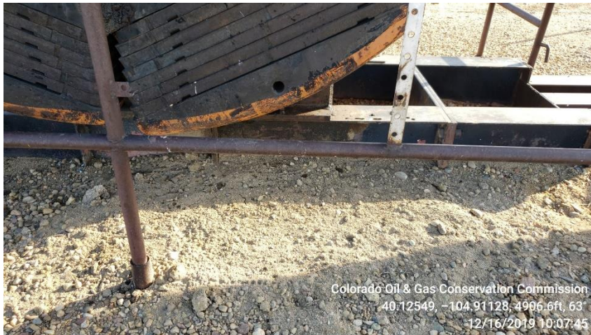
Photo 5 Stained soil at PU base appears to have been removed