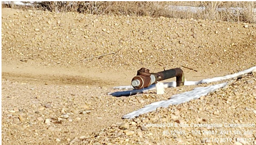
Photo 7 flow line is now marked & tagged