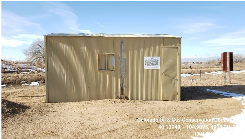
Photo 11 Compressor house