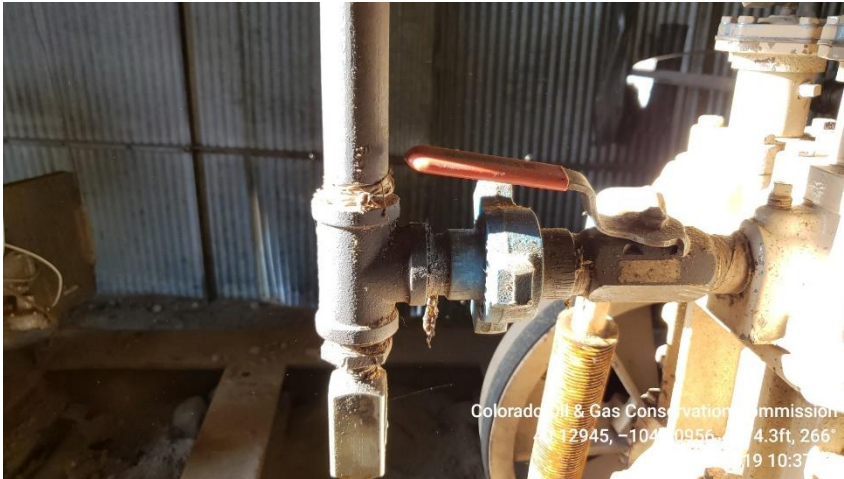
Photo 13 hammer union appears to have been tightened