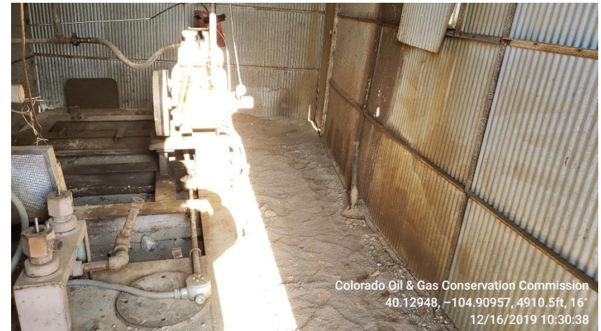
Photo 12 stained soil appears to have been removed from comp. house