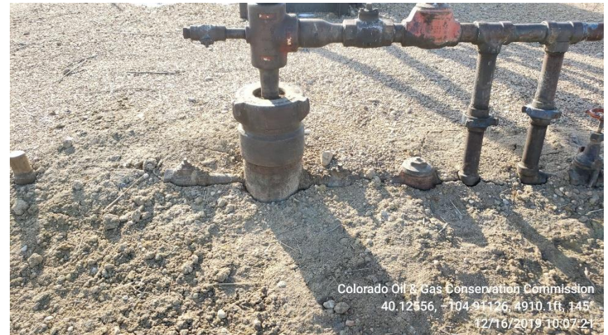
Photo 4 Stained soil around WH appears to have been removed