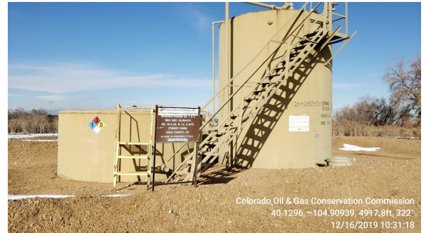
Photo 6 TB sign