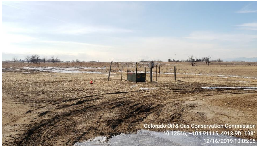
Photo 3 Weeds on location appear to have been cut and removed