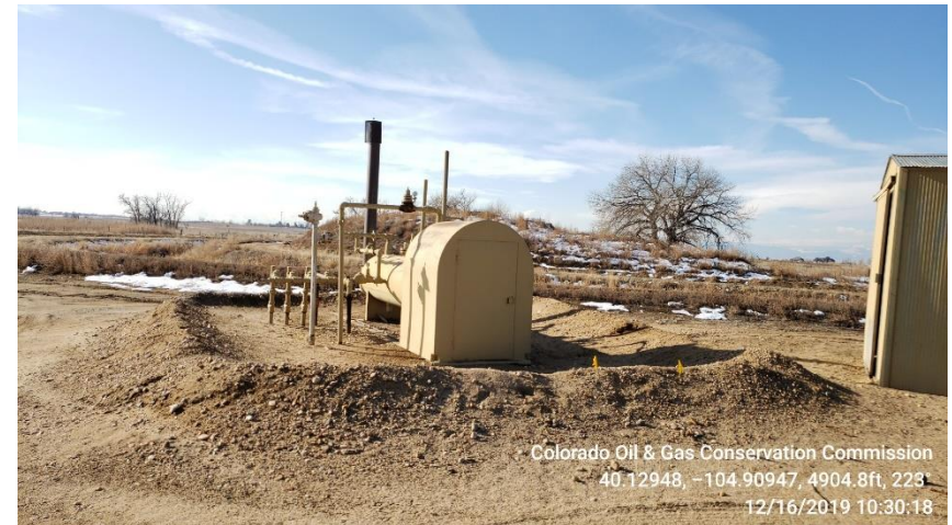
Photo 8 flow lines are now marked & tagged