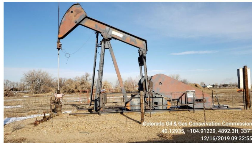
Photo 2 PU