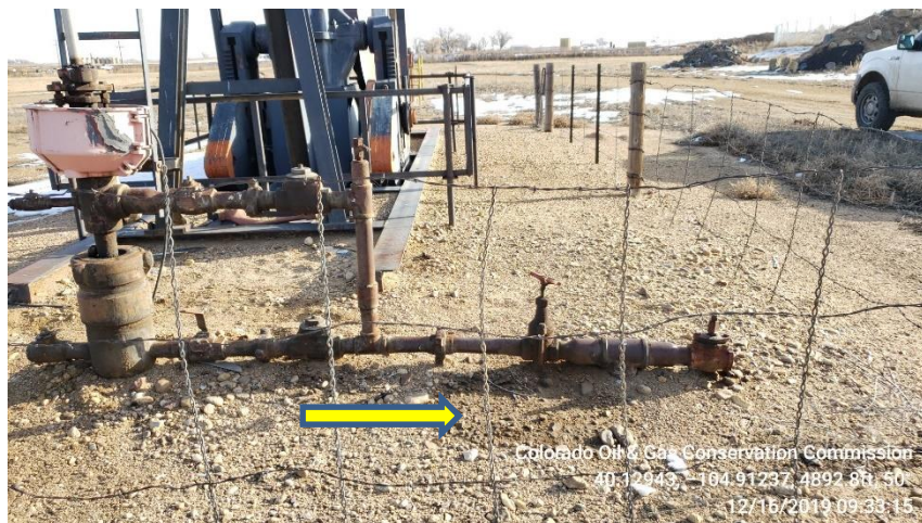
Photo 3 WH, Stained soil by valve on flow line