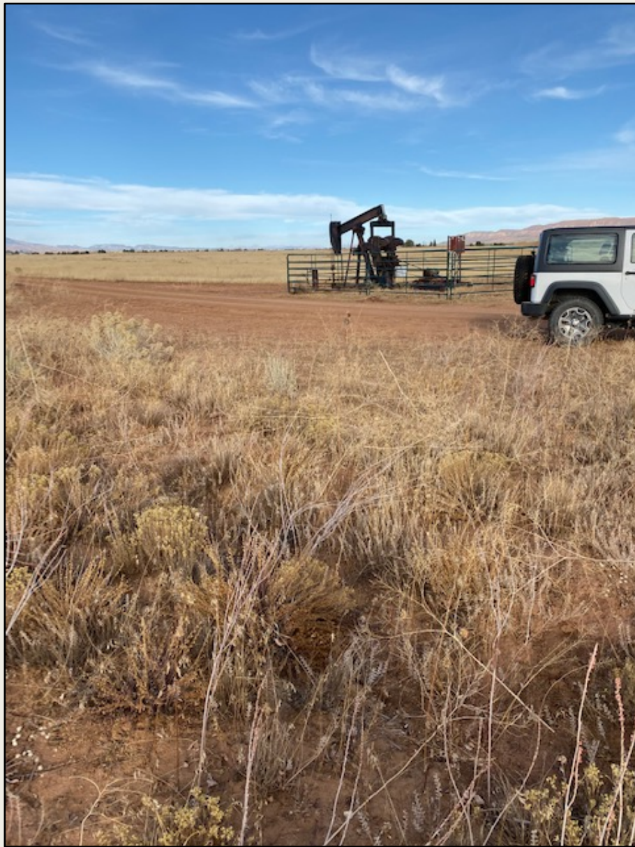
Photo 1. View of the project area from the southwestern corner facing center.