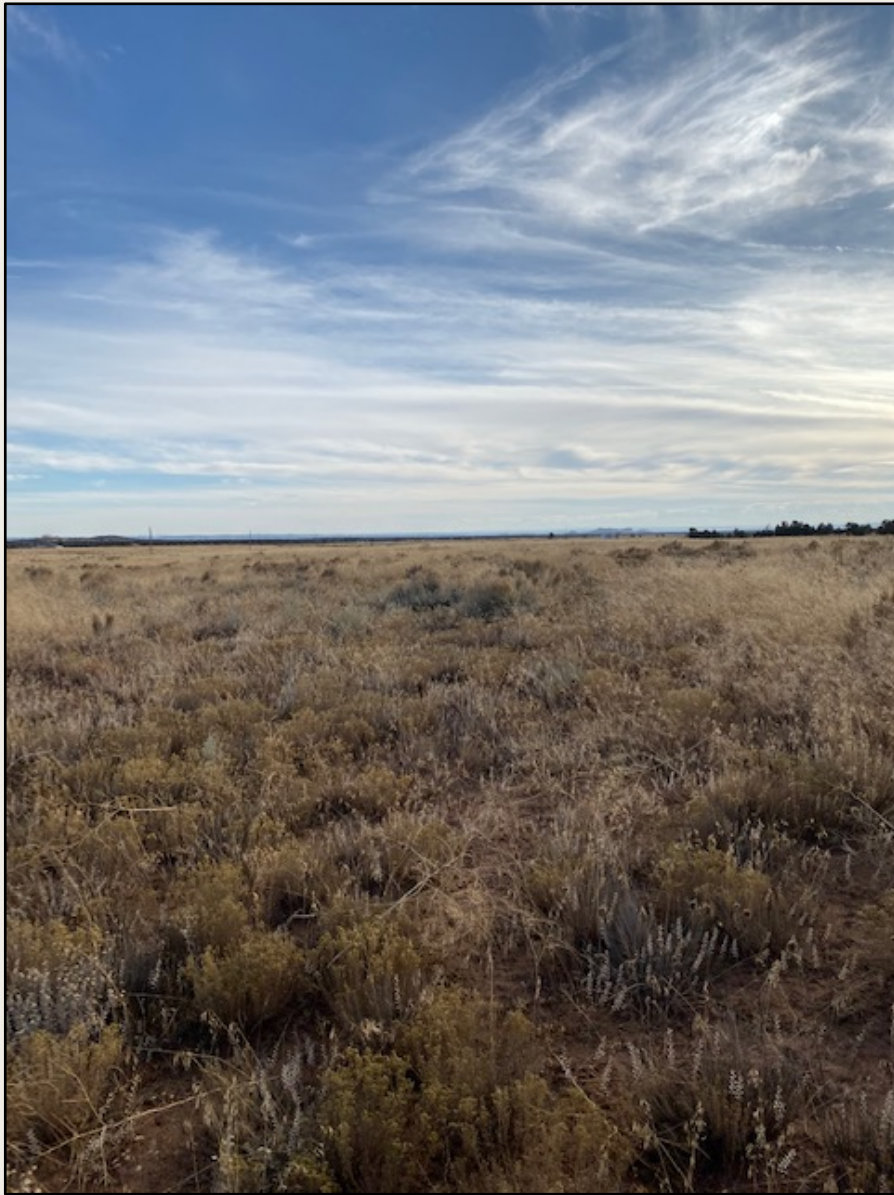
Photo 3. View of reference area, largely comprised of sagebrush, mixed wheatgrasses, and snakeweed.