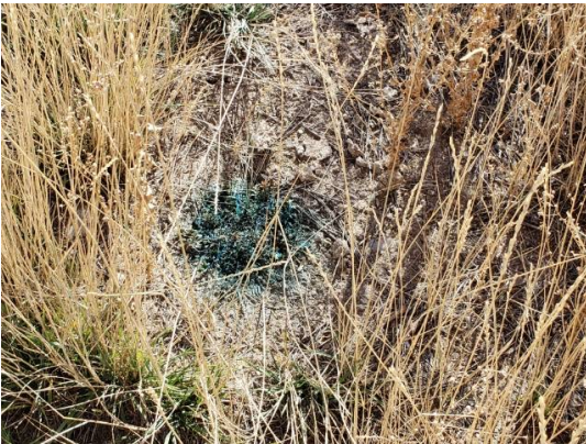
Completed work description Completed work description of corrective action 4 Additional photos

Sprayed musk thistle populations. Sprayed musk thistle populations.