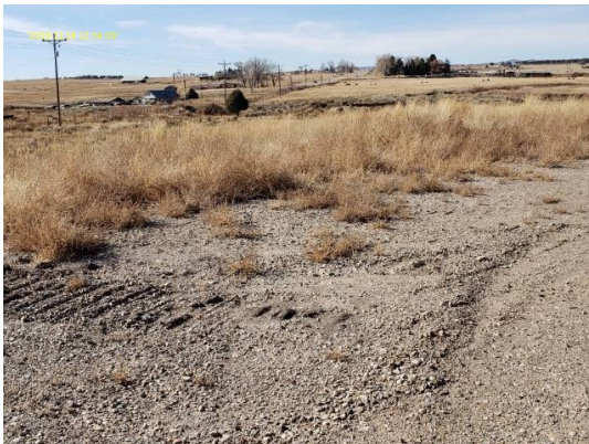
Photo of first corrective action completed

Completed work description Corrective Action 1