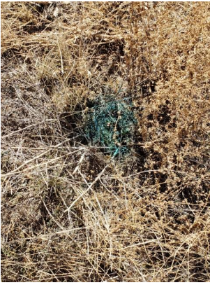
Completed work description of corrective action 3 Photo of fourth corrective action completed