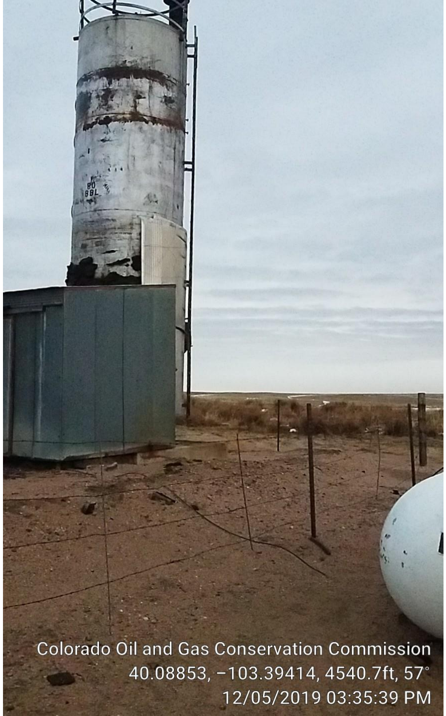
Colorado Oil and Gas Conservation Commission 40.08853, -103.39414, 4540.7ft, 57° 12/05/2019 03:35:39 PM