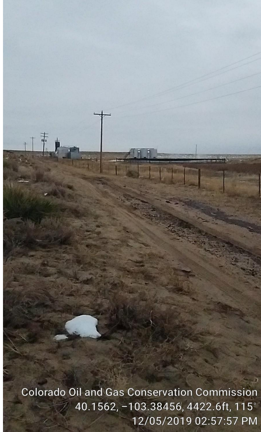
Tank battery from well

Colorado Oil and Gas Conservation Commission 40.1562, -103.38456, 4422.6ft, 115° 12/05/2019 02:57:57 PM