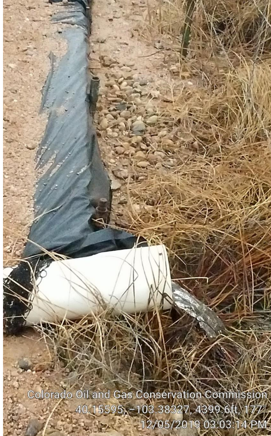
Lined pit discharge

Colorado Oil and Gas Conservation Commission 40.15595, -103.38327, 4399.6ft, 177° 12/05/2019 03:03:14 PM