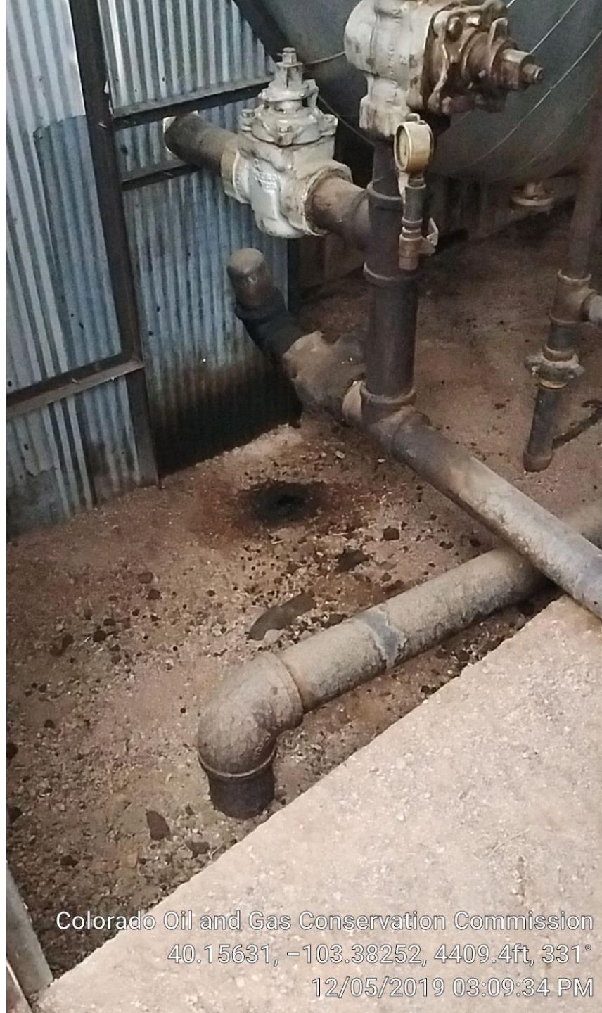
Valve leak in treater shed