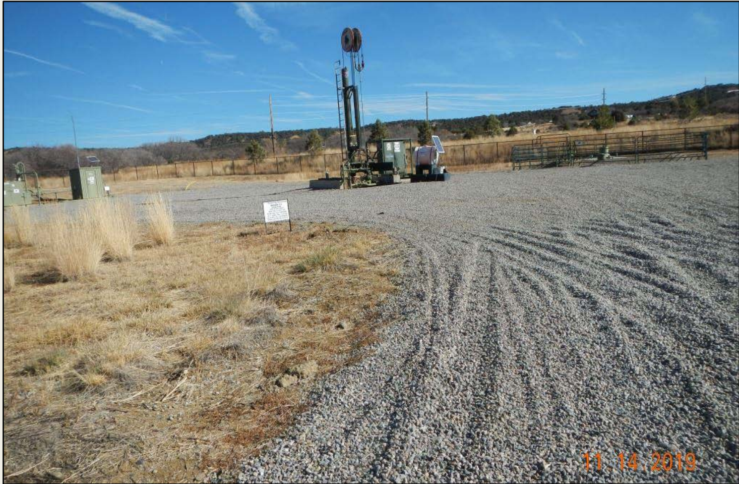
Photo 1. View of the project area from the well pad entrance facing center.