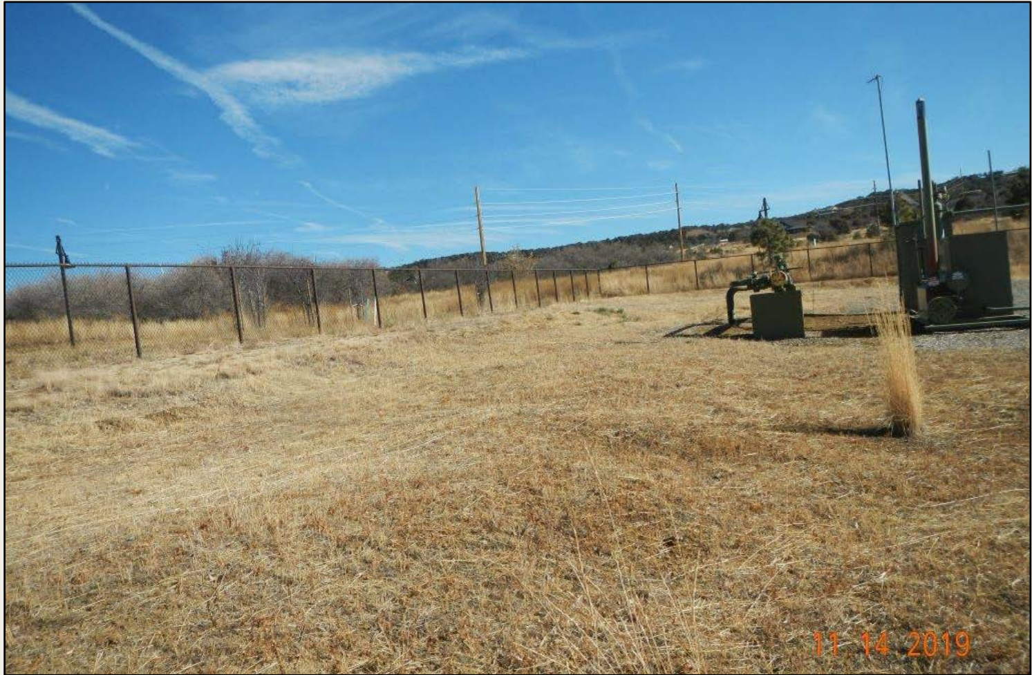
Photo 3. View of the northern project area from the northwestern corner facing eastward. Revegetation is progressing as described above.