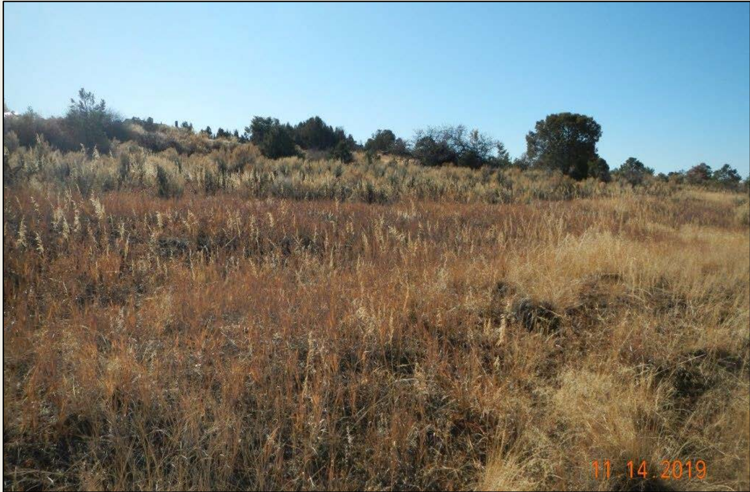
Photo 4. View of reference area, comprised of sagebrush shrubland, with grasses planted in openings.