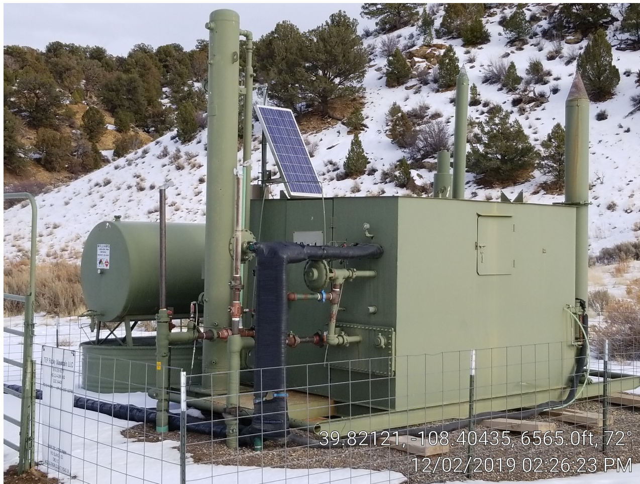
Photo 2. Separator.

RG 12-4-398 API: 05-103-10758 Inspection: 679706383