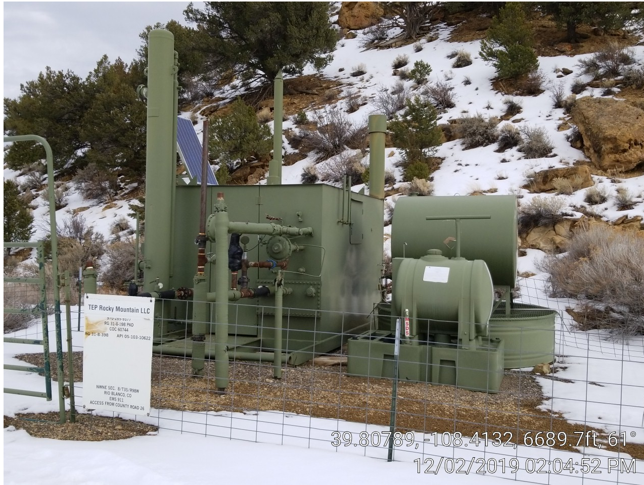
Photo 3. Separator.

RG 31-8-38 API: 05-103-10622 Inspection: 679706381