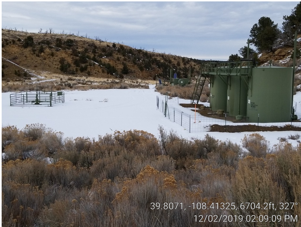
Photo 1. Location.

RG 31-8-38 API: 05-103-10622 Inspection: 679706381