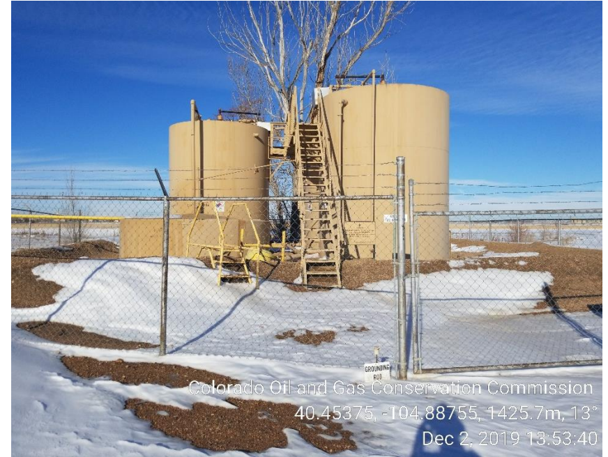
Photo 10: Tank Battery; appears water hose is removed (snow covering area)