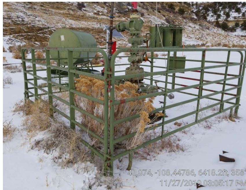
Photo 5. Vegetation next to well head.