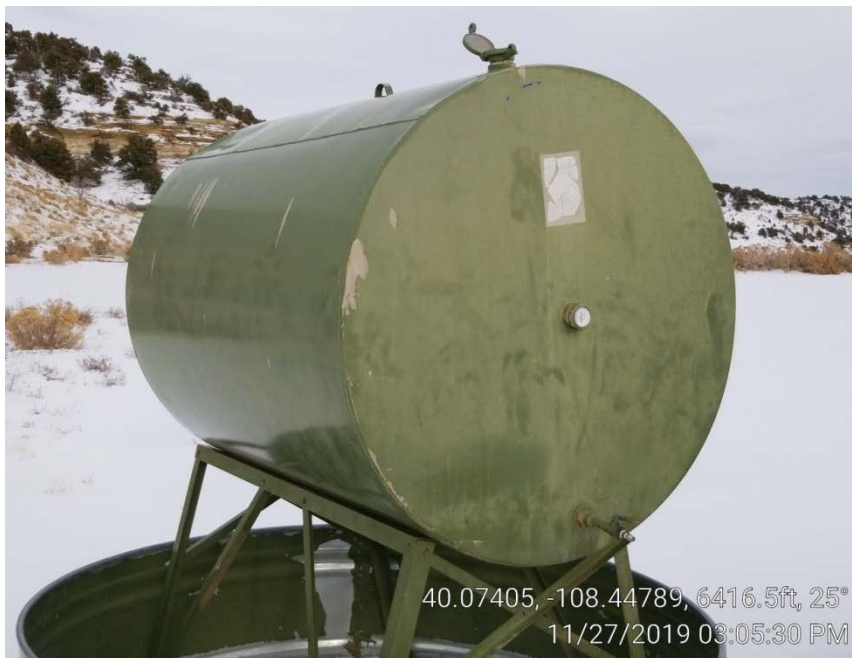
Photo 4. Container next to well head.