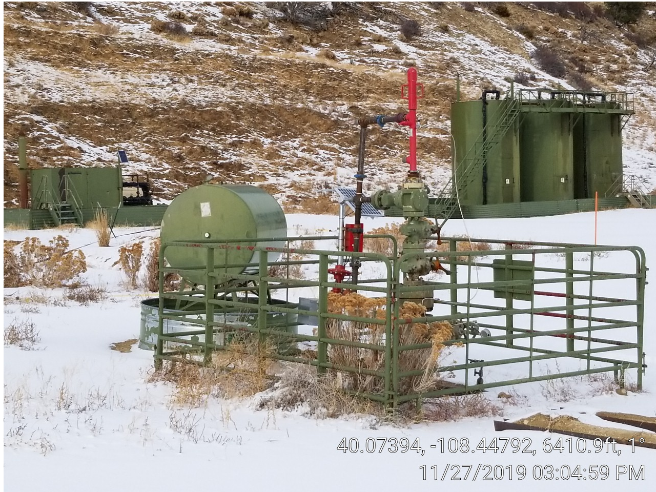
Photo 1. Location.