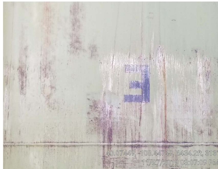
Photo 3. Tank 3.