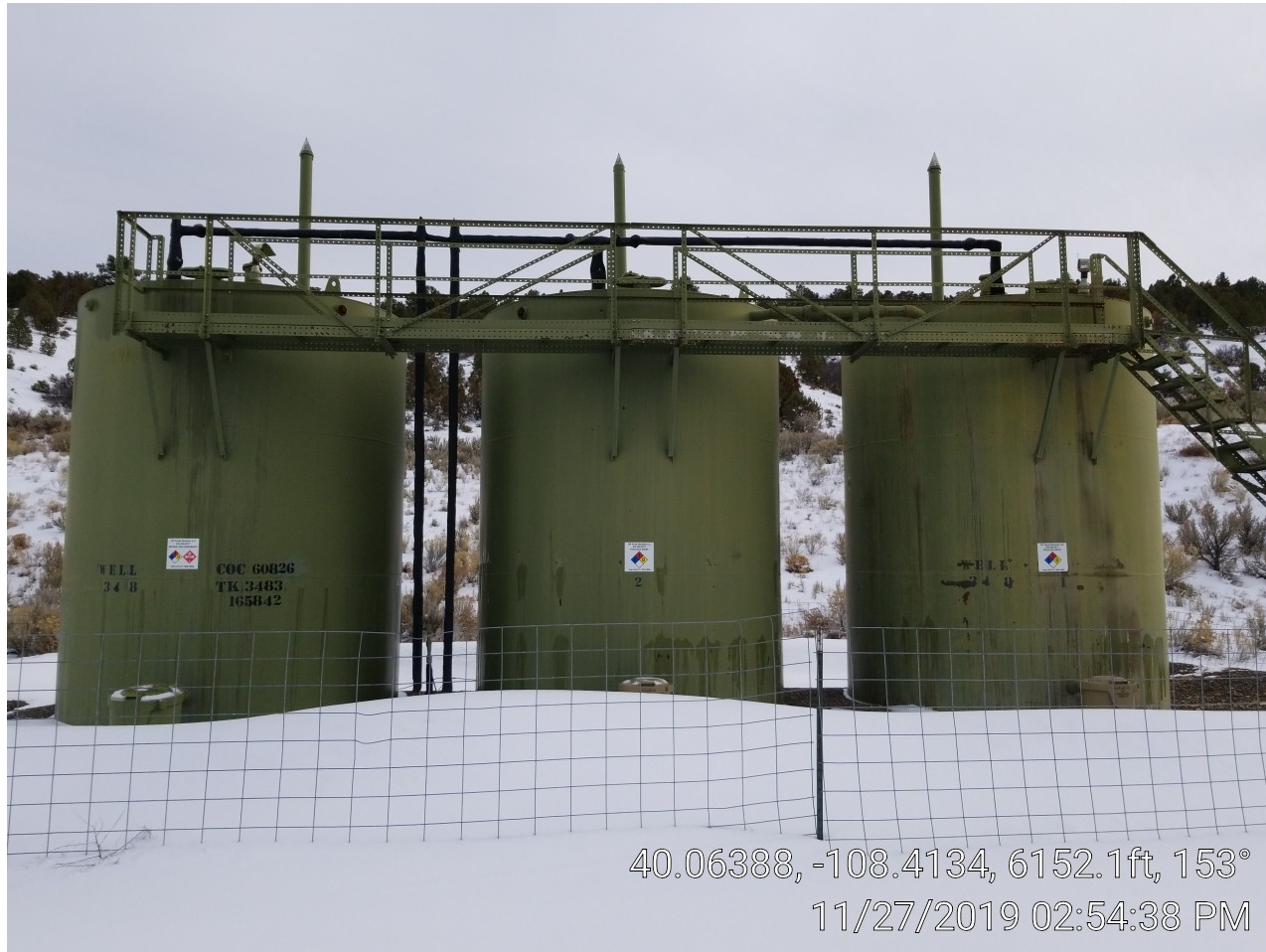
Photo 3. Tank battery.

BCU 34-8-198 API: 05-103-10903 Inspection: 679706373