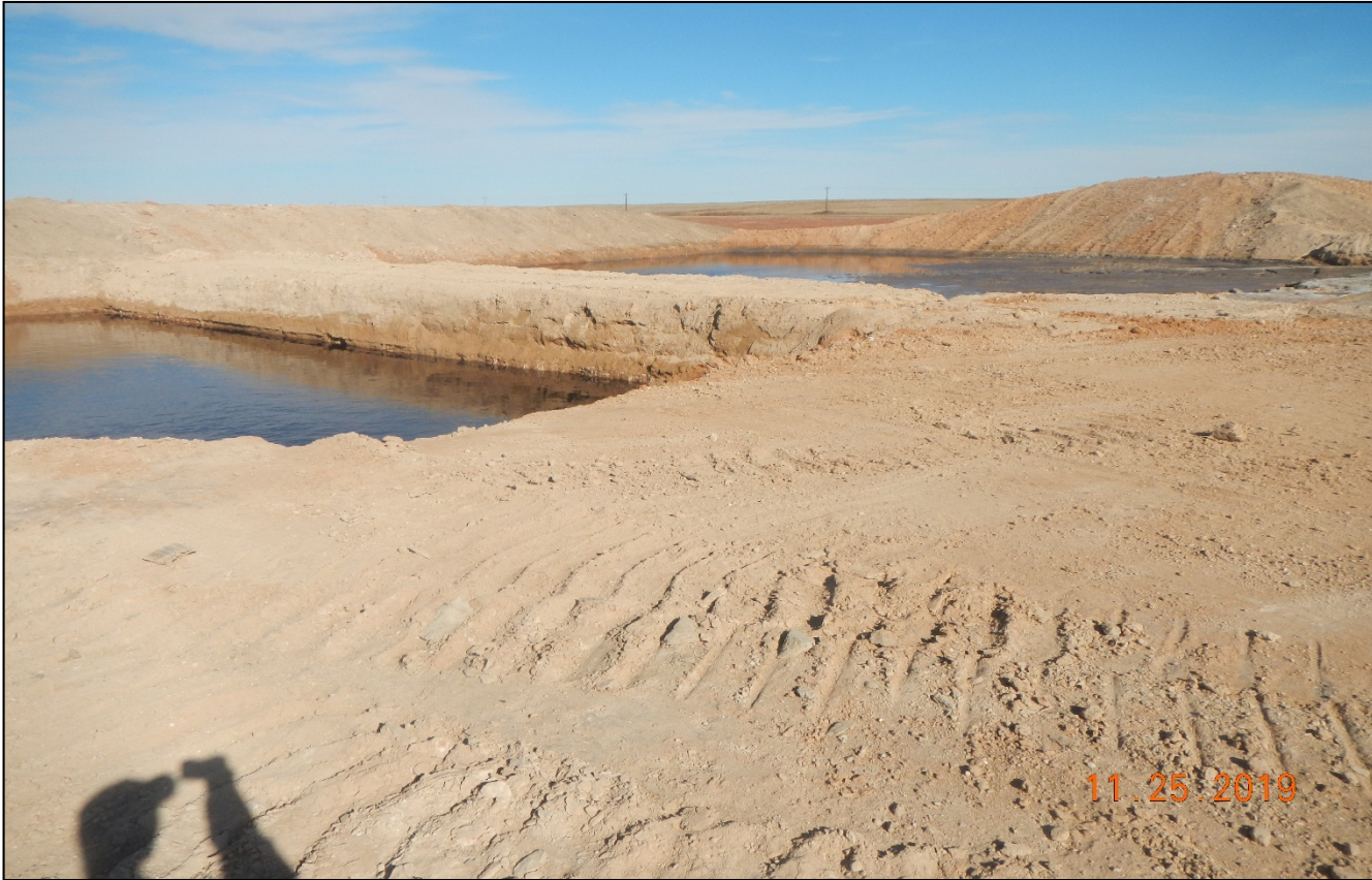
Photo 7. Facing northeast toward the drilling pits. Drilling material and fluid are present in the pits.