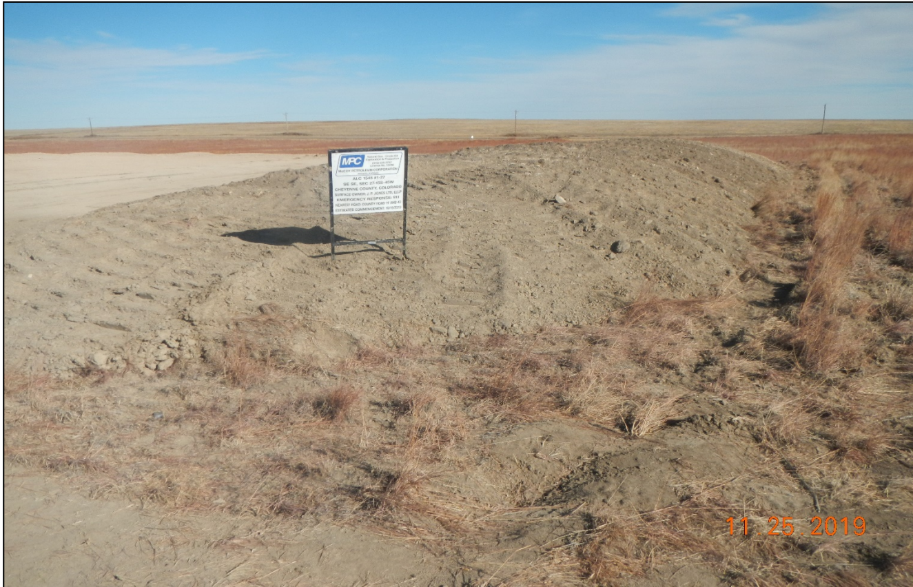
Photo 1. Well sign is installed at the entrance of the location. Topsoil is salvaged and stored at south side of the location.