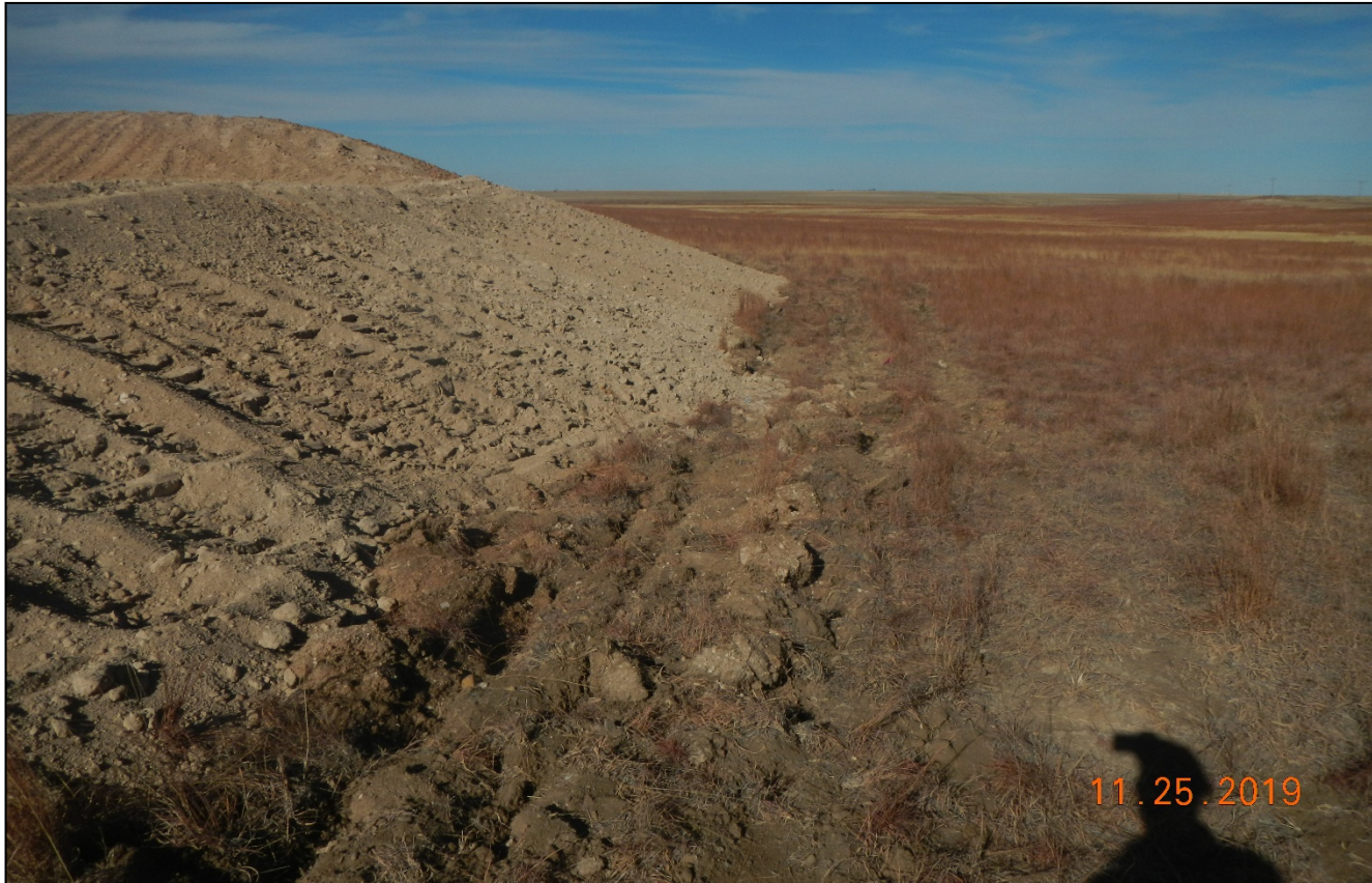
Photo 4. Facing north along the east side of the location. The side of the pad was tracked in however, soils are loose and susceptible to erosion. Surface roughening was performed around the perimeter but is inadequate to control erosion.