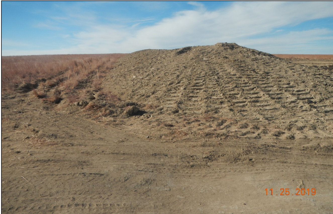
Photo 2. Topsoil is salvaged and stored at the south side of the location. Topsoil is tracked for temporary stabilization. Topsoil will need to be seeded and stabilized if reclamation is not performed soon.