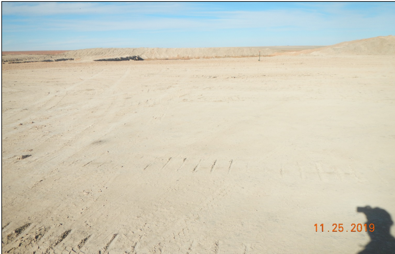
Photo 3. Facing north toward the location.