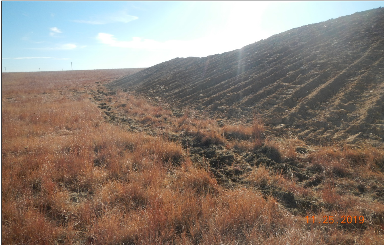
Photo 5. Facing south at the east side of the location. The side of the pad was tracked in however, soils are loose and susceptible to erosion. Surface roughening was performed around the perimeter but is inadequate to control erosion.