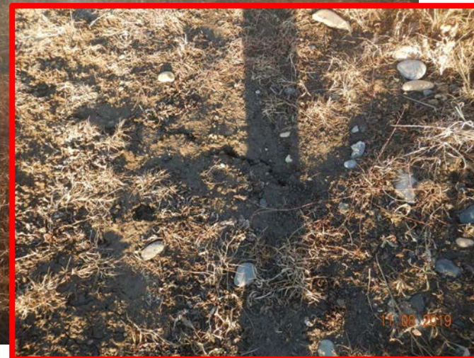
Photo#6: Storage area, view to West; inserts of ground conditions.