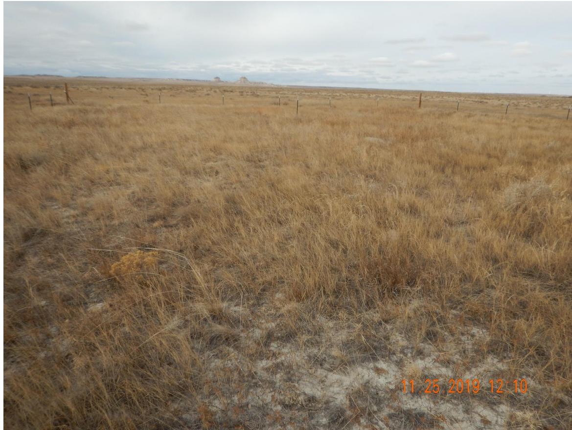
Photo 1. Photo taken from the eastern well location, facing West. Photo illustrates Operator has performed Final Reclamation activities with the evidence of desirable vegetation establishment. Well location appears reflective of reference area vegetative levels; however, the access road and tank battery location will remain in process. Operator will need to remove the perimeter fence.