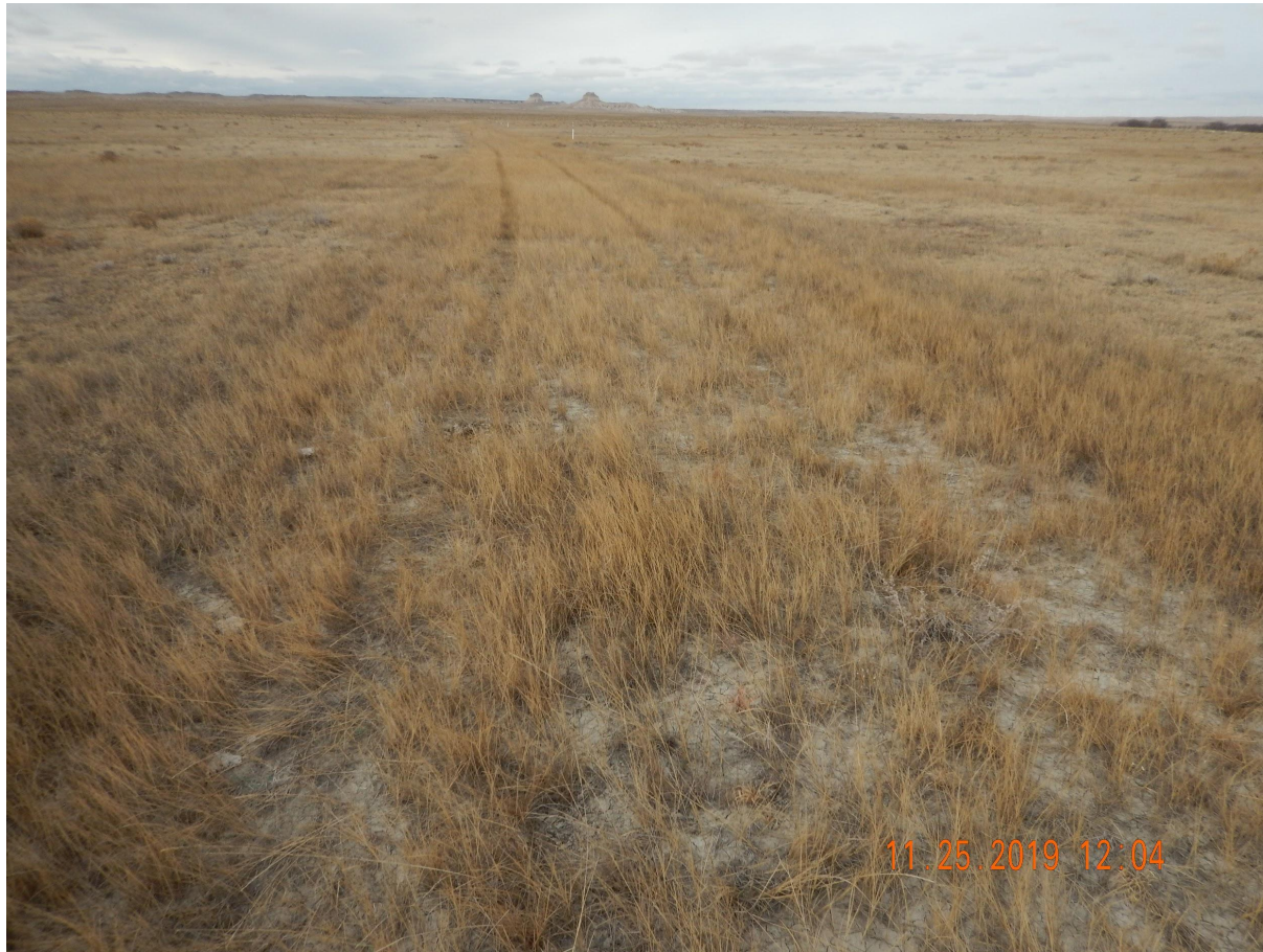
Photo 3. Photo taken from a portion of the central access road, facing West. See comments under Photo 1.