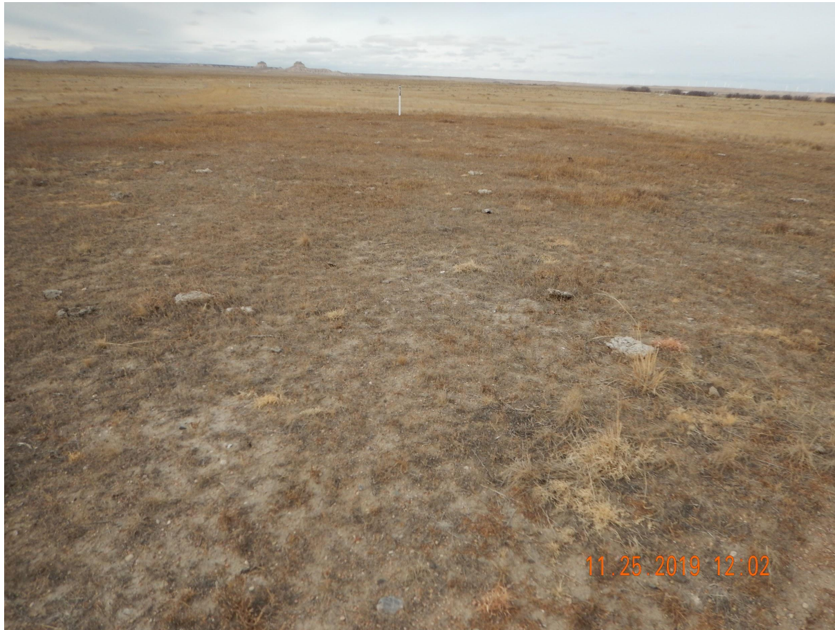
Photo 4. Photo taken from the central tank battery location, facing West. See comments under Photo 1.