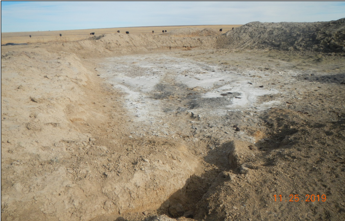
Photo 5. Drilling pit remains open and drilling materials present.