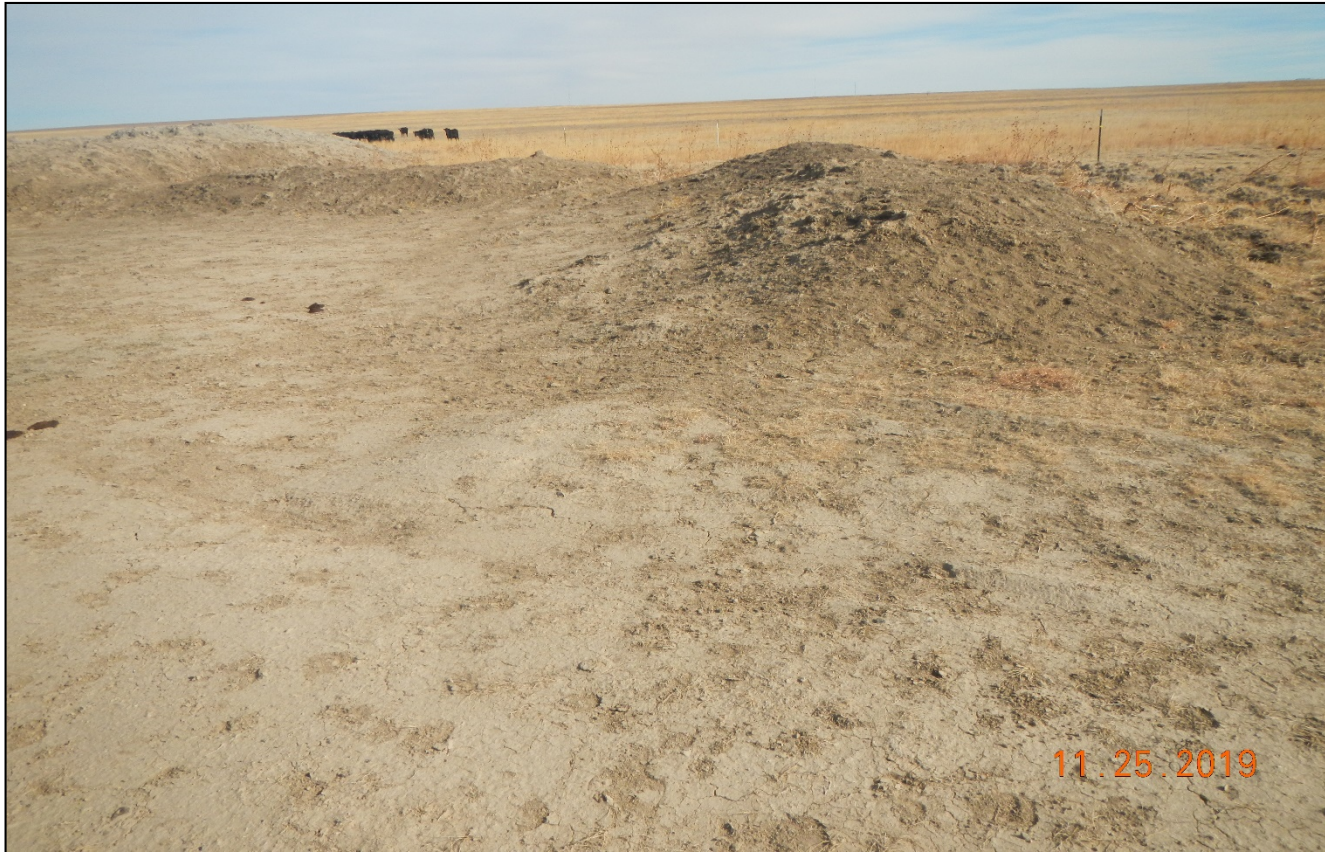
Photo 10. There are minimal topsoil salvage piles at the southeast side of the location which are not protected.