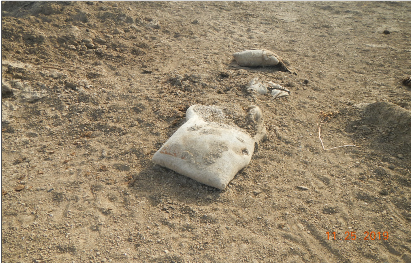
Photo 6. The is a torn bag of unknown contents which is spilled on the ground.