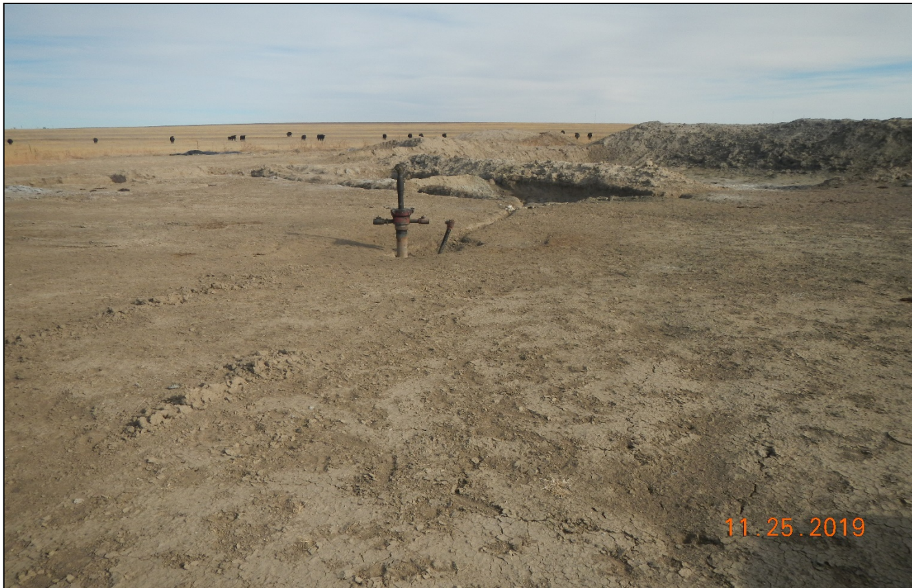
Photo 4. Facing toward the wellhead.