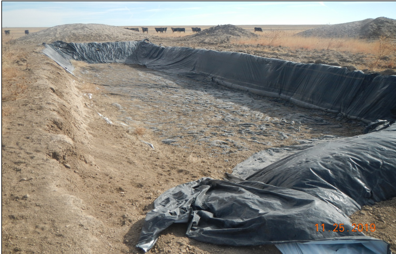
Photo 8. The lined pit remains open. The liner is torn and in disrepair.