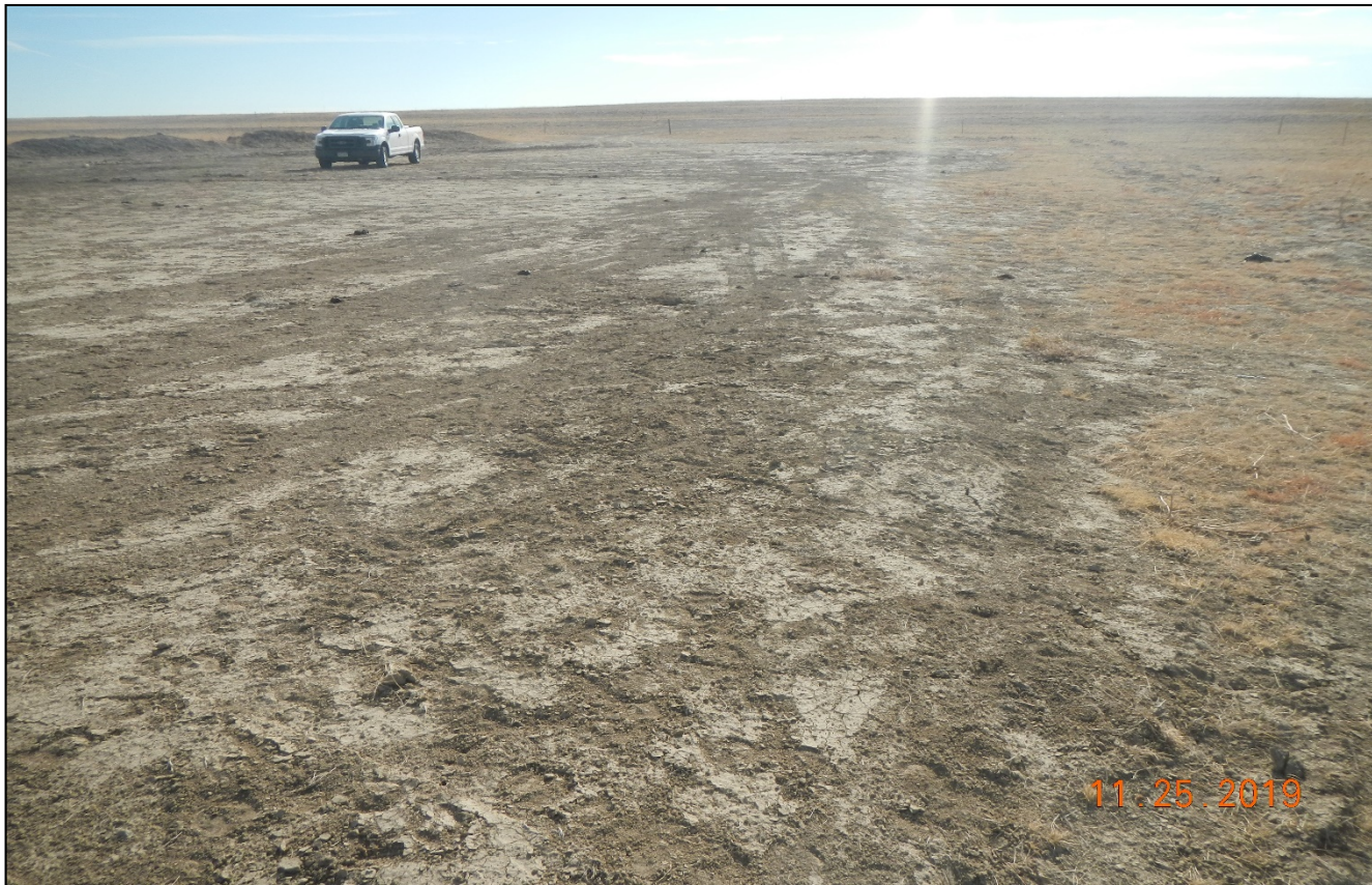
Photo 9. Facing south at the location. Top soil was not properly salvaged from the location.