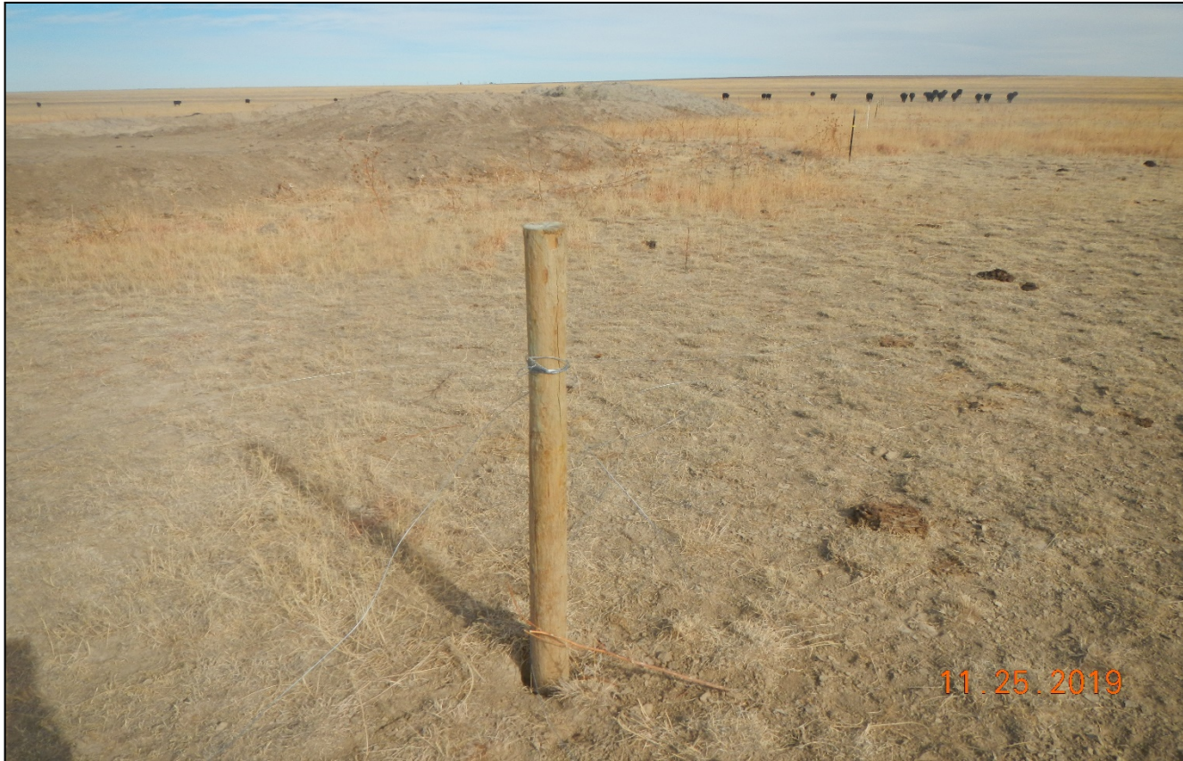
Photo 3. The electric fence around the location is in disrepair and wire is strung along the ground.