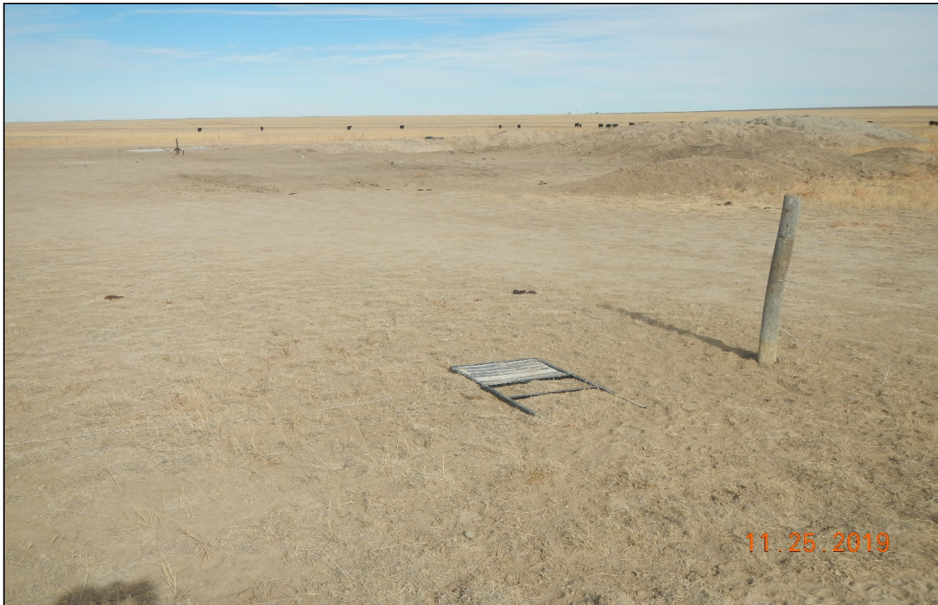
Photo 2. Facing northeast toward the location. The location sign has fallen over and is not properly installed.