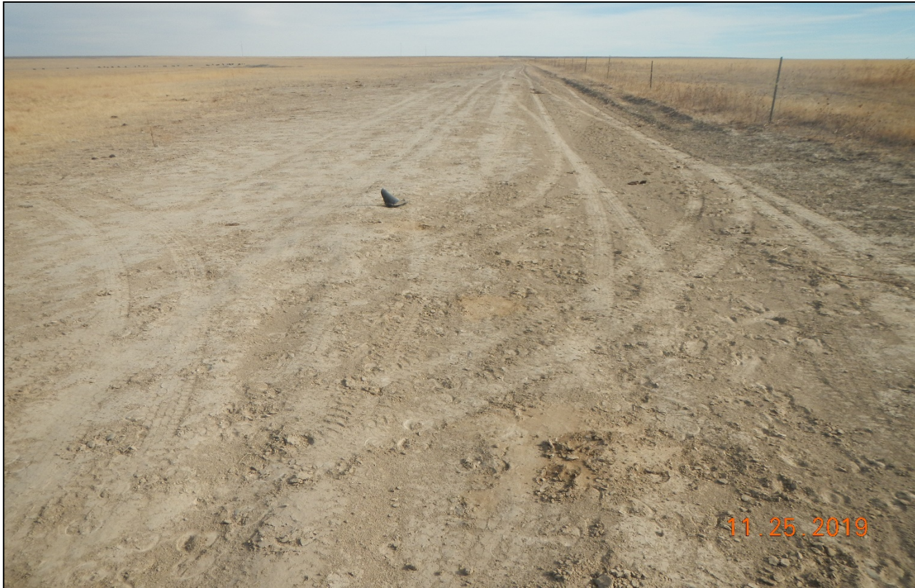
Photo 1. Facing east along the access road to the location. The road has been widened and disturbed during drilling operations. Disturbance outside of the road must be reclaimed.