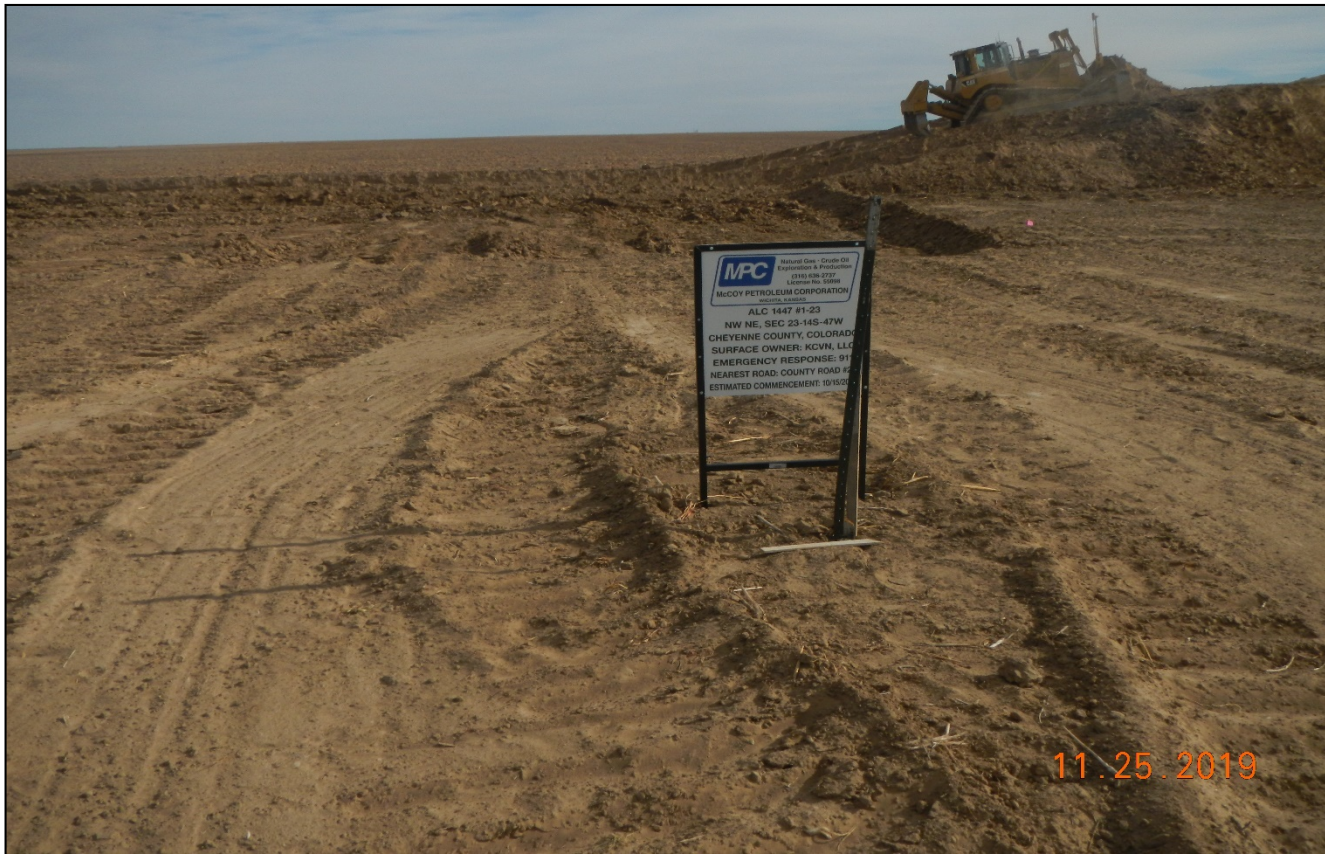
Photo 5. Location sign was posted at the center of the location.