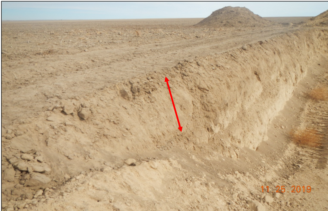
Photo 7. Excavated pit shows topsoil horizon.