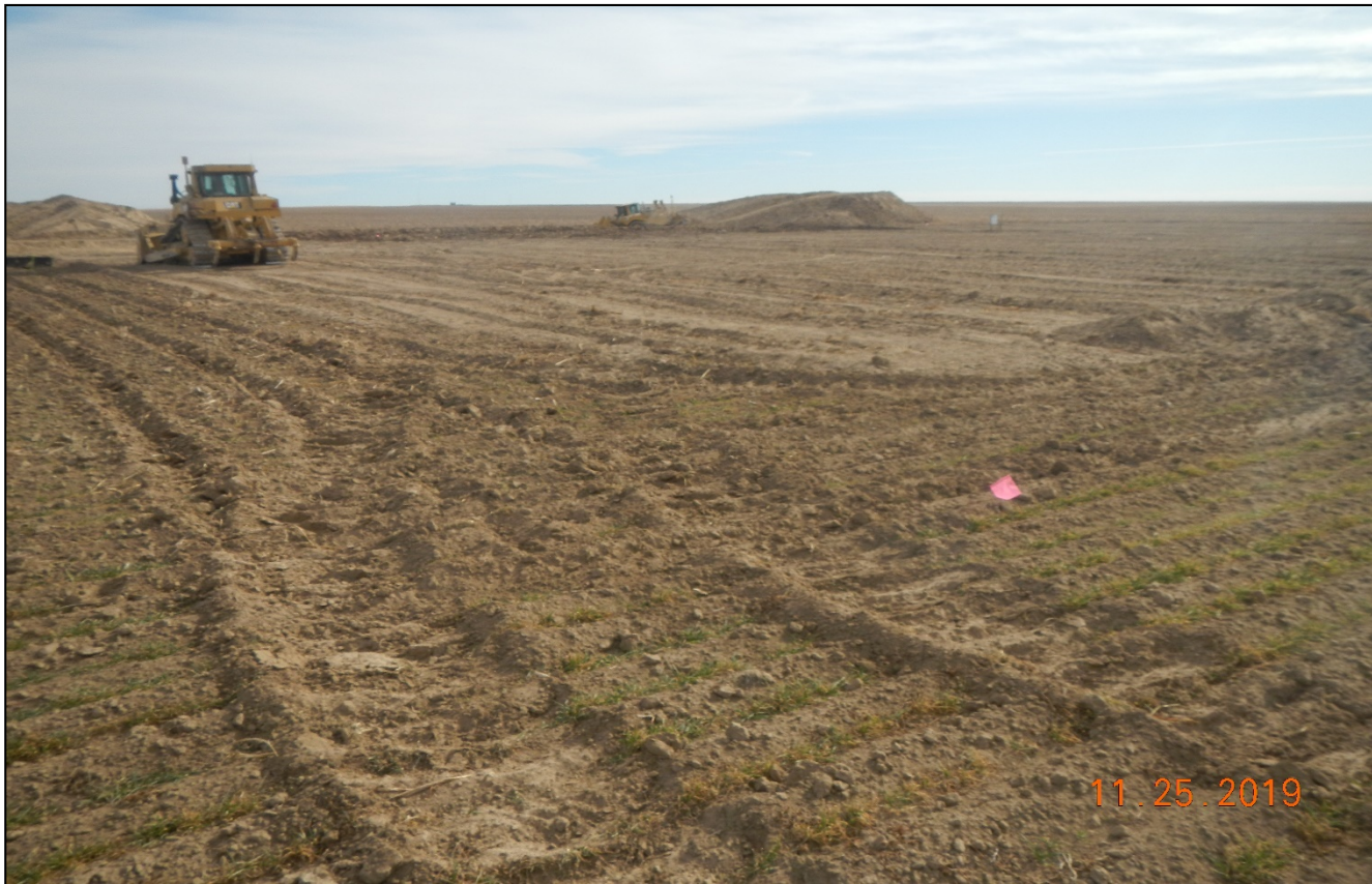
Photo 1. Northwest side of the location facing southeast. The location was in process of construction.