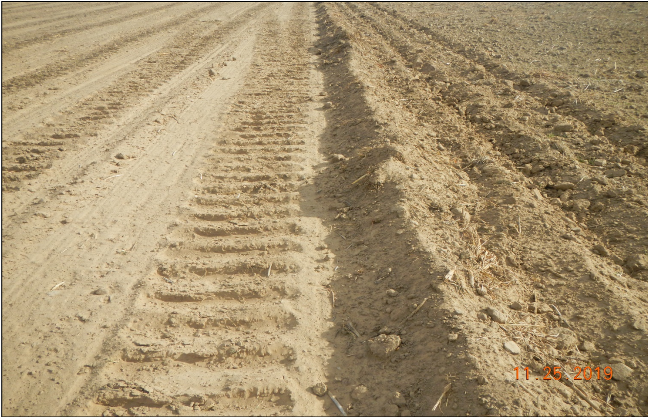
Photo 4. Facing east along the southern edge of the location which show topsoil salvaged was approximately 6 inches on this side of the pad and even less on the northern side of the pad.