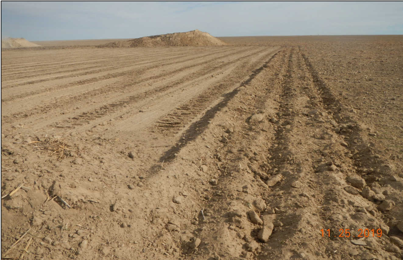
Photo 3. Southwest side of the location facing east. Surface roughening around the perimeter however this practice should be performed in conjunction with other BMP's.