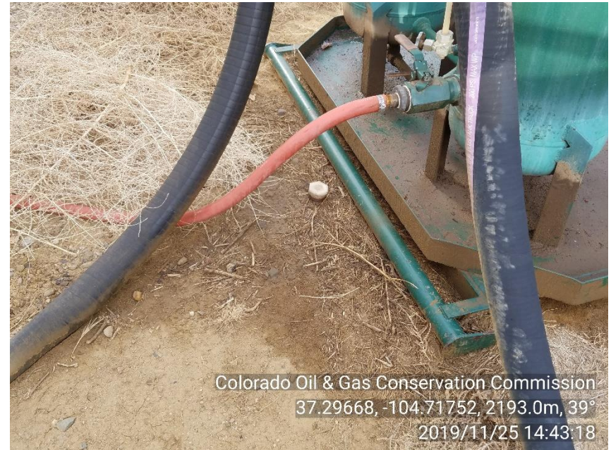
PHOTO 4: ANOTHER AREA OF IMPACTED SOIL AROUND COMPRESSOR. SAME CA AS PHOTO 3.