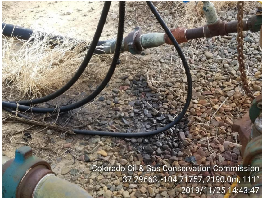
PHOTO 5: ANOTHER AREA OF IMPACTED SOIL AROUND WELLHEAD. SAME CA AS PHOTO 3.