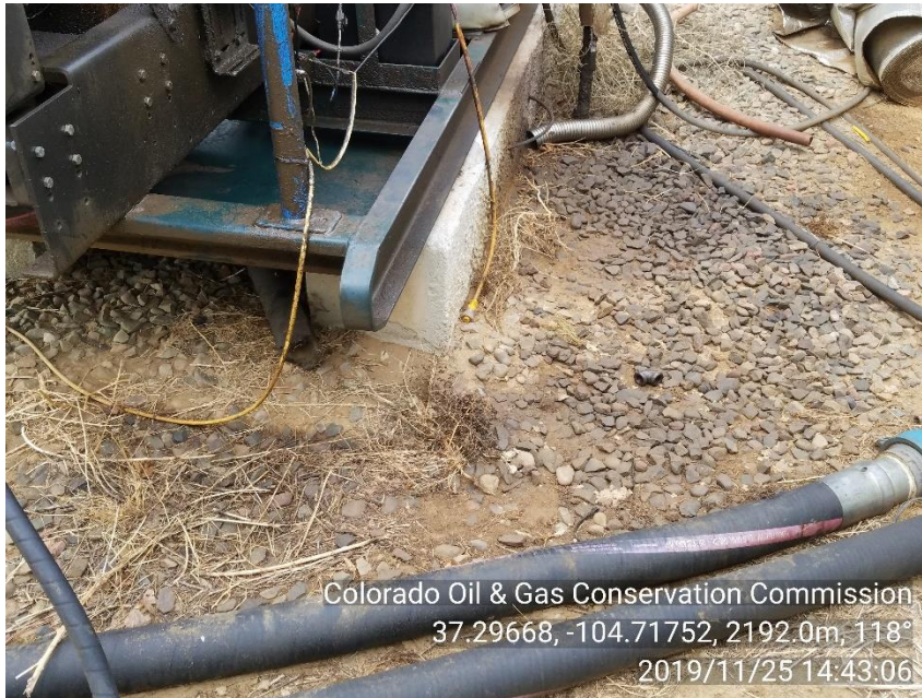
PHOTO 3: AREA OF IMPACTED SOIL NEAR PRIME MOVER (ENGINE SKID) MOTOR ON ENGINE SKID HAS OIL LEAKS IN NUMEROUS PLACES. Remove and dispose impacted material in approved manner, service and maintain equipment and self inspect to prevent recurrence of conditions per 1002.f(2) and 907. Increase frequency of maintenance and self inspection schedule of equipment to prevent impacting surface materials and mixing of wastes with precipitation. Rule 907 & 1002.f.(2). CA DATE 12-25-19.