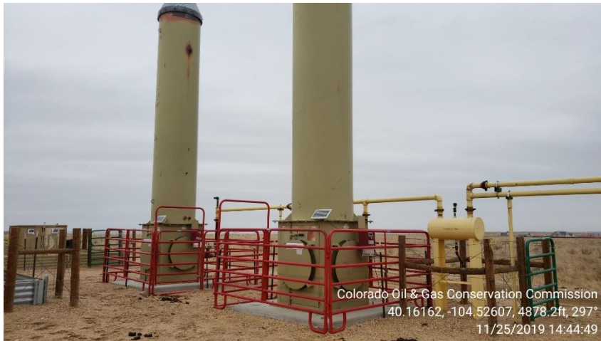
Photo 11 ECDs