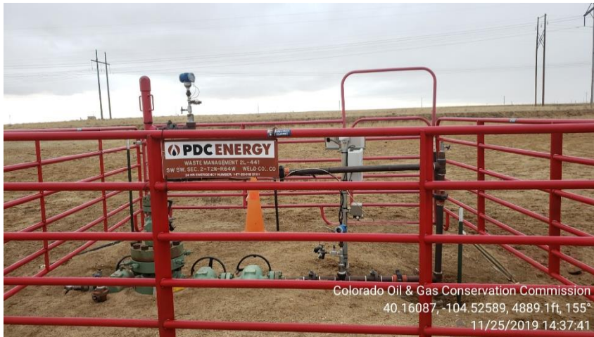
Photo 1 WH sign