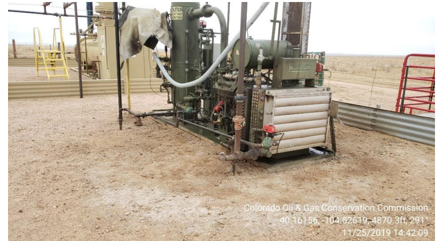
Photo 8 stained soil removed mech. Issue appears to have been addressed