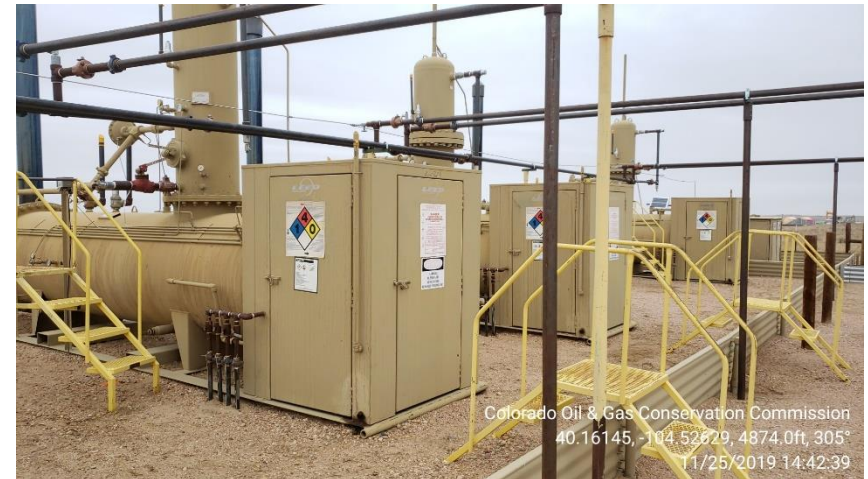
Photo 10 heated horiz.sep.