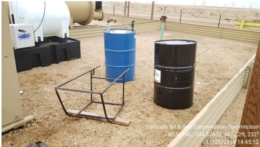
Photo 9 unused drums no containment