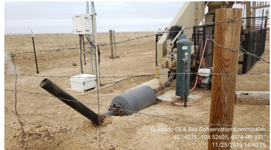
Photo 6 stained soil removed exhaust has been rerouted