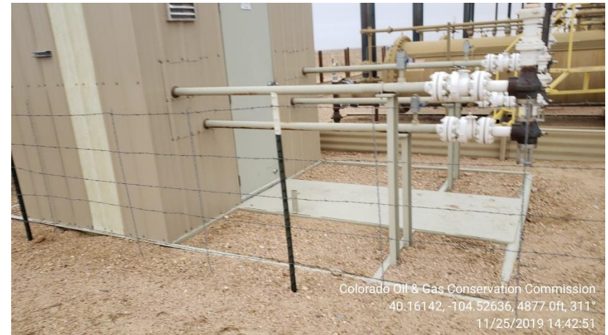
Photo 12 Gas meter run