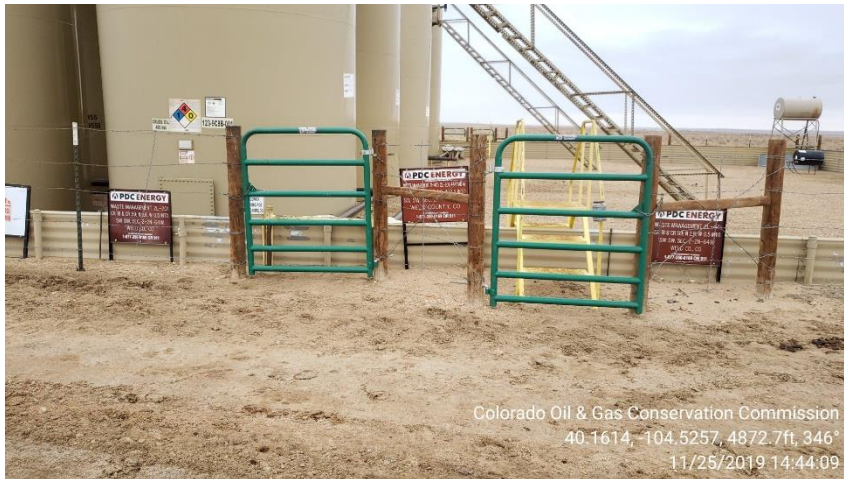
Photo 3 TB signs