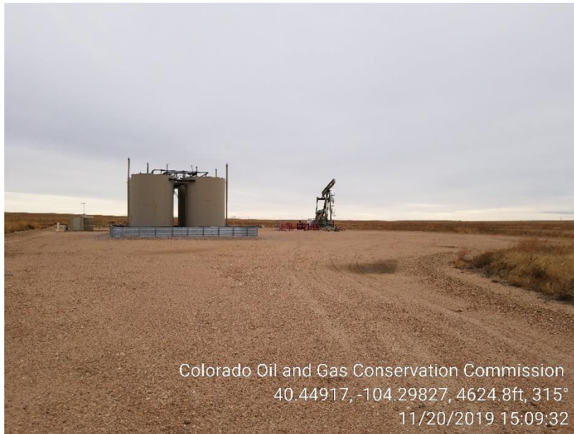
Photo 1 – Pumping Unit and Tank Battery