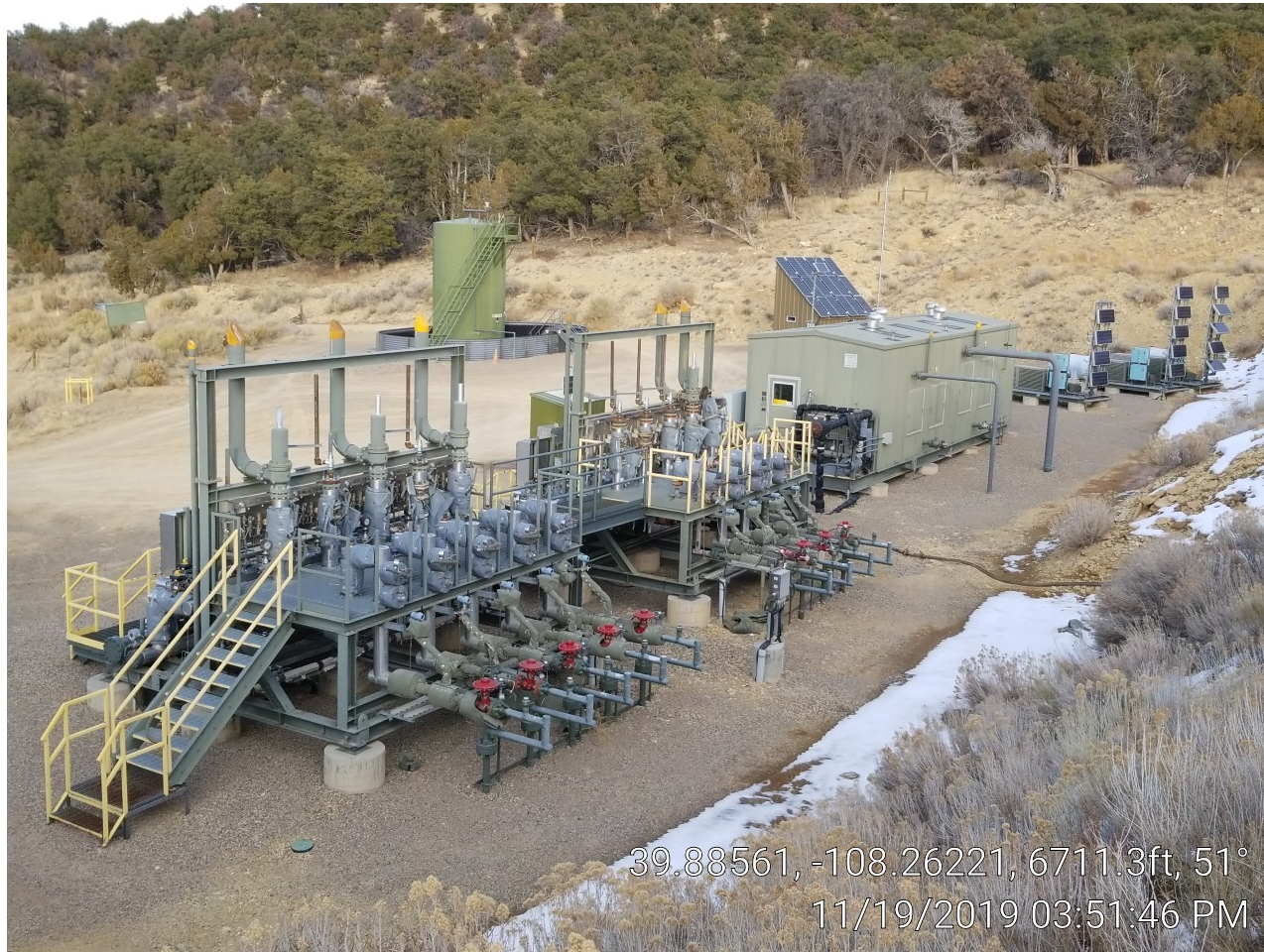
Photo 2. Battery, separator, chemical, and well header.