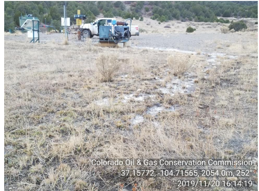
PHOTO 3: 1" VALVE ON TBG TREE IS LEAKING (JUDGING BY THE DISCOLORATION OF THE GRAVEL BELOW THE 1" OUTLET THIS WELL HAS BEEN LEAKING FOR A LENGTHY AMOUNT OF TIME). Securely fasten all valves, pipes, and fittings to ensure good mechanical condition, inspect at regular intervals and maintain in good mechanical condition per Rule 605.d. Report spill or release of E&P waste or produced fluids Remove free fluids and contact COGCC EPS staff per Rule 906.b. 24 hours for notification and 72 hours for Initial Form 19 Report.

PHOTO 4: FLUID FROM WELL HAS TRAVELED APP. 129' FROM WELLHEAD.