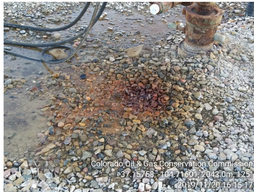
PHOTO 6: DISCOLORATION OF GRAVEL BENEATH LEAKING 1" VALVE INDICATING LEAK HAS BEEN PRESENT FOR A LENGTHY ABOUT OF TIME.