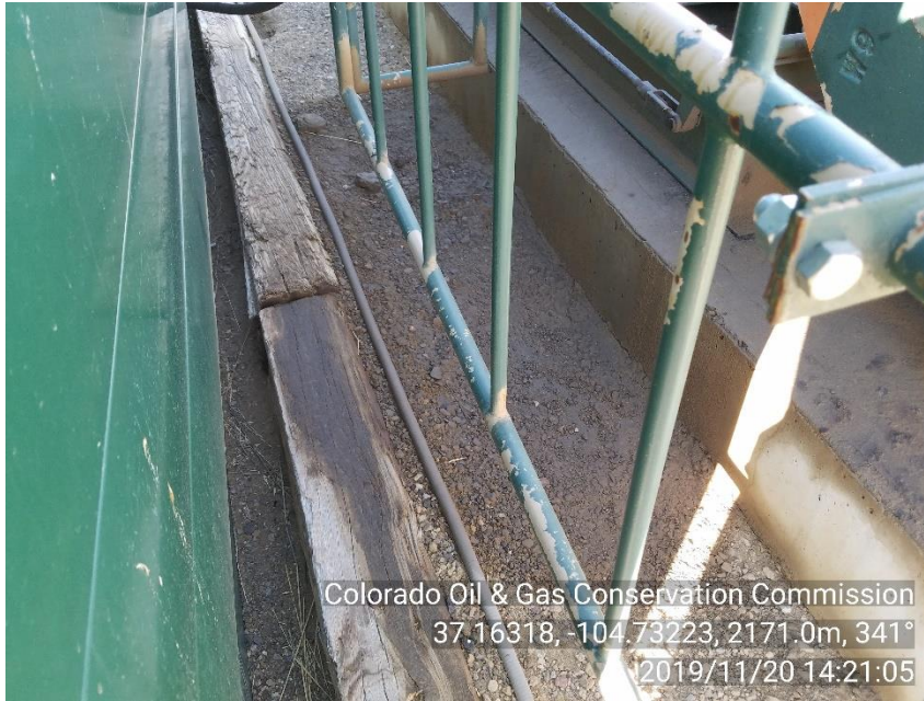
PHOTO 3: AREA OF IMPACTED SOIL BETWEEN PUMPJACK AND SOUND WALL. Remove and dispose impacted material in approved manner, service and maintain equipment and self inspect to prevent recurrence of conditions per 1002.f(2) and 907. CA DATE 12-20-19