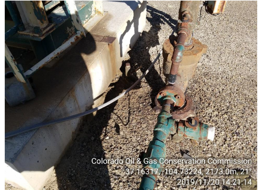
PHOTO 4: AREA OF IMPACTED SOIL AROUND WELLHEAD. Remove and dispose impacted material in approved manner, service and maintain equipment and self inspect to prevent recurrence of conditions per 1002.f(2) and 907. CA DATE 12-20-19