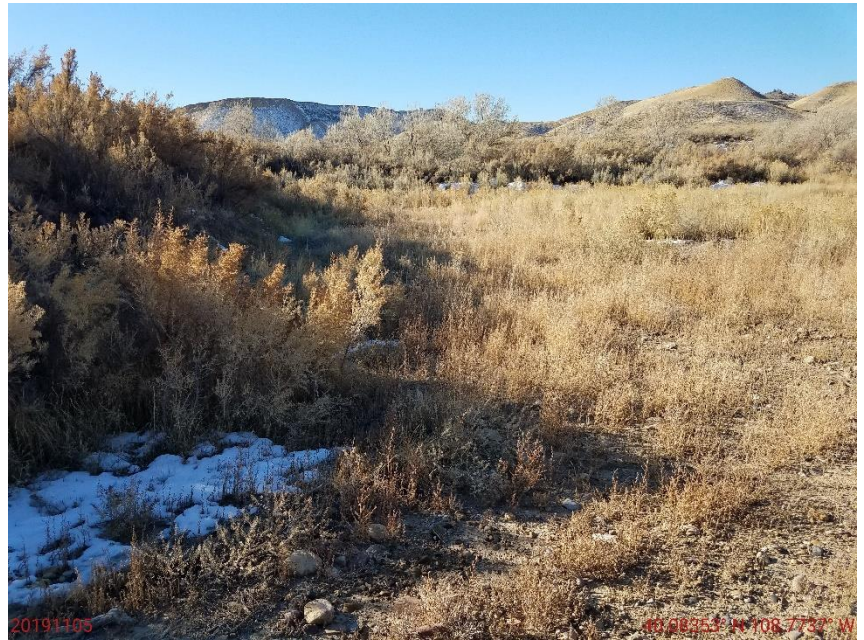
Photo 8: Photo taken from the east end of the location, facing southwest. Photos 8-10 provides and overview of the well location from southwest, west to northwest. Photo shows vegetation over the reclamation area; vegetation on the location is predominantly undesirable weedy plant species such as Salsola sp. and Kochia. Vegetation on the north and southern ends of the location appears to be progressing towards reclamation requirements. Additional seeding will likely be required for location to meet COGCC 1004 uniform desirable vegetative requirements.