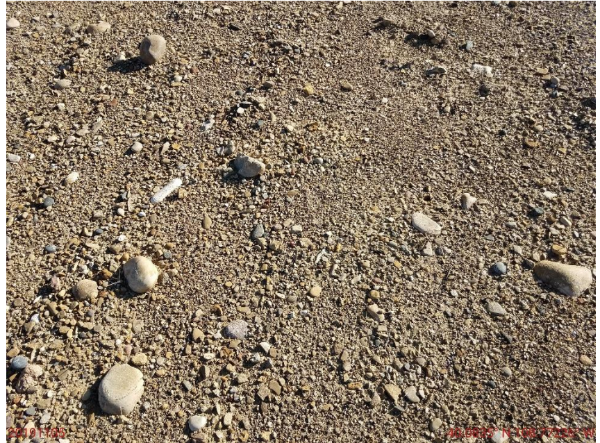
Photo 16: Photo taken from the access road. Photo shows what appears to be gravel remaining on the access road. Material was not observed on the soils of the adjacent reference areas. Aggregate likely hindering desirable vegetative establishment.