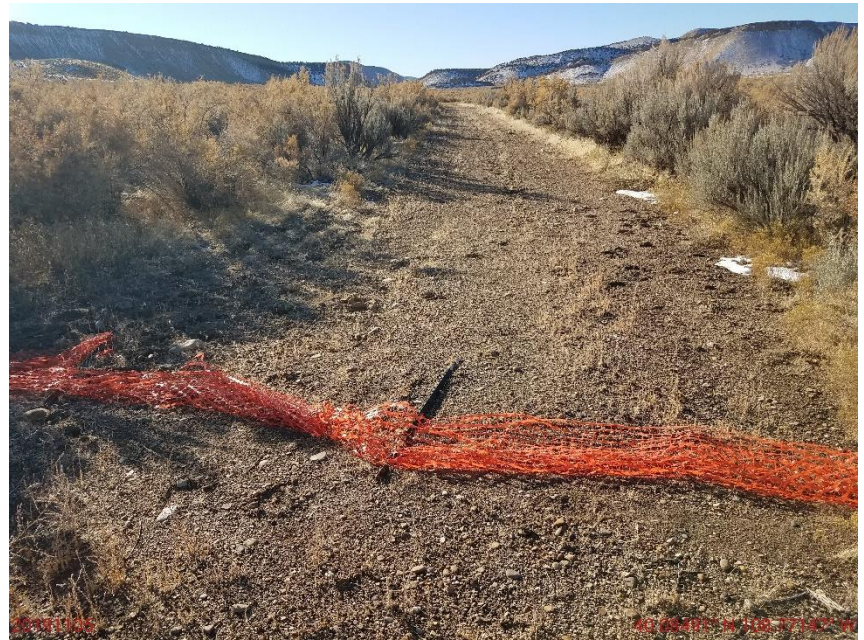
Photo 2: Photo taken from the access road, facing south. Photo shows orange fence used to restrict vehicle access over the reclamation areas. Fence in disrepair and vehicle traffic evident along access road.