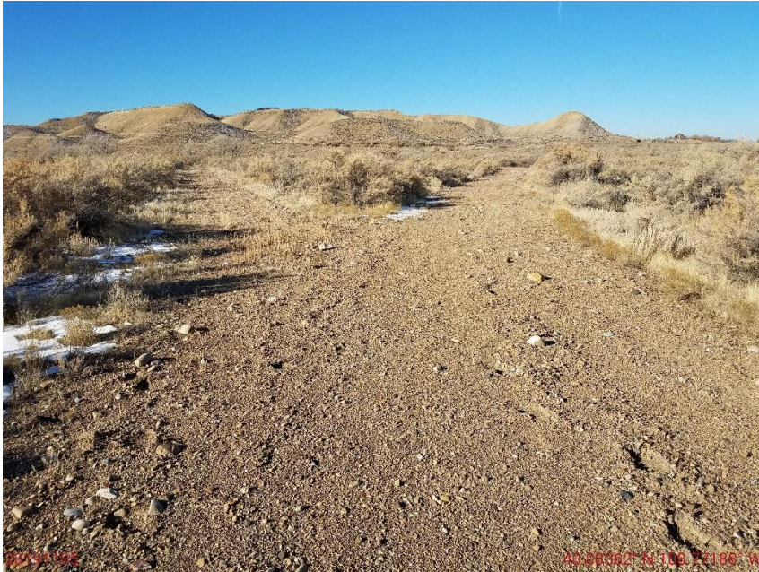
Photo 5: Photo taken from the access road, facing west. Photo shows area where access road splits and forms a loop leading to the well and battery locations. See comments under photo 3.