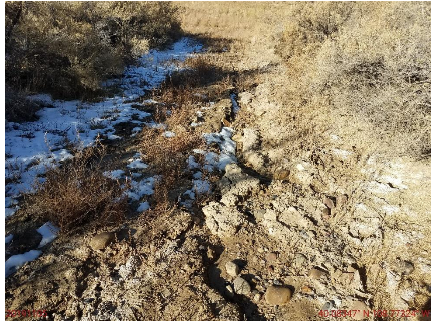
Photo 6: Photo taken from the access road, east of the location facing west. Photo shows stormwater erosion degradation along sloped access road.