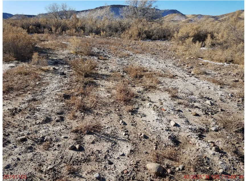
Photo 12: Photo taken from the southern end of the battery location. Photo shows reclamation of the access road and battery is not progressing towards reclamation requirements.