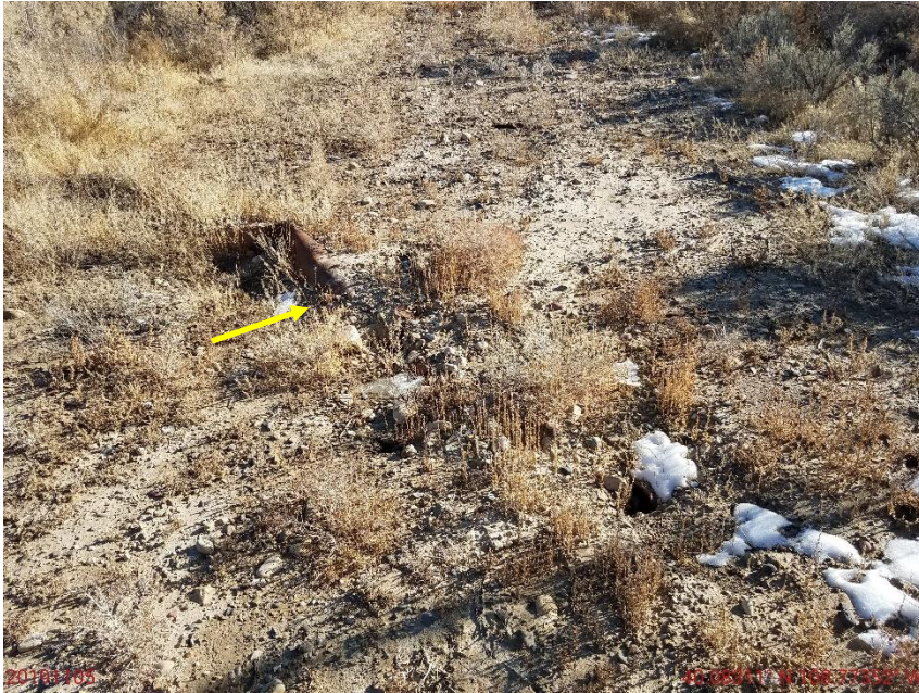
Photo 13: Photo taken from the south end of the battery location. Photo shows pipe, possibly a culvert, remaining at the battery.