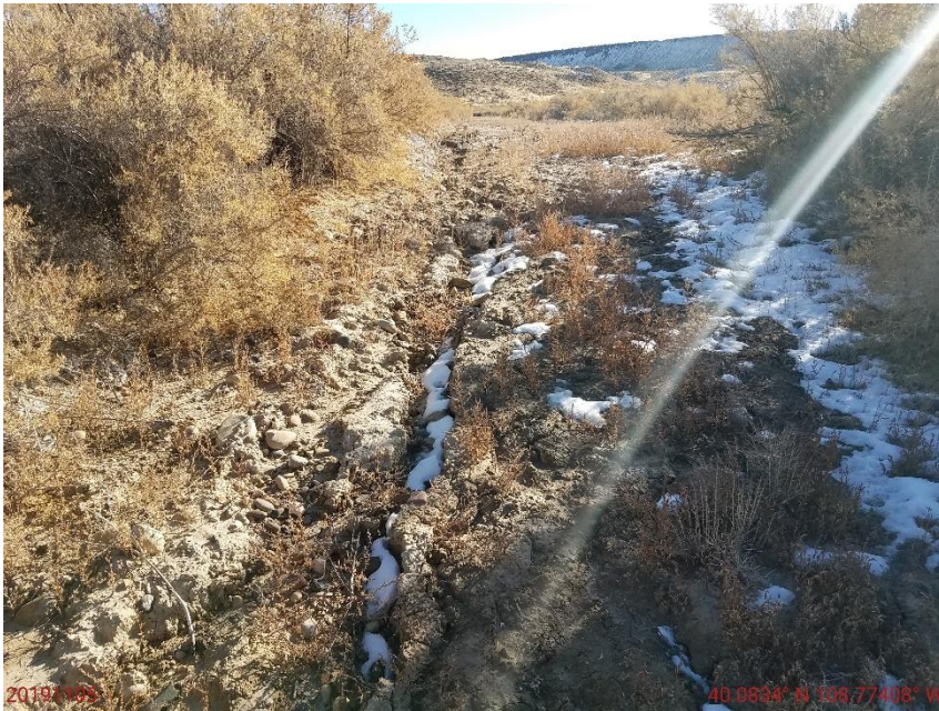
Photo 7: Photo taken from the east end of the location, facing east. Phot shows stormwater erosion degradation along sloped access road. Insufficient stormwater and erosion control BMPs on access road.