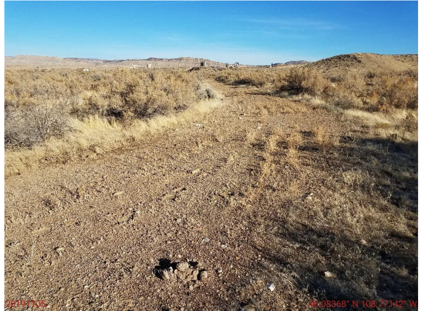
Photo 4 : Photo taken from the access road, facing north. See comments under photo 3.

Photo 3: Photo taken from the access road, facing west. Photo shows reclamation over access road is not progressing towards COGCC 1000 series rules and requirements. Vegetation observed on access road predominantly undesirable weedy plant species such as Salsola sp. And Kochia . Desirable species reflective of the reference area were not observed to be establishing on access road.