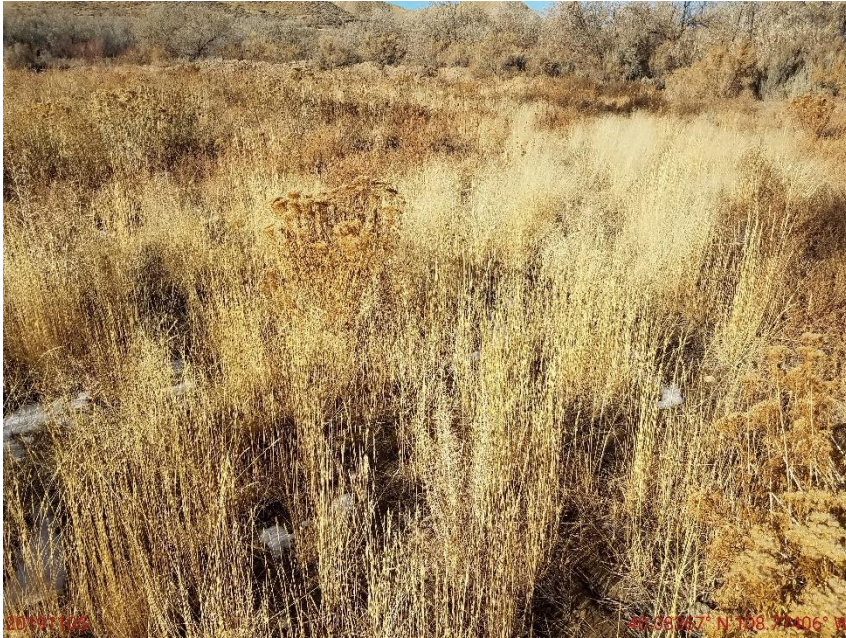
Photo 11: Photo taken from the north end of the location, facing west. Photo shows desirable vegetative establishment on the north end of the location. The northern and southern ends of the location appear to be progressing towards reclamation requirements.