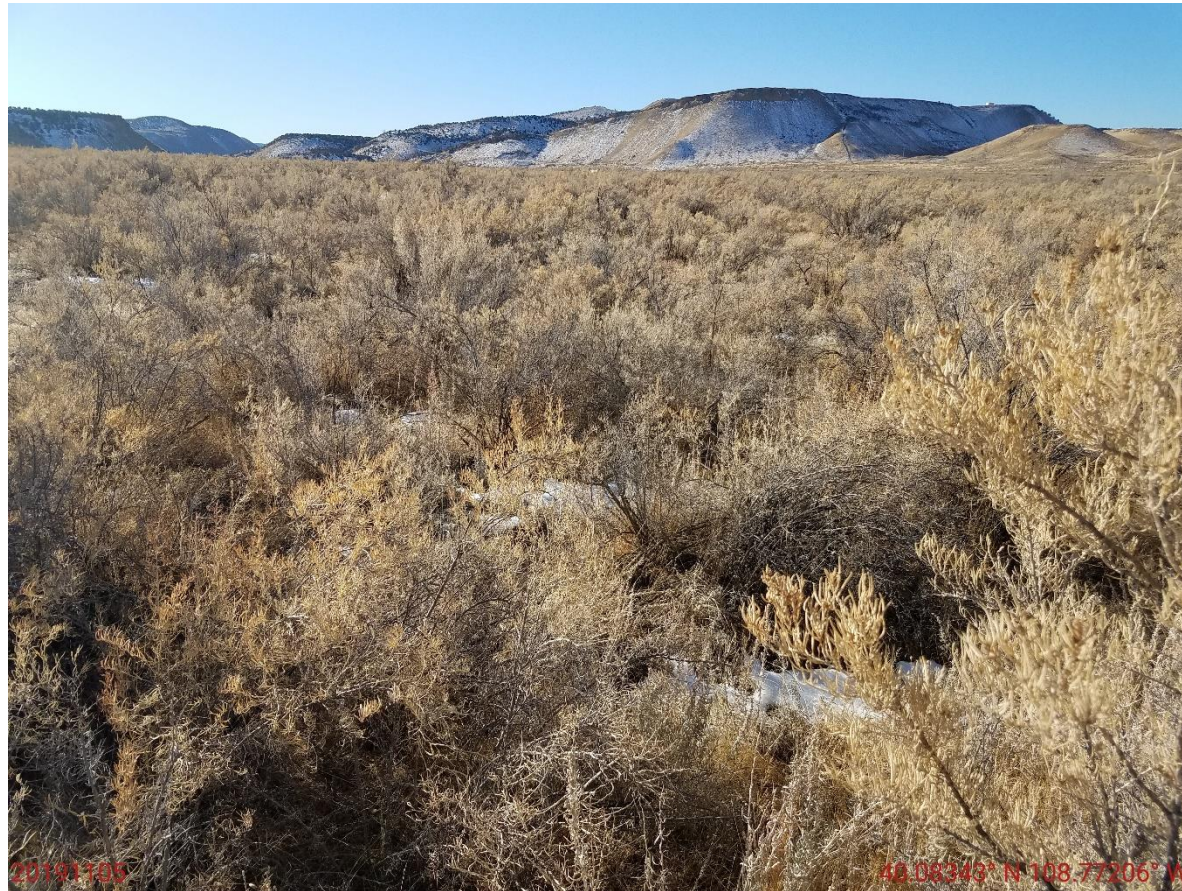
Photo 17: Photo shows vegetation over the adjacent reference area.