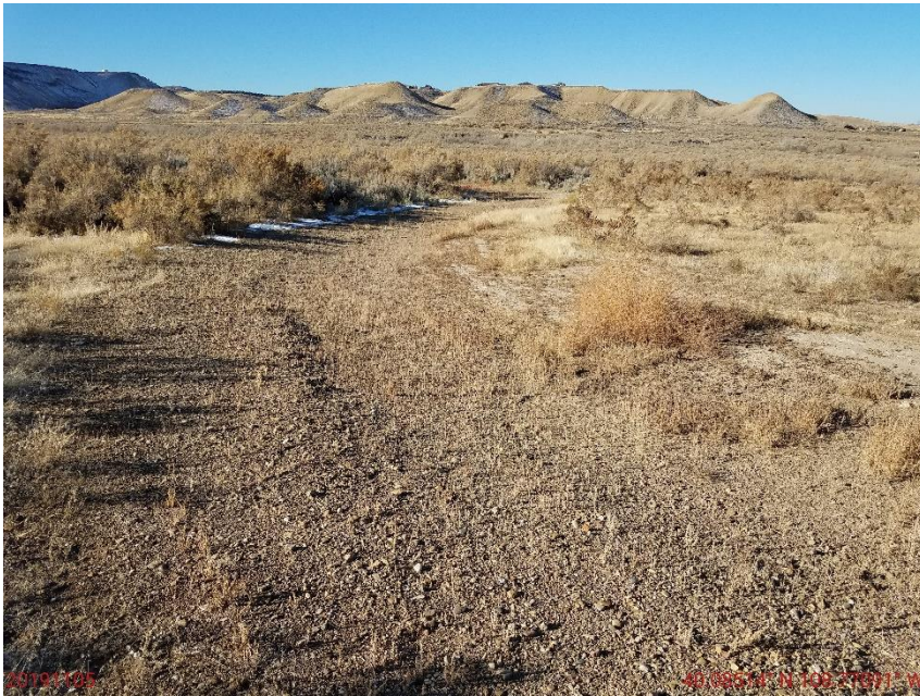
Photo 1: Photo taken from the CR 218, facing west. Photo shows access road leading to the location