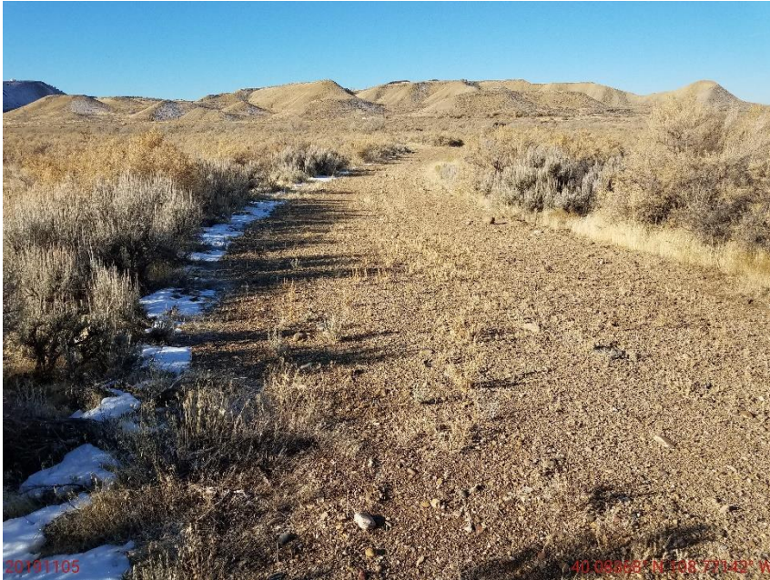
Photo 3: Photo taken from the access road, facing west. Photo shows reclamation over access road is not progressing towards COGCC 1000 series rules and requirements. Vegetation observed on access road predominantly undesirable weedy plant species such as Salsola sp. And Kochia . Desirable species reflective of the reference area were not observed to be establishing on access road.