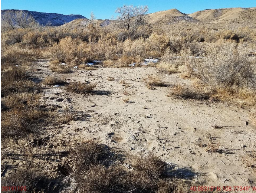
Photo 15: Photo taken from the battery location facing west. Photo shows battery location remains predominantly bare and exposed soil. Reclamation of the battery location is not progressing towards reclamation standards.