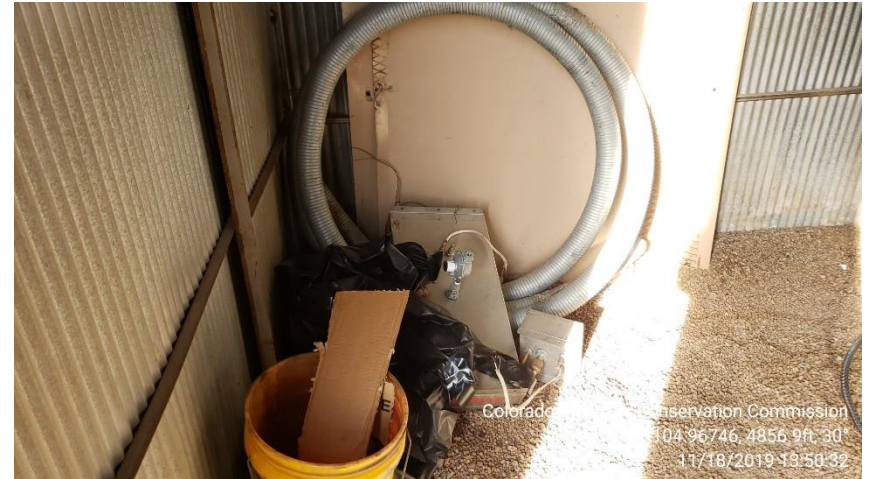
Photo 12 trash in compressor house