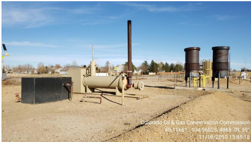
Photo 7 ECDs, Horiz. Heated separator