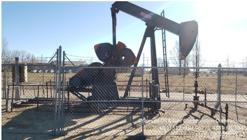
Photo 5 PU