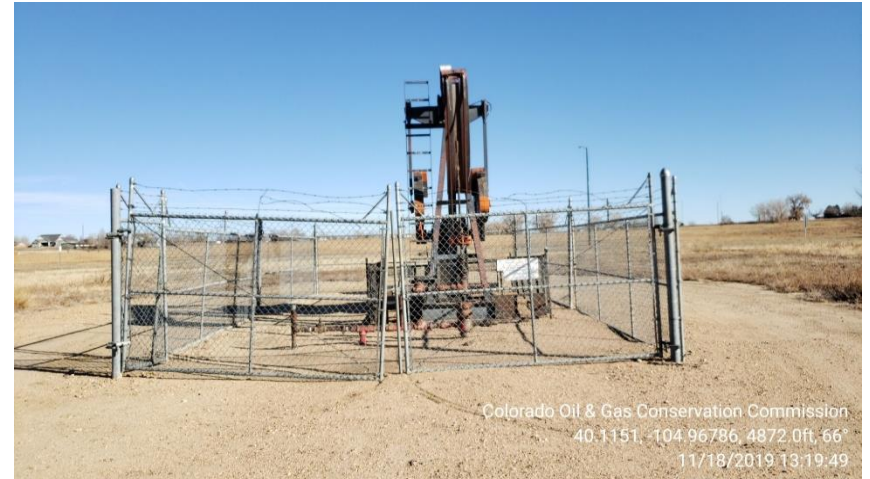
Photo 2 wellsite