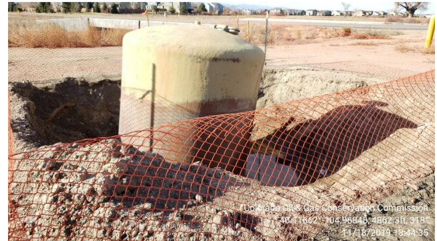
Photo 6 produced water tank appears to be in the process of being removed/replaced