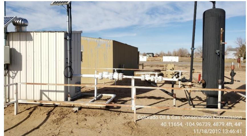
Photo 8 Vert. sep. gas meter run