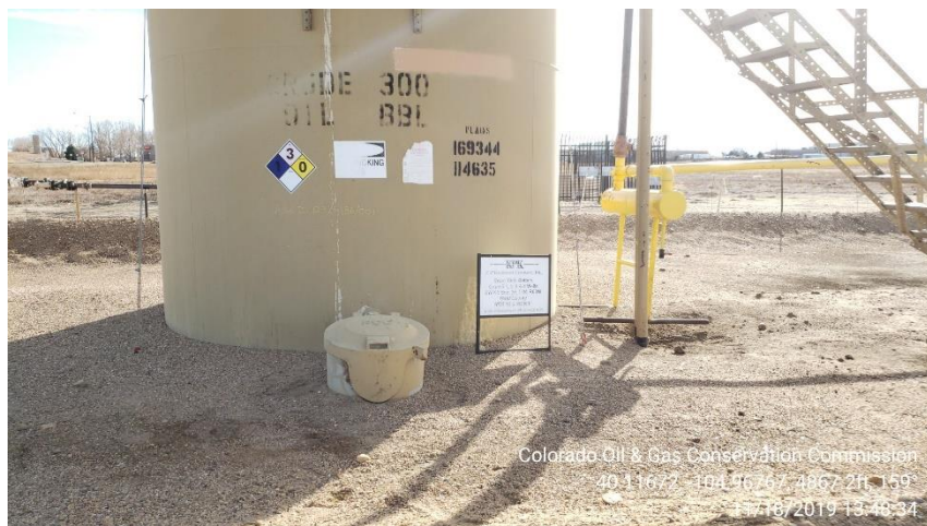
Photo 9 TB sign