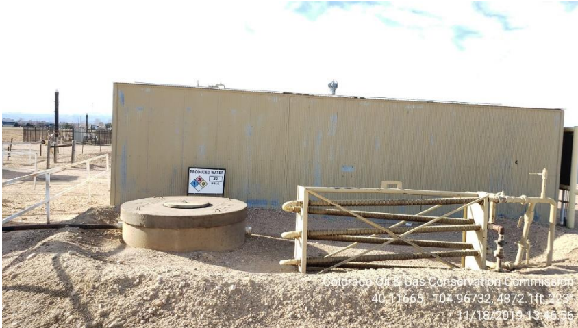
Photo 11 produced water tank compressor house