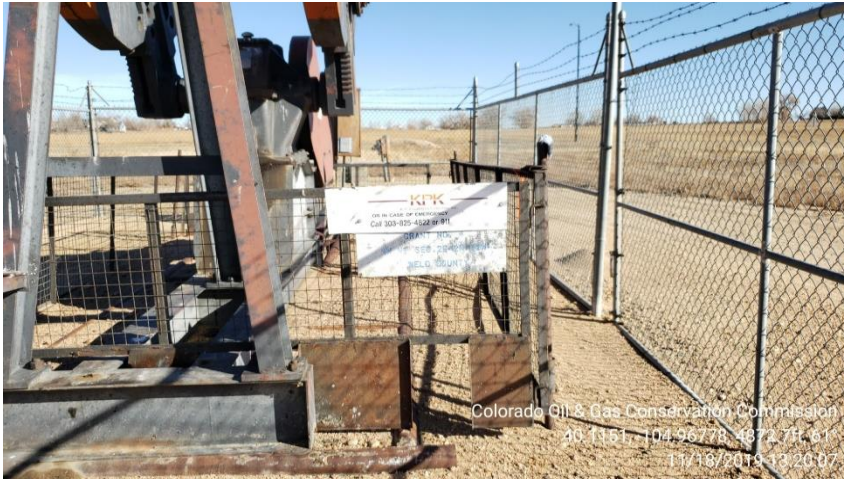
Photo 1 WH sign