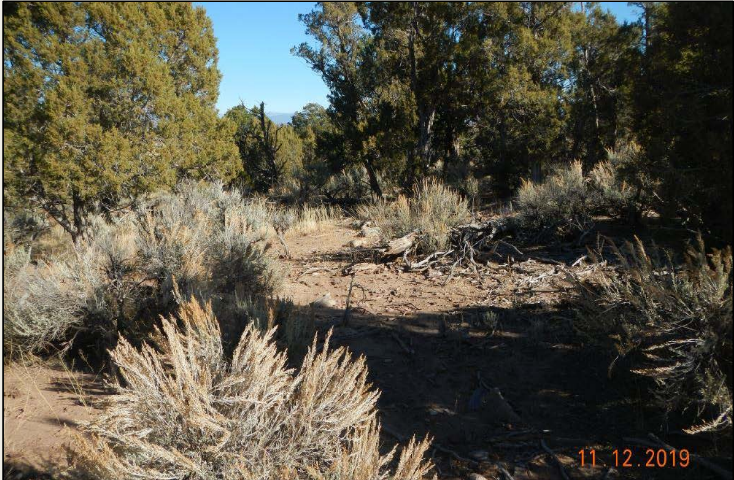
Photo 5. View of reference area vegetation, comprised of pinyon juniper woodland with big sagebrush understory.