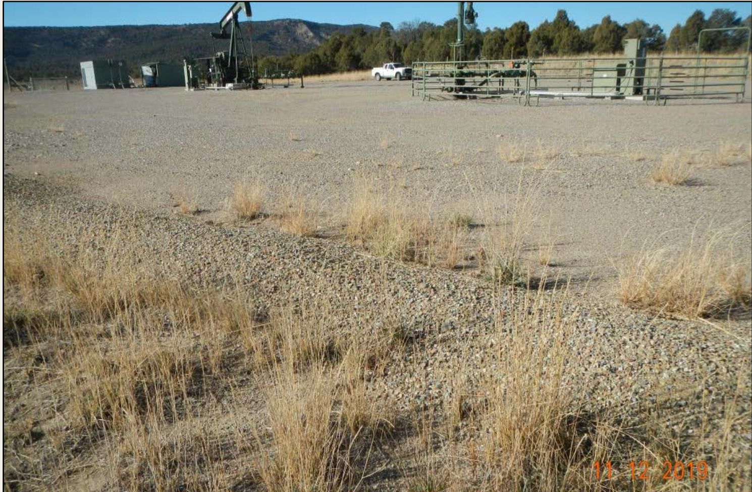
Photo 1. View of the project area from the northeastern corner facing center.