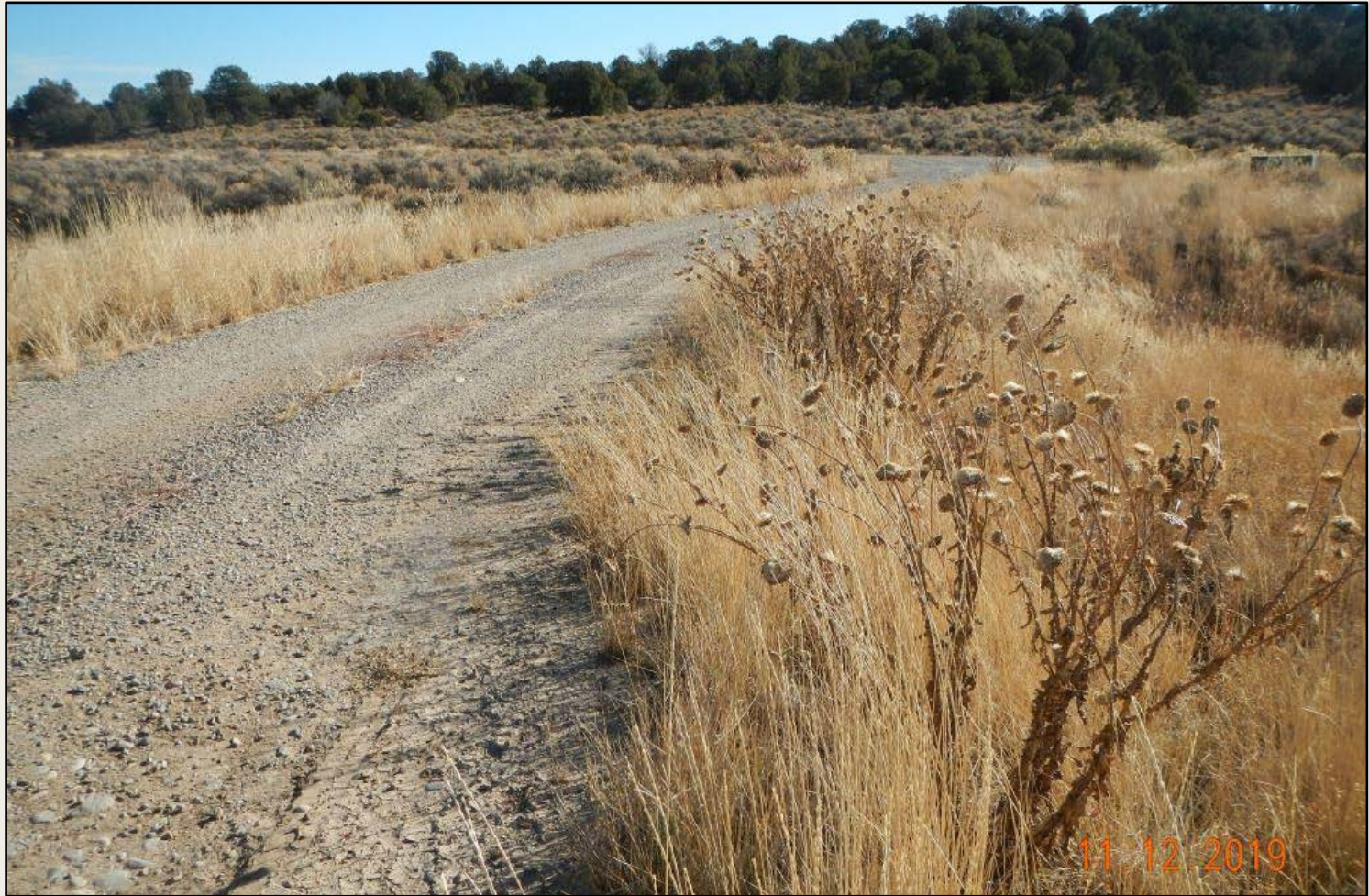
Photo 4. View of musk thistles growing along the access road.