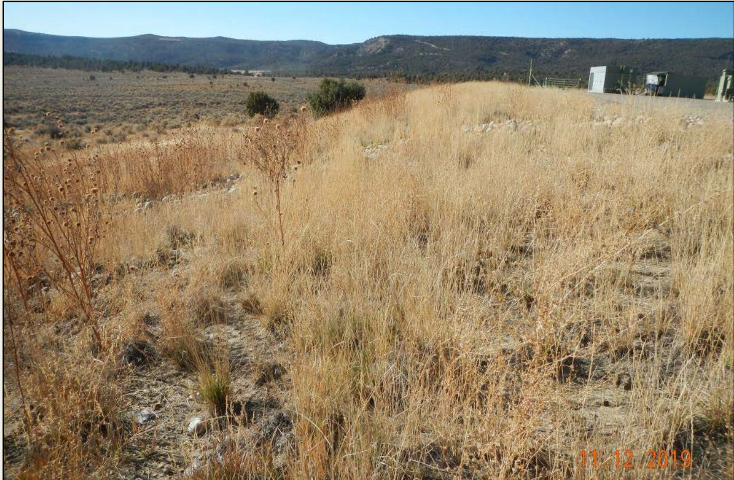
Photo 2. View of the eastern project area from the northeastern corner facing southward. Revegetation is progressing largely with western wheatgrass, crested wheatgrass, and blue grama.