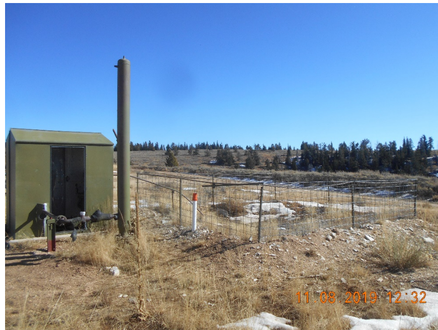
NE Meter housing, dehydrator and blowdown pit with fence.