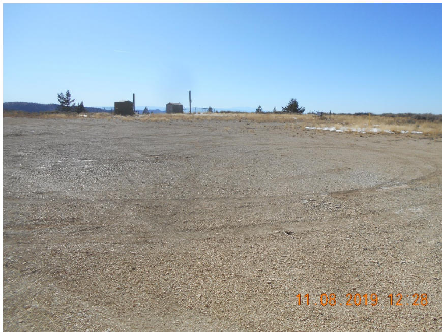
Location overview looking SW