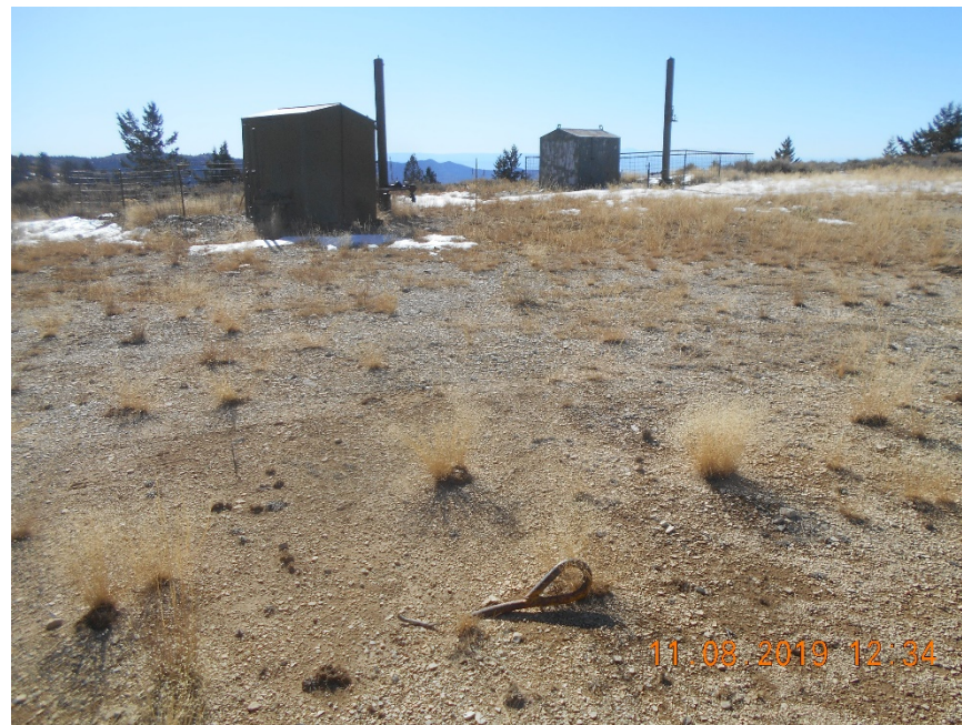
SE anchor with no marker.