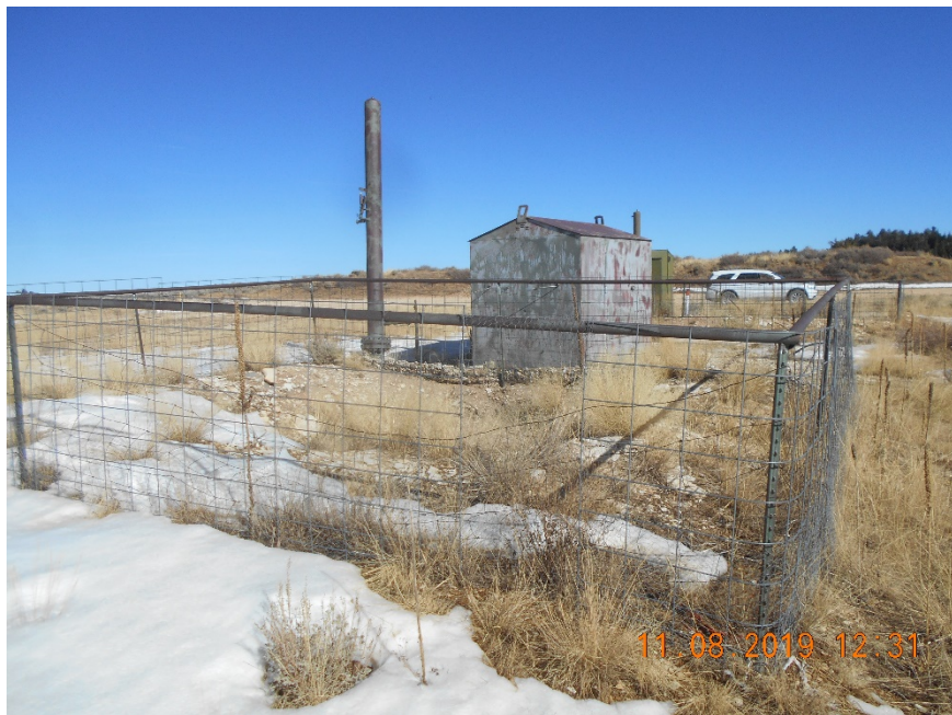
SW Meter housing, dehydrator and blowdown pit with fence.