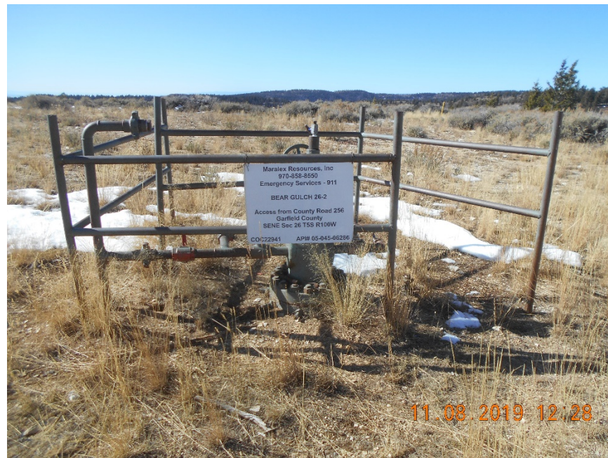
Wellhead with fence and sig