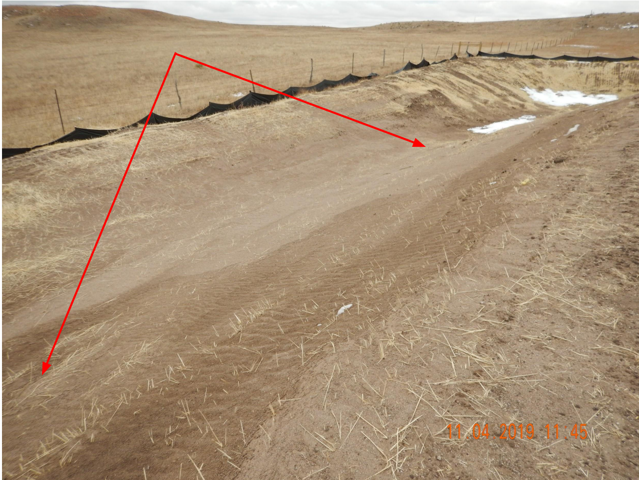
Photo 2. Photo taken from the southeastern location, facing South. Photo illustrates the ditch BMP installed in conjunction with the sediment trap. Note: Fine sediments from the well pad area are accumulating in the ditch BMP due to the well pad not properly stabilized.