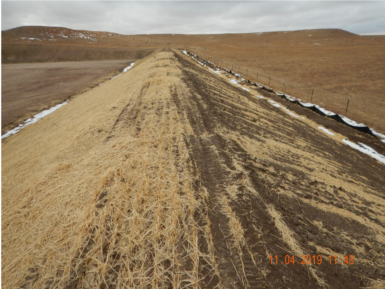
Photo 7. Photo taken from the topsoil stockpile along the northern location, facing West. See comments under Photo 6.