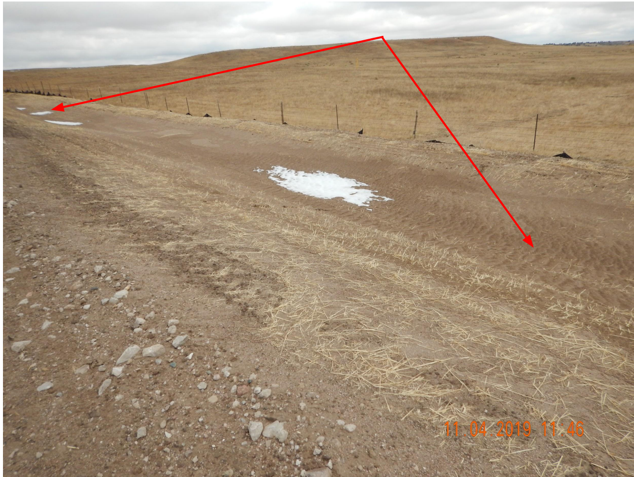
Photo 4. Photo taken from the eastern location, facing Northeast. Photo illustrates fine sediments from the well pad area are accumulating in the ditch BMP due to the well pad not properly stabilized.