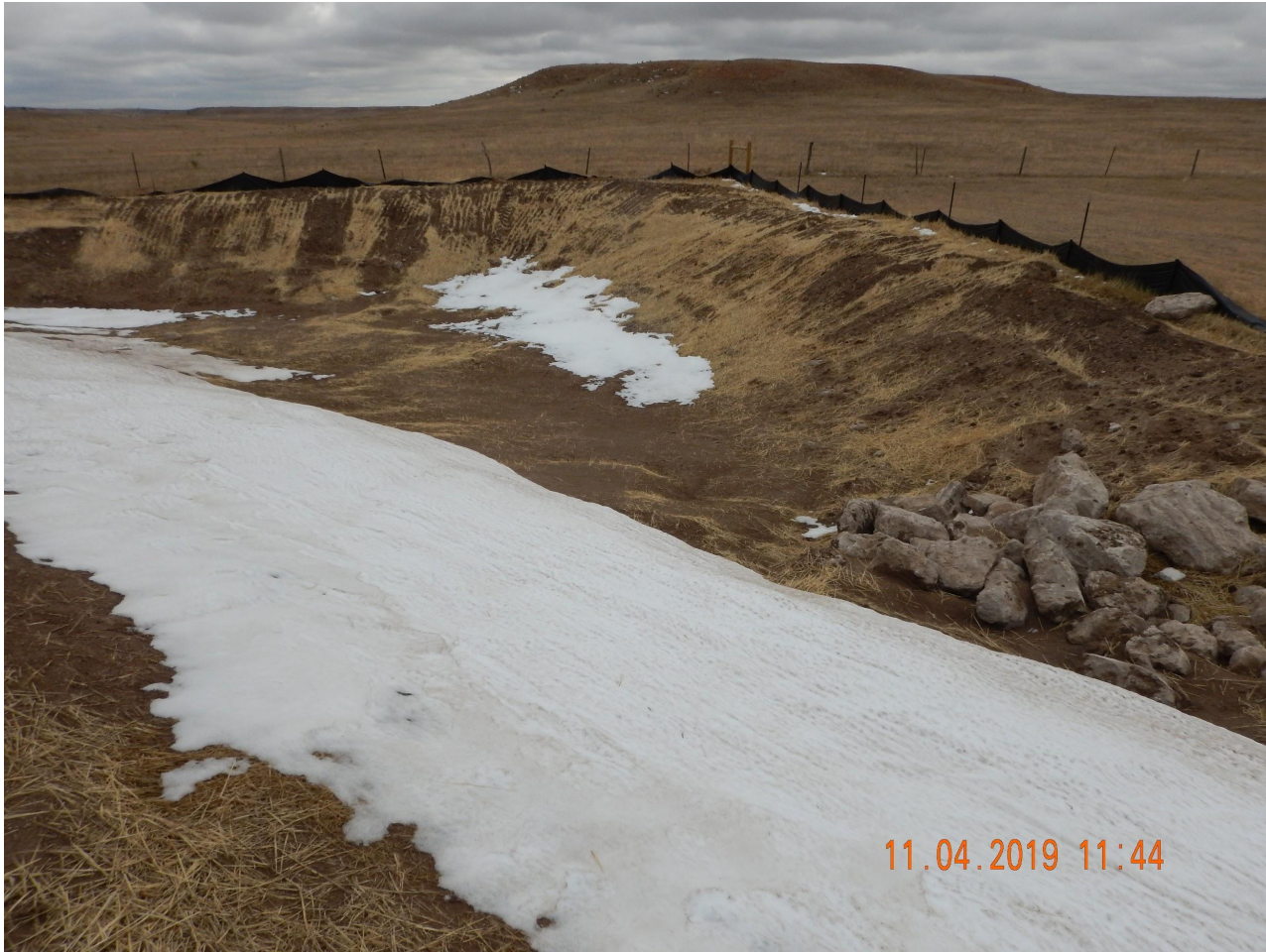
Photo 1. Photo taken from the southeastern location, facing East. Photo illustrates the new constructed sediment trap based off engineered designs. Note: Silt fence throughout the perimeter is in disrepair and not in proper functioning condition.