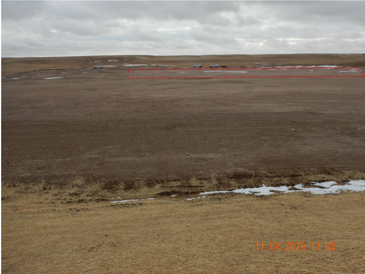
Photo 8. Photo taken from the topsoil stockpile, facing South. Photo is trying to illustrate the approximate rig area (dashed red lines). The rig area has CDOT Class 6 base; whereas, the rest of the well pad appears to remain unconsolidated as fines are accumulating the eastern ditch BMP.