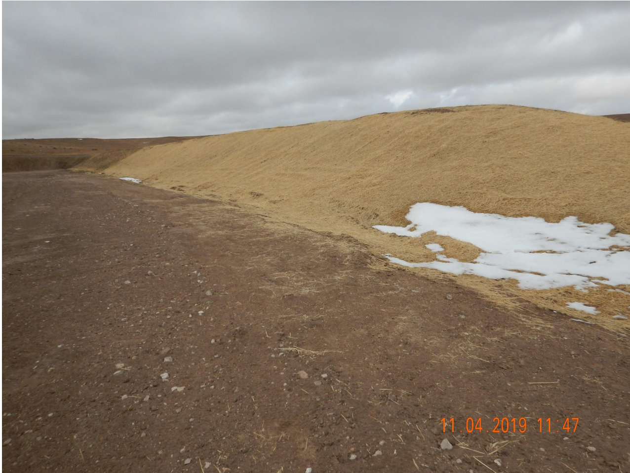
Photo 6. Photo taken from the topsoil stockpile along the northern location, facing West. Photo illustrates Operator has re-stabilized the topsoil stockpile.