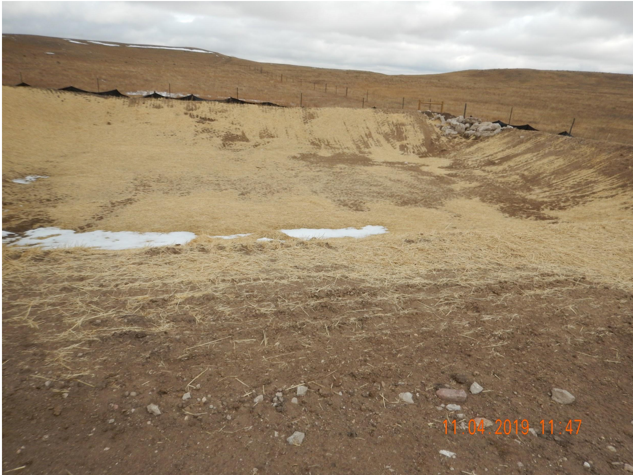
Photo 5. Photo taken from the northeastern location, facing North. Photo illustrates the new constructed sediment trap based off engineered designs.