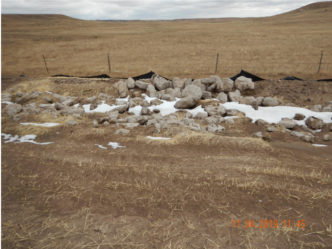
Photo 3. Photo taken from the eastern location, facing East. Photo illustrates the outflow area. The outflow area doesn't appear to be installed with good engineering practices.