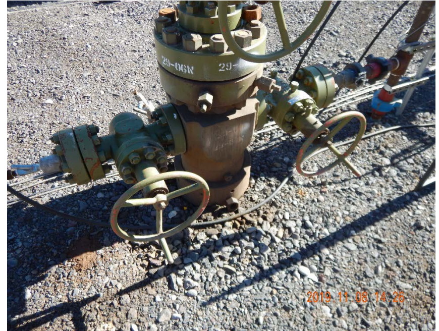
Photo #14 - View of oily waste accumulation beneath 29-06W wellhead.