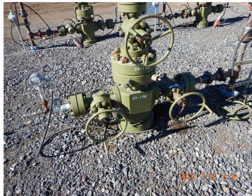
Photo #10 - View of oily waste accumulation beneath 29-13W wellhead.