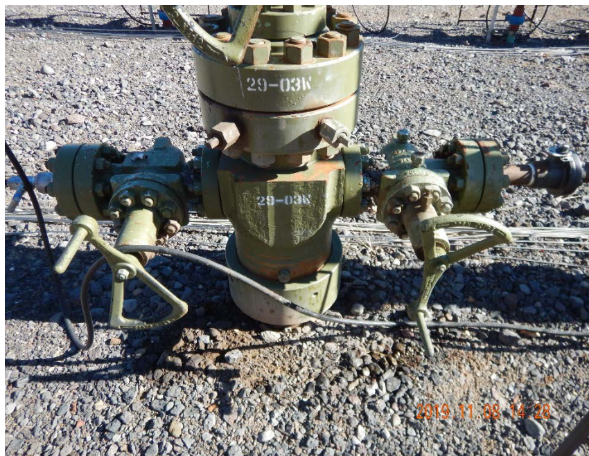
Photo #19 - View of oily waste accumulation beneath 29-03W wellhead.