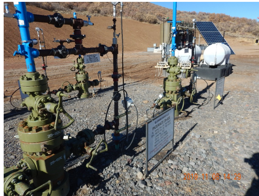
Photo #22 - View of oily waste accumulation beneath 29-02E well sign.