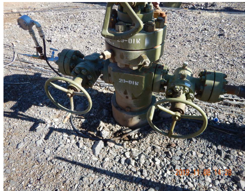
Photo #20 - View of oily waste accumulation beneath 29-01W wellhead.