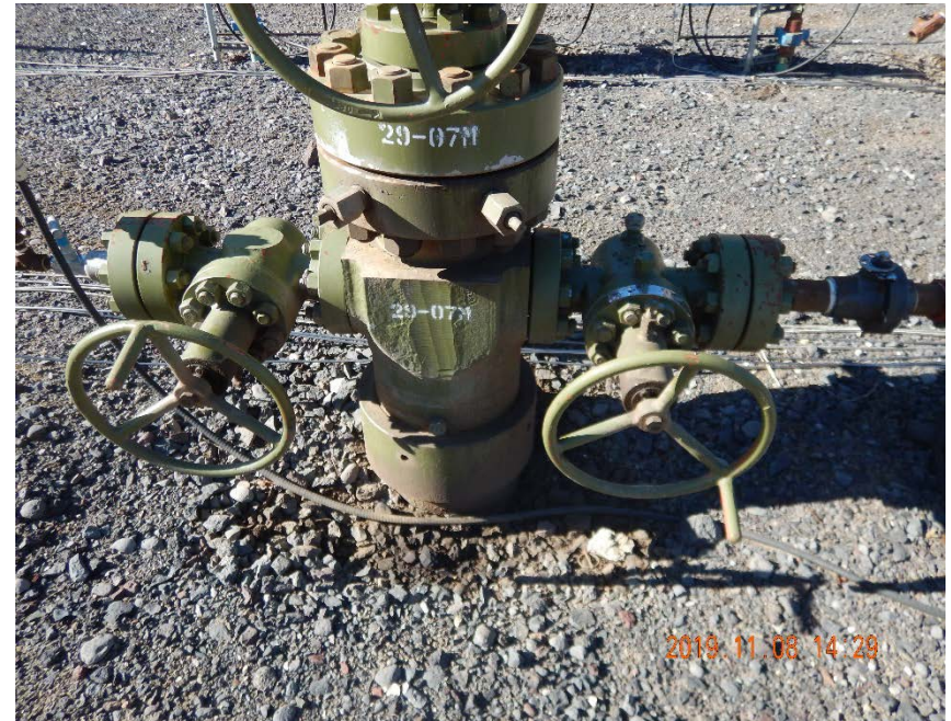
Photo #24 - View of oily waste accumulation beneath 29-07M wellhead.