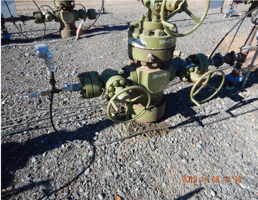
Photo #13 -View of oily waste accumulation beneath 29-07W wellhead.