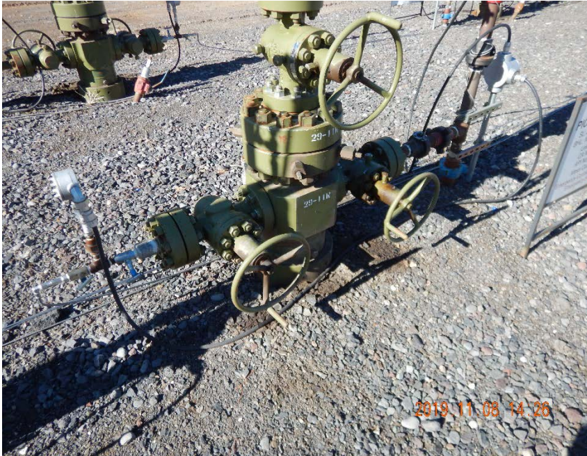
Photo #11 - View of oily waste accumulation beneath 29-11W wellhead.