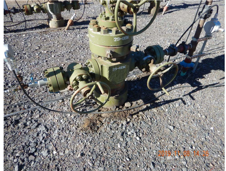
Photo #12 - View of oily waste accumulation beneath 29-09W wellhead.