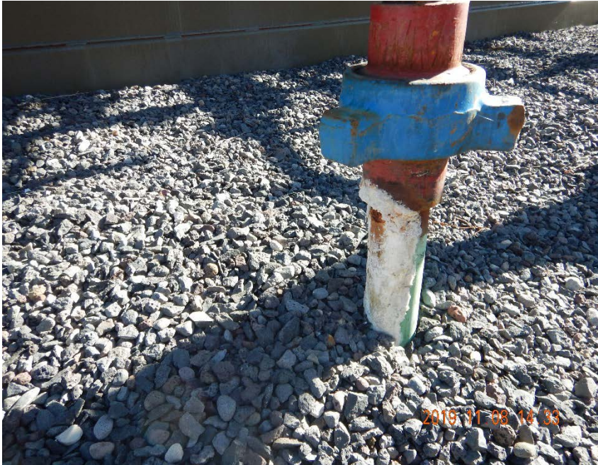
Photo #27 – Close-up view of scale buildup beneath hammer union on flowline riser from previous photo.