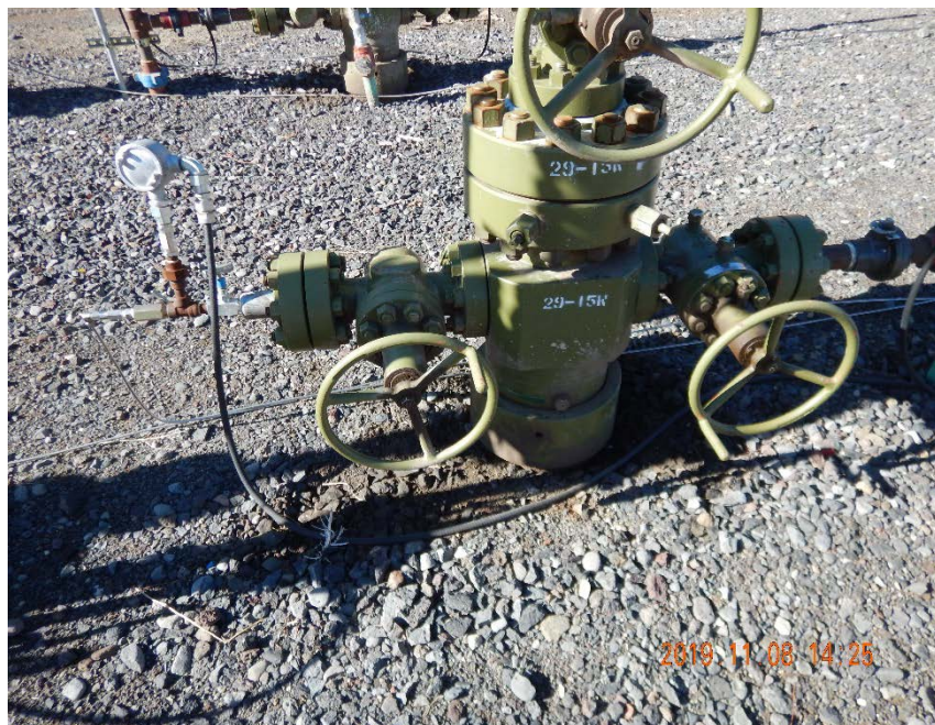
Photo #9 - View of oily waste accumulation beneath 29-15W wellhead.