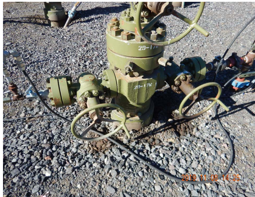
Photo #8 – View of oily waste accumulation beneath 29-17W wellhead.