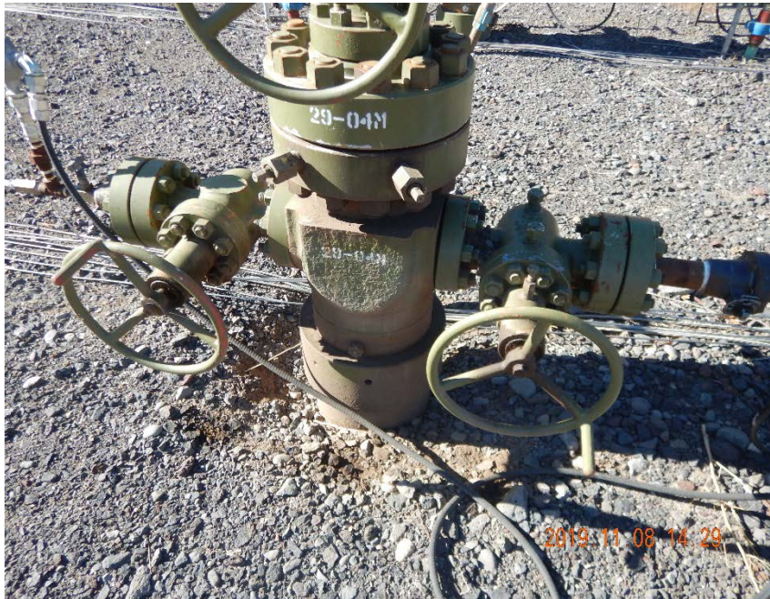
Photo #23 - View of oily waste accumulation beneath 29-04M wellhead.