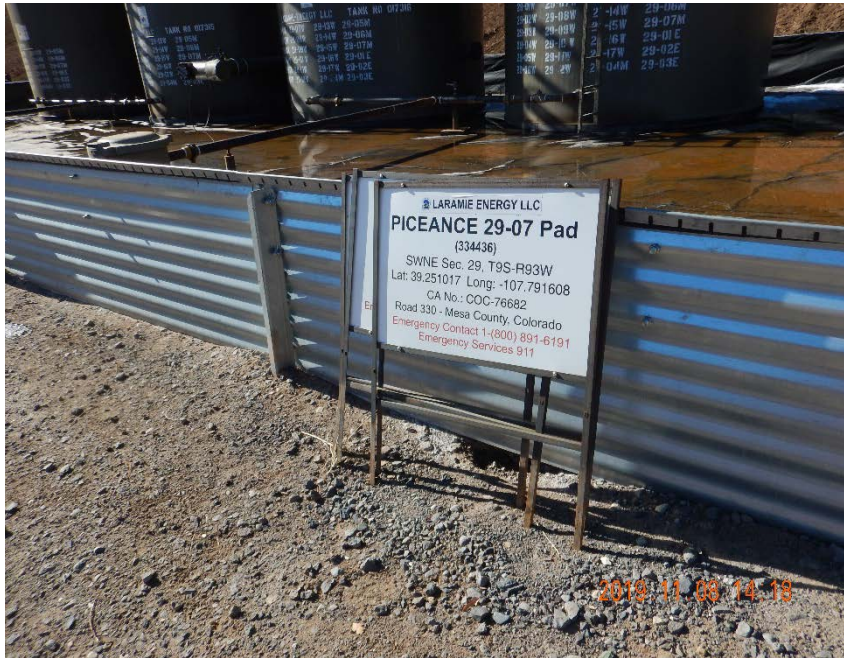
Photo #3 – Signs stored outside NE corner of tank battery were not installed on inspection date.