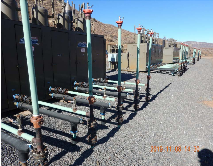
Photo #25 – Overview of heated vertical separators from southeast.