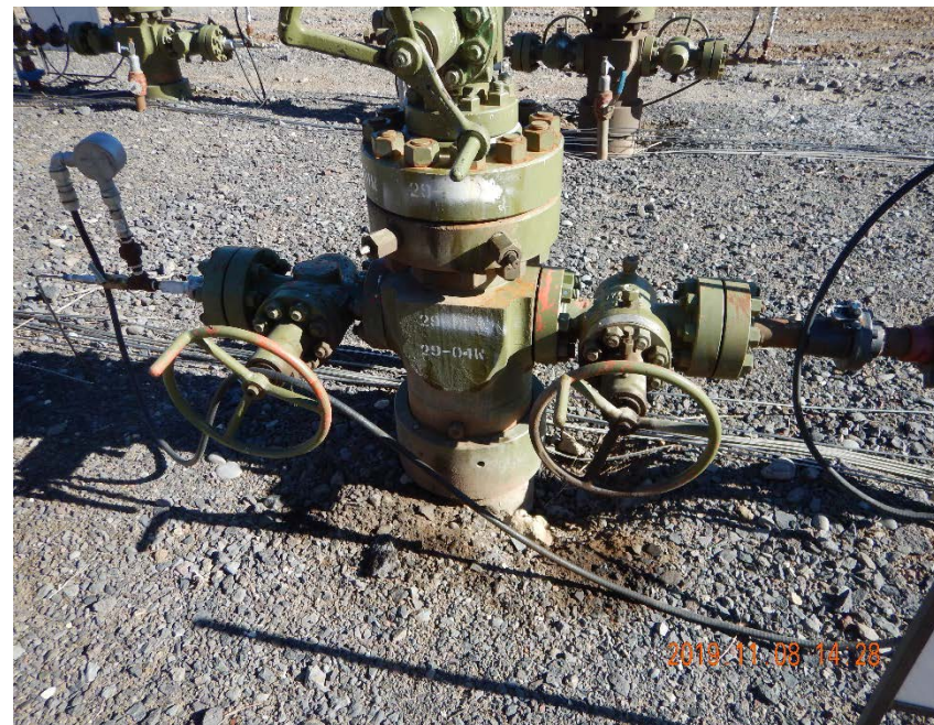
Photo #18 - View of oily waste accumulation beneath 29-04W wellhead.