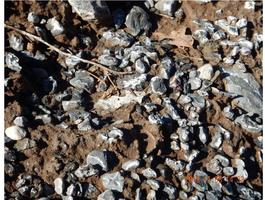
Photo #28 – View of salt staining on gravel in vicinity of 29-09W separator.