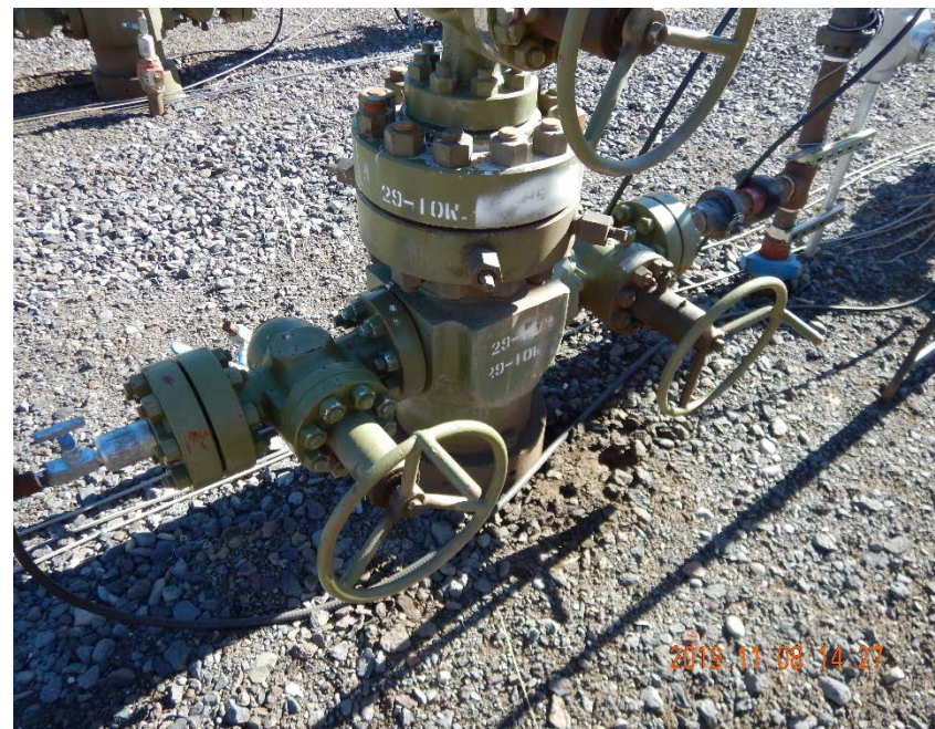
Photo #16 - View of oily waste accumulation beneath 29-10W wellhead.