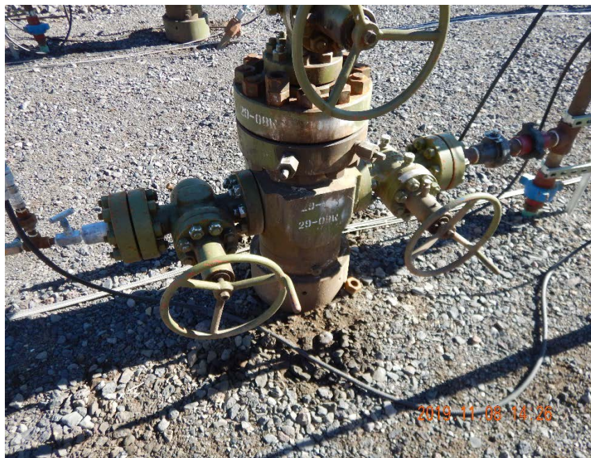
Photo #15 - View of oily waste accumulation beneath 29-08W wellhead.