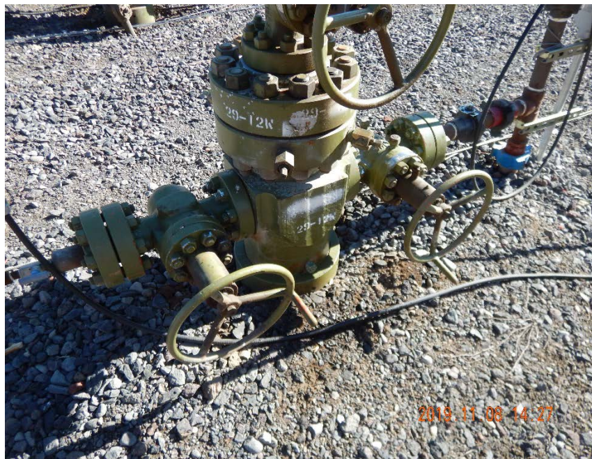
Photo #17 - View of oily waste accumulation beneath 29-12W wellhead.