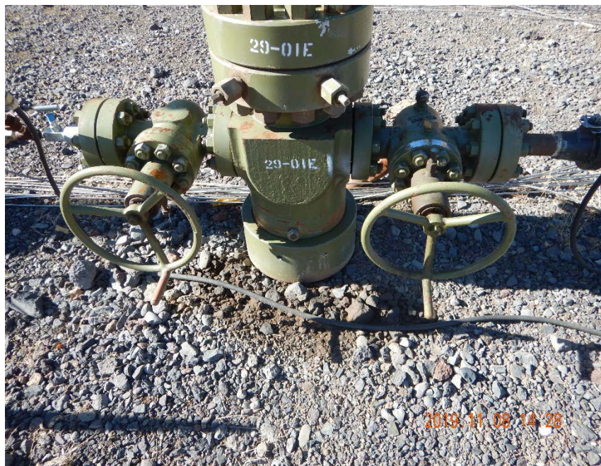
Photo #21 - View of oily waste accumulation beneath 29-01E wellhead.