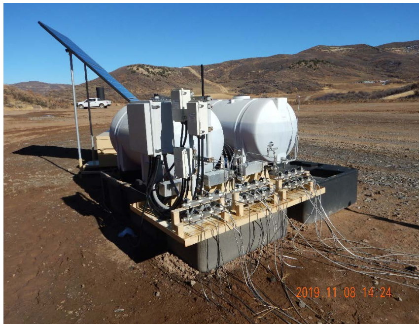
Photo #7 – View of day tanks and chemical pumps located north of wellheads.