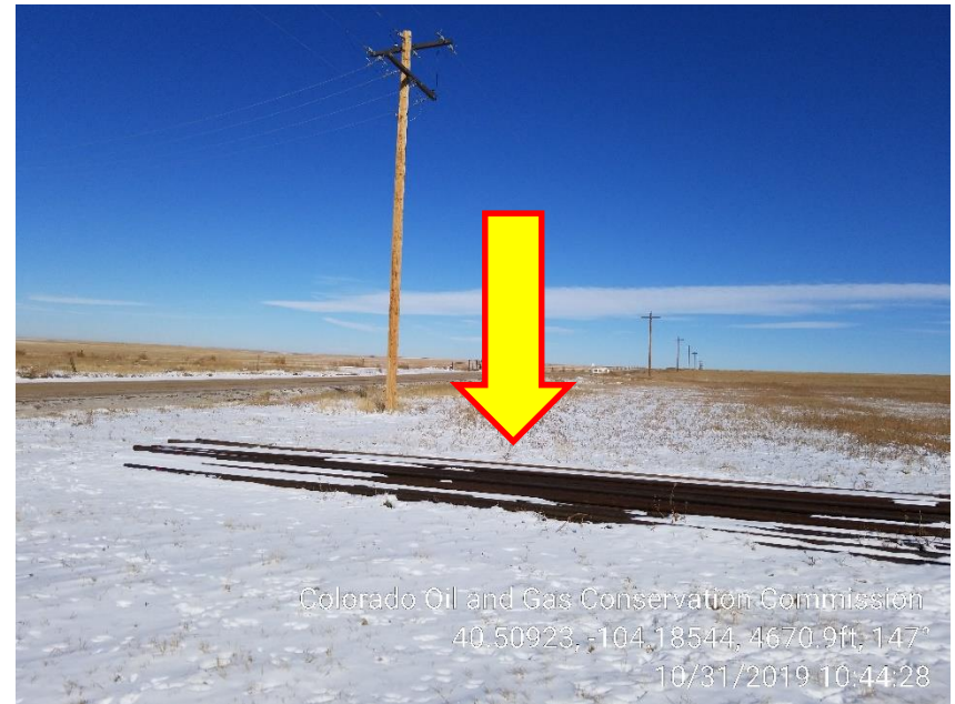
Photo 6– Tubing String on the North West of the Tank Battery Berm.