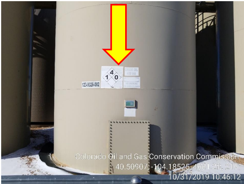
Photo 5 – Tank Content and Capacity label is faded no longer legible. NFPA Label also needs replaced.