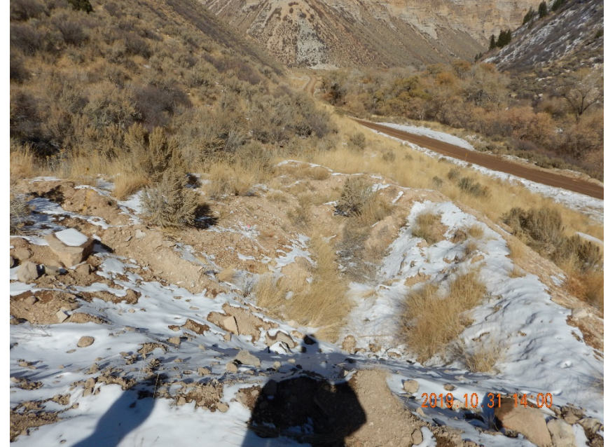
Photo #10 – Sediment trap located north of backfilled excavation. No hydrocarbon stains or odors were observed in this area on inspection date.