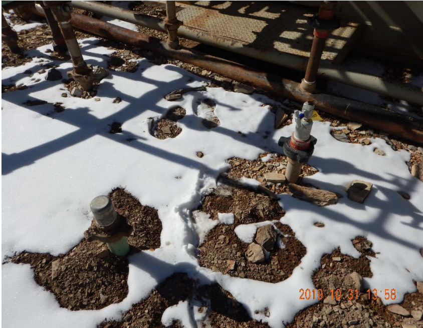
Photo #7 – Flowline risers east of separators. Flowline riser with 1" valve has been tagged out.