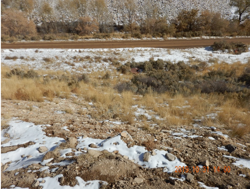
Photo #9 – Downhill area east of backfilled excavation. No hydrocarbon stains or odors were observed in this area on inspection date.