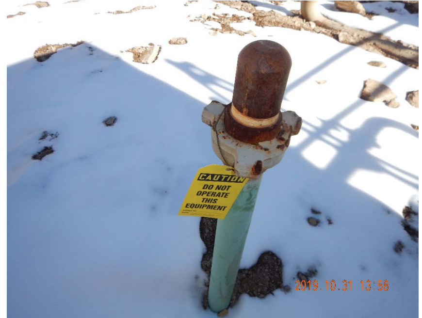
Photo #6 – Flowline riser north of separators has been tagged out.