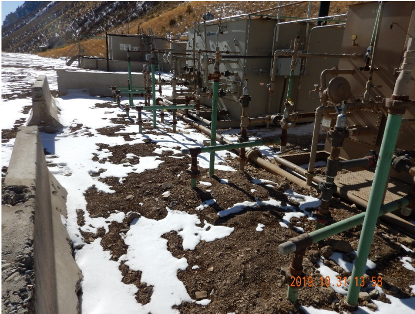
Photo #3 – Backfilled excavation area, located east of separators.