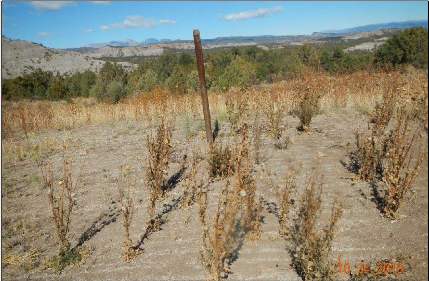
Photo 2. View of the plugged well marker facing northeastward. Area is infested with musk thistles, and revegetation is sparse in this area.