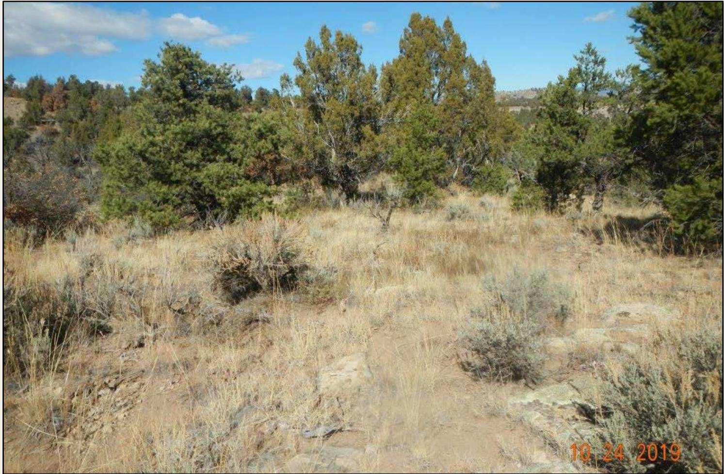
Photo 6. View of reference are vegetation comprised of mixed pinyon juniper woodland, and sagebrush shrubland with native grasses such as James galleta and forbs such as perky Sue.