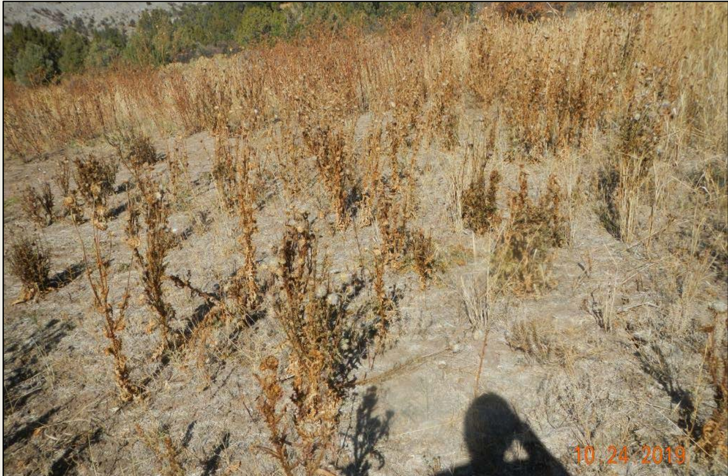
Photo 3. View of musk thistle infestation within the project area.