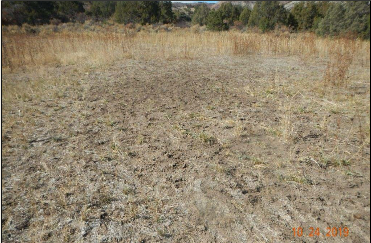
Photo 4. View of area north of wellhead with poor revegetation.