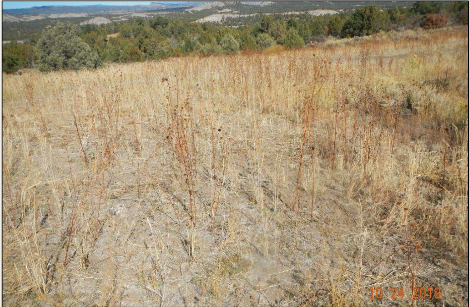
Photo 1. View of the project area from the well entrance facing center.