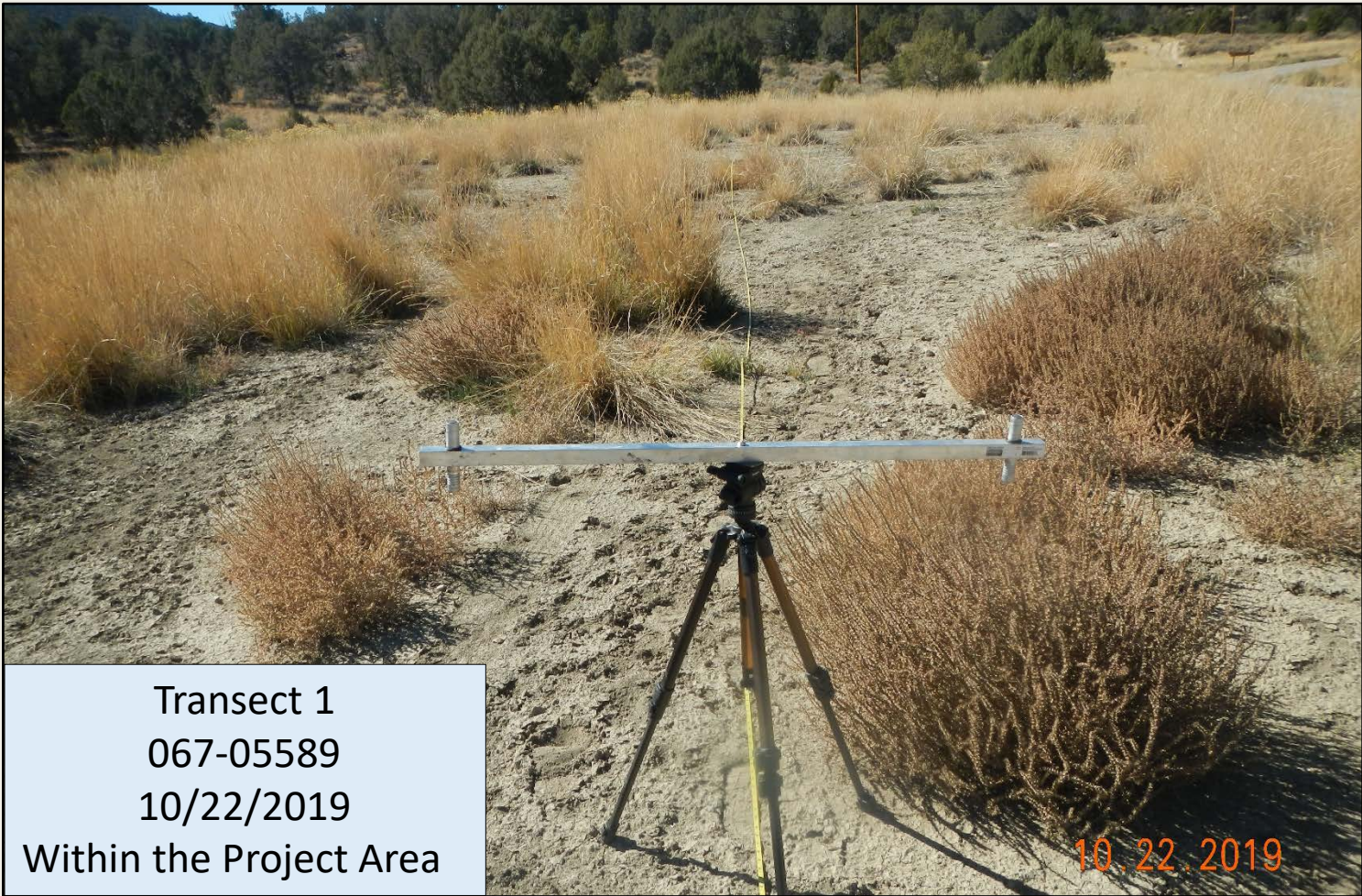
Photo 3. View of the beginning of Transect 1, within the project area, facing westward.