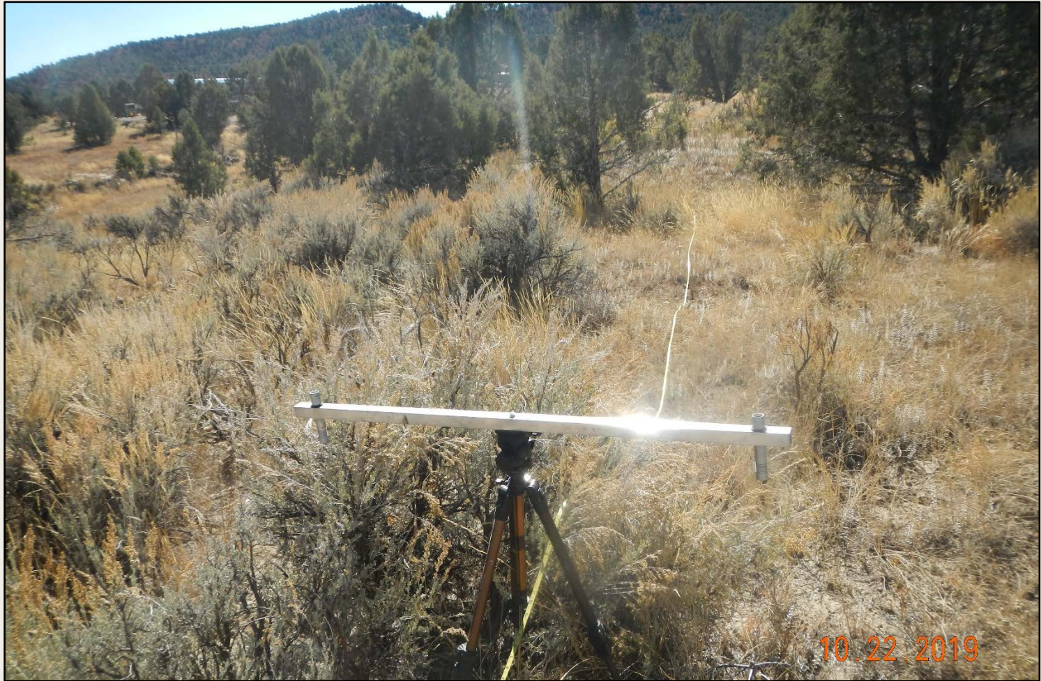
Photo 6. View from the end of Transect 2, within the reference area, facing northward.