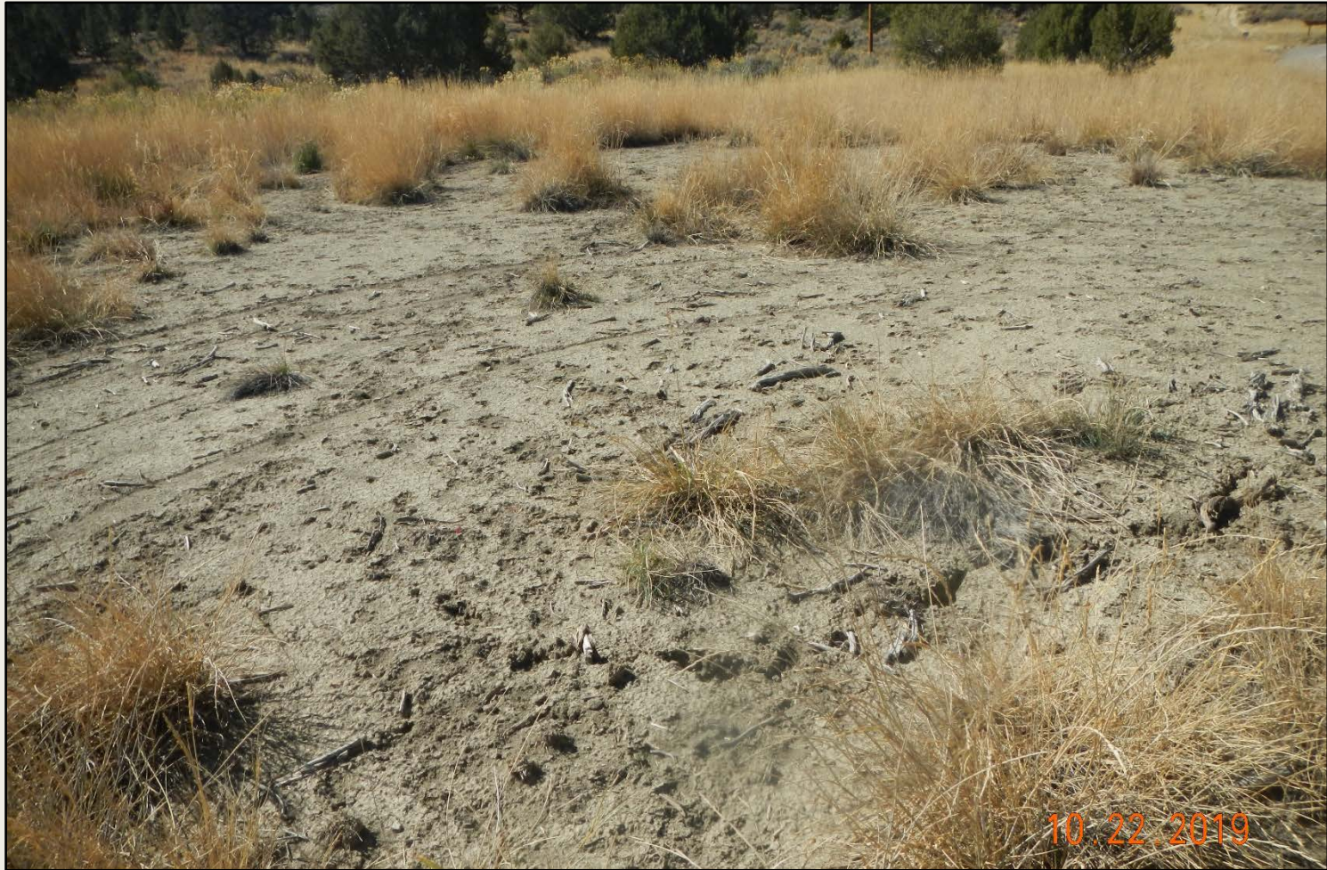
Photo 1. View of the former well and facilities area where vegetation is not becoming established.