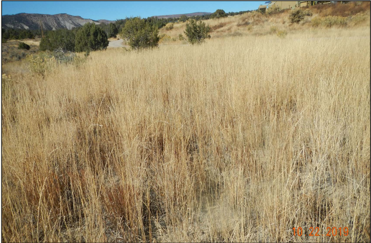
Photo 2. View of the southern project area from the southeastern edge facing northwestward. Revegetation is progressing here with grasses such as western wheatgrass and smooth brome.