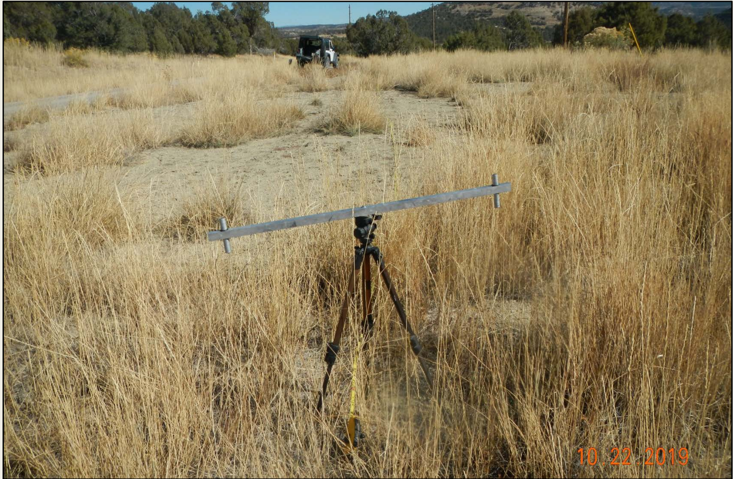
Photo 4. View from the end of Transect 1, within the project area, facing eastward.