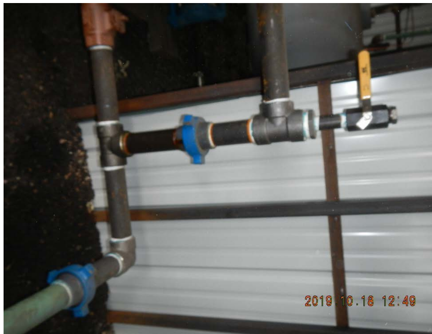
Blue hammer union weeping fluids.