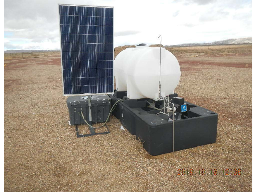
Unmarked chemical storage unit.