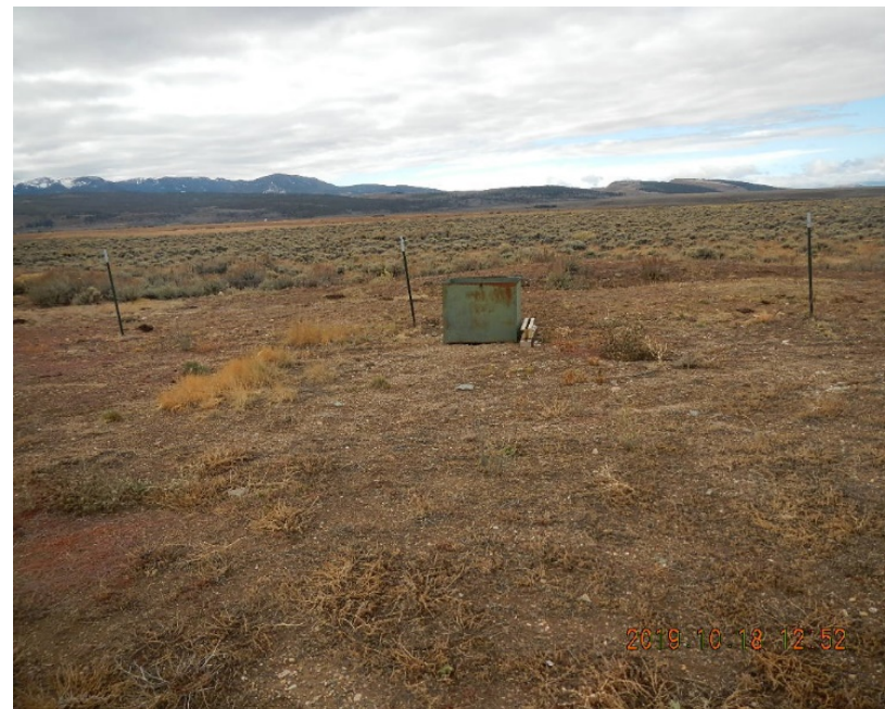
Metal container in NW corner of Location with trash and debris.