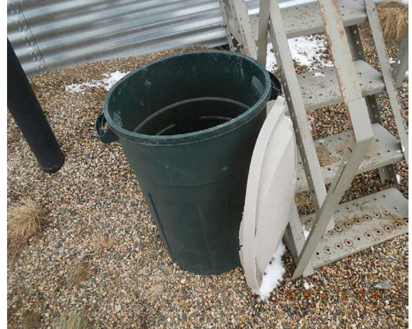
Trash can with oily rag and trash.