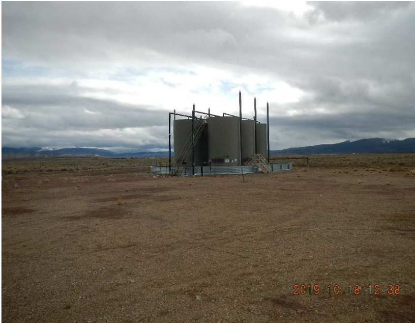
View of tank battery.