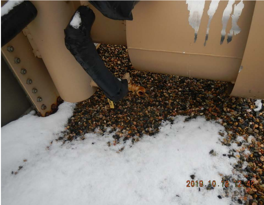
Drain valve at in-tank heater.