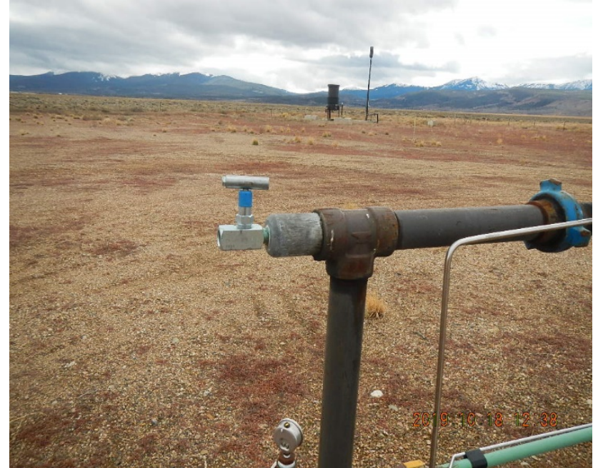
Needle valve not capped.