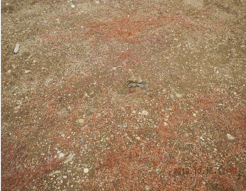
Trash and debris (rag).