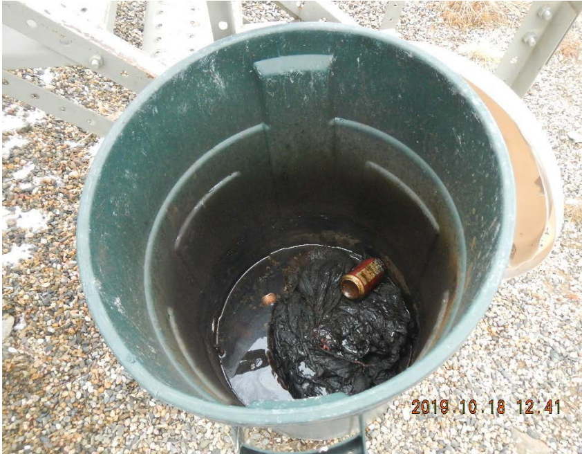
Trash can with oily rag and trash.