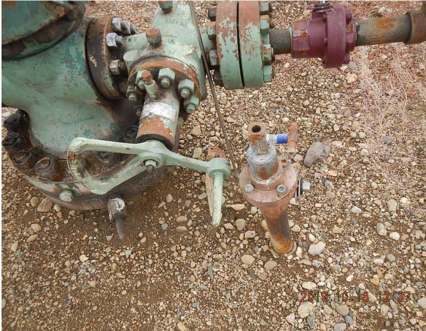
Unmarked and not cap riser.