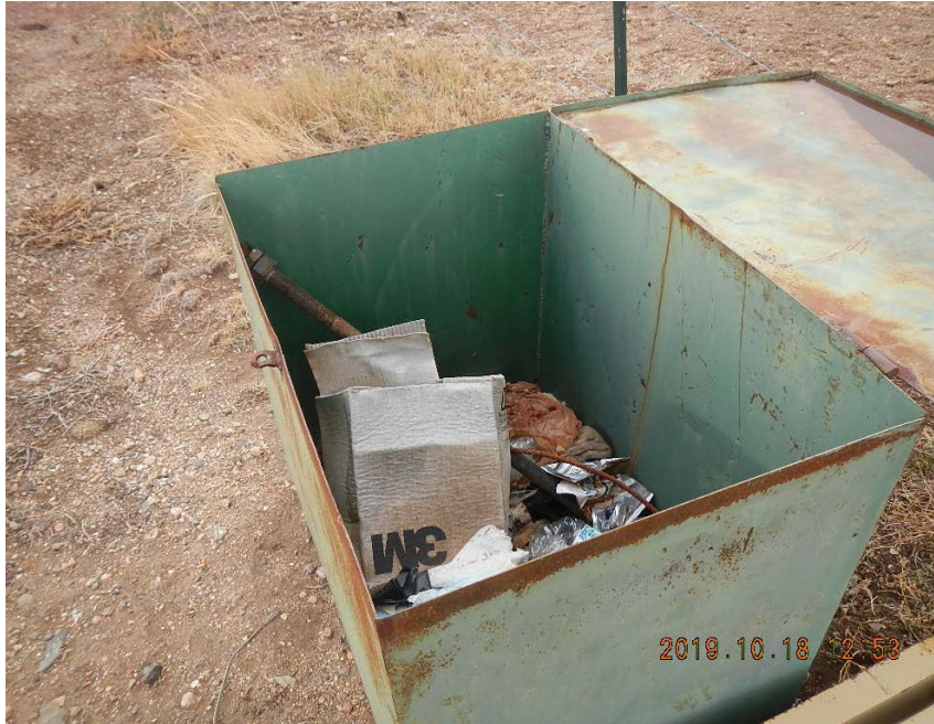
Metal container in NW corner of Location with trash and debris.