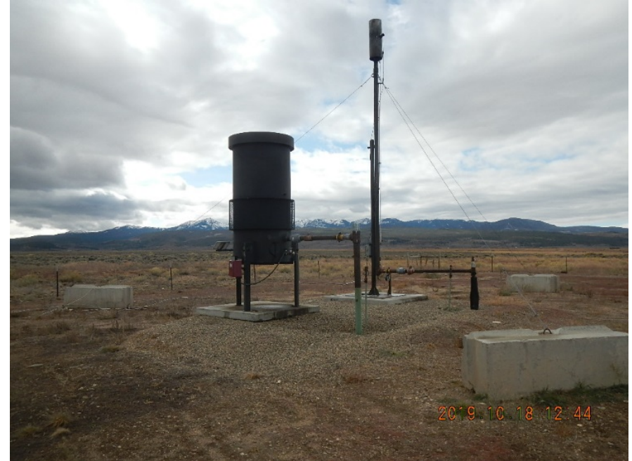
ECU and flare.