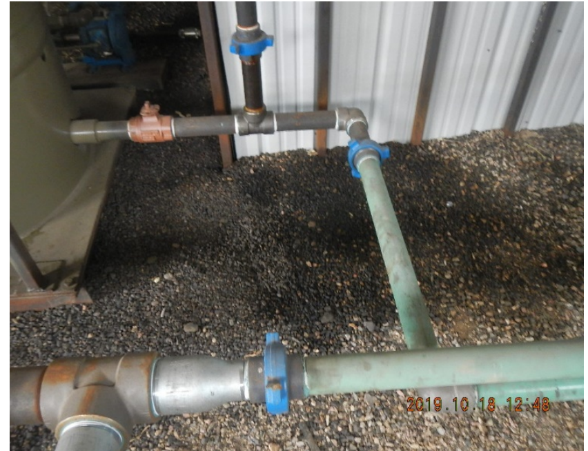
Oily staining in separator enclosure.