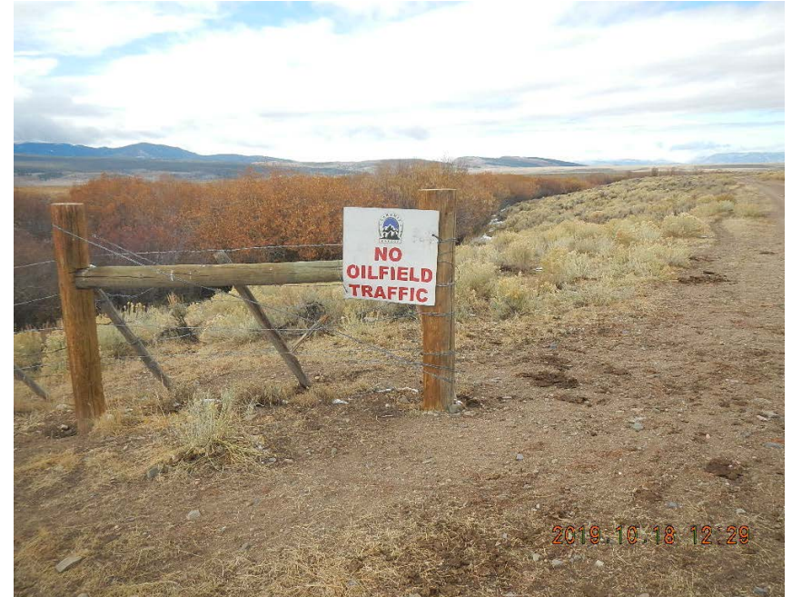
Direction sign to Location 324766.