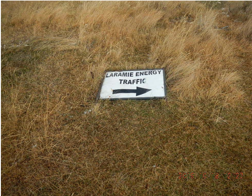
Direction sign to Location 324766.