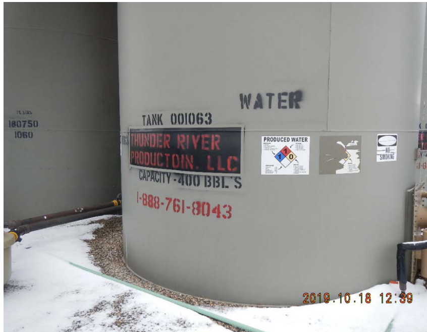
Produced water tank.