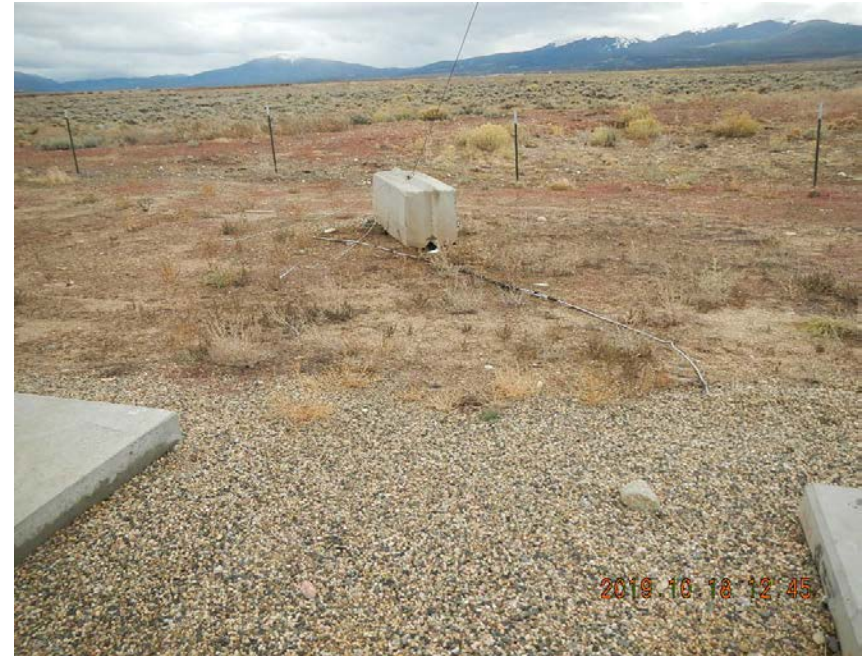
Stainless steel line is considered trash and debris.