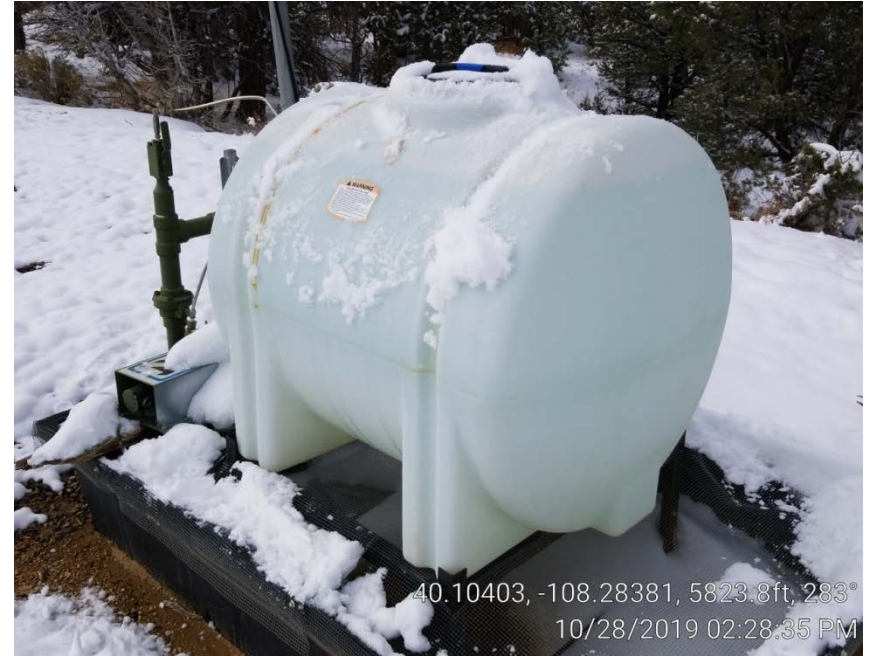
Photo 3. Container.